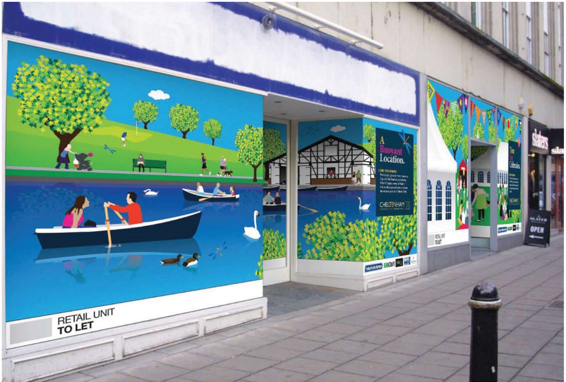
FREESPIRIT & BLACKS - CLARENCE STREET