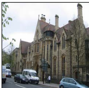
Figure 4 Ladies' College buildings