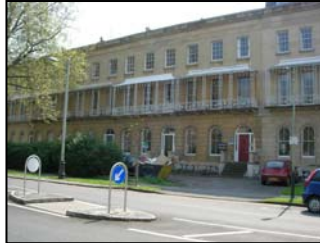
Figure 10 Queen's Parade

The main streets are broad tree-lined boulevards. Here, where there are terraces, they are usually set behind carriage drives which create a sequence of spaces; where there are villas, the space is frequently enhanced by their grand setting viewed through railings (many now removed) which add to the space. Queen's Parade is set back from public space. Some of the villas are behind hedges, which give some enclosure of the street, although the streets remain broad (e.g. west end of St George's Road) and there is little sense of being confined.