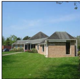
Figure 48 First Church of Christ Scientist