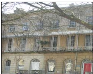
Figure 41 Verandas on Queen's Parade