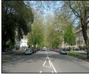
Figure 7 Linear form of Bayshill Road