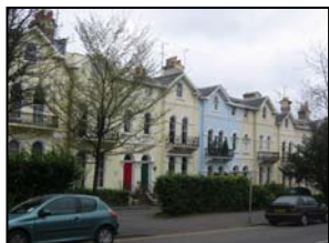
Figure 1 York Terrace