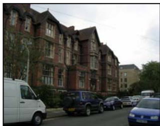
Figure 37 St Hilda's boarding house