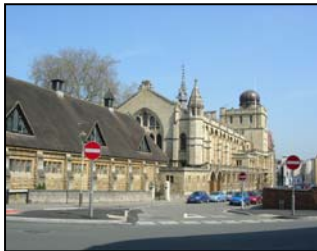
Figure 40 Princess Hall

5.20 Local details within the Bayshill character area collectively enhance the character and appearance of not just Bayshill but the whole of the central conservation area. Interesting historic local details include: