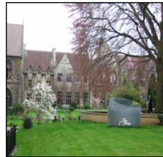
Figure 49 Gardens within the Ladies' College