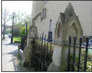
Figure 43 Historic gate piers enclosing the Magistrates Court car-park