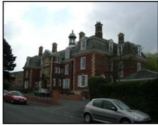
Figure 39 Astell

f. Astell residential care home because: