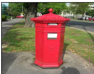
Figure 42 Pillar box on Bayshill Road

and character area generally. Railings enclose and contain public space whilst still permitting views, thereby not detracting from the character and appearance of properties. The painted white verandas on Queen's Parade have a double heart and anthemion motif to balustrades supplied by Carron Company. Bayshill Terrace has wrought iron verandas and arrowhead railings. The balconies have an anthemion motif derived from Henry Shaw's design for Upper Woburn Place. Royal Well Terrace contains wrought iron balconies and arrowhead railings. These features are collectively interesting, and their preservation in present day makes them particularly valuable.