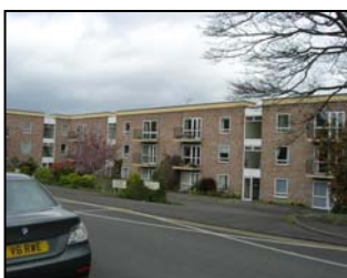
Figure 32 Flats on Overton Park Road