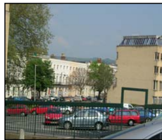
Figure 19 Cleeve Hill over terraces