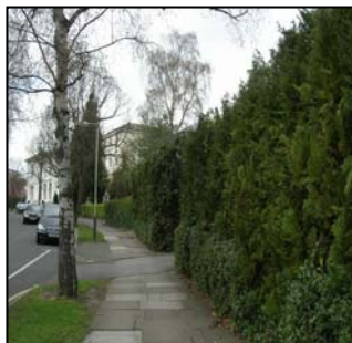
Figure 47 Hedging in Parabola Road