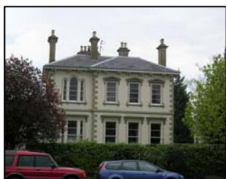
Figure 38 Stoneleigh