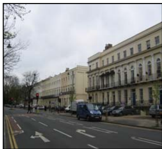
Figure 25 Terraces on St George's Road