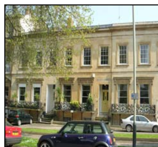
Figure 28 Architectural features on historic terraces