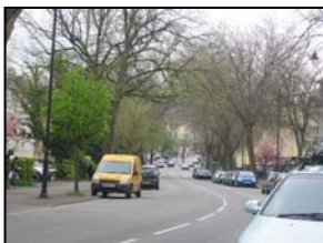
Figure 2 St George's Road