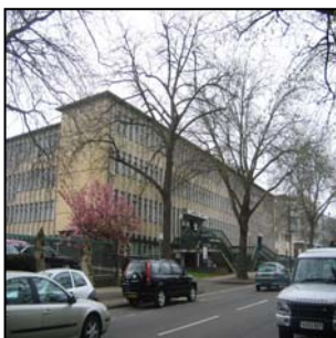
Figure 5 Magistrates Court