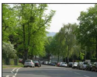
Figure 20 Tree-lined Parabola Road

Trees are an important historic feature within the Bayshill character area. They are often used with hedges as a soft boundary treatment – for example at the Hotel Kandinsky. Grass verges planted with trees still exist in Bayshill – while in other parts of the central area, although the trees remain, the grass is often now hard surfaced. In some areas, the green open spaces are more extensive as part of a building frontage, for example at Marchmont on Parabola Road. The setting of the rear of York Terrace on St George's Road is enhanced by the trees and railings along the River Chelt. Despite the overall sense of space in Parabola Road and Bayshill Road, the presence of trees gives enclosure when looking down the hill, towering above buildings stretching over the road.