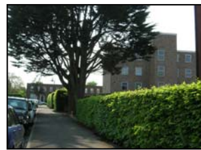
Figure 3 Overton Park