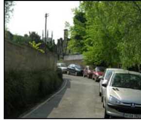
Figure 8 Curving form of Parabola Lane