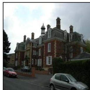
Figure 6 Astell