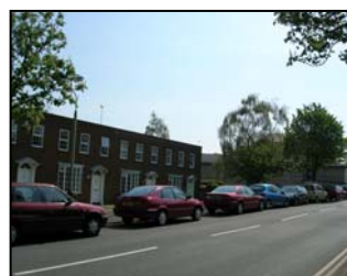
Figure 33 Red brick houses on Overton Park