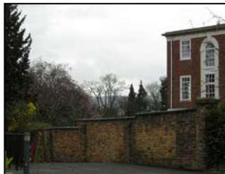
Figure 15 View of Cleeve Hill

There are some high brick walls used as a boundary treatment, for example around the rear of St Helen's boarding house. The staggered design of the wall permits views through trees of Cleeve Hill, creating a rural connection. Mature tree lined streets also act as a 'soft' boundary between pavement and road. Boundary enclosures in conservation areas are protected by Policy BE 5 'Boundary Enclosures in conservation areas' of the Cheltenham Local Plan.