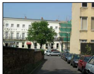
Figure 12 Bayshill Villas Lane