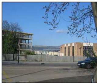
Figure 18 Extensive views of Cleeve Hill

St. George's Road, Western Road, Overton Road, Parabola Road and Bayshill Road all have extensive medium and long distance views. These views often terminate at the Cotswold scarp – either Cleeve Hill (as in views along Western Road) or Leckhampton Hill (from the high points of Parabola Road) - which can also be seen dramatically above the terraces and other buildings. There are further glimpses of the scarp and landmark buildings such as St Andrew's Church and St Gregory's Church through gaps between buildings. These views create a strong link between the built-up area and its rural surroundings, forming a welcome foil to the sense of enclosure generally experienced in a town.