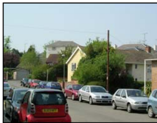
Figure 14 Bayshill Lane

To the west, the grain of the streets becomes tighter, but they always feel spacious and the plot structure is generous, only becoming constrained where there is more modern housing development, for example in the Overton Park area or Bayshill Lane.