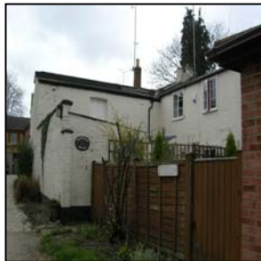
Figure 30 Cottage on Bayshill Lane

Cottages on Bayshill Lane and Parabola Close date from the 19th century and are vernacular in design. Their small scale functional design adds an interesting and valuable historic contrast to the dominance of the grand villas and terraces.