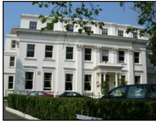
Figure 13 Villa on St George's Road

Parking on carriage drives of terraces and the former garden space of the villas does detract from many of their settings – particularly where there are poor quality or extensive areas of hard surfacing and where there is no boundary screening.