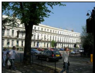
Figure 16 Terraces on St George's Road

Views are restricted by the presence of some buildings, for example, extensive terraces along St George's Road, some of which terminate views out of the character area. In contrast, low-rise buildings located on Bayshill Lane permit views of large villas on Parabola Road. This provides the villas with a sense of importance as they occupy a prominent position.