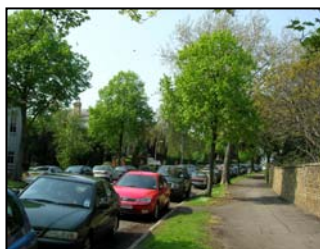
Figure 11 Parabola Road