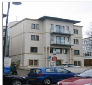
Figure 27 The Glasshouse