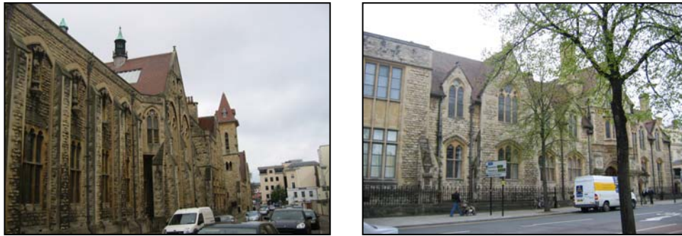
Figure 29 Architectural features on Ladies' College buildings

impacts on the street scene within its locality, largely influencing the area's character and appearance.