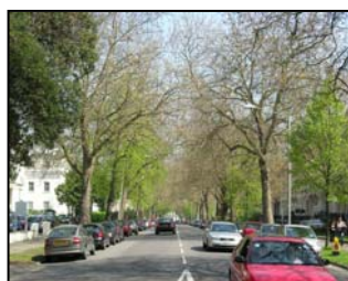
Figure 45 Trees in street scene of Bayshill Road