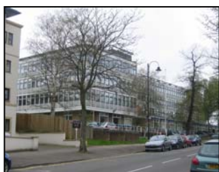
Figure 31 Rivershill House (Government Offices)