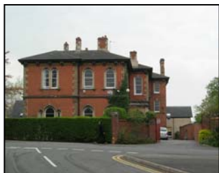
Figure 36 Sidney Lodge