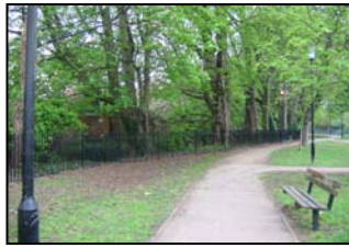
Figure 17 Footpath running alongside River Chelt.

The River Chelt is the northern edge of the character area. Its meandering route is followed by a linear park and its curving form restricts views, which constantly change.