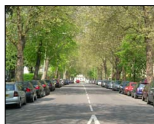
Figure 21 Tree-lined Bayshill Road