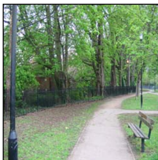
Figure 50 Green space running alongside River Chelt

The green space either side of the footpath by the River Chelt is an important and valuable open space within the otherwise built up character area. This space greatly enhances the area's overall character and appearance. The footpath following the route of the River Chelt provides an attractive boundary and division between the modern office blocks and car-parks along Jessop Avenue and the rear of historic buildings on St George's Road. Trees along the footpath create character, inhibiting views and providing enclosure to the footpath. These trees consist of Horse Chestnuts and Limes and are