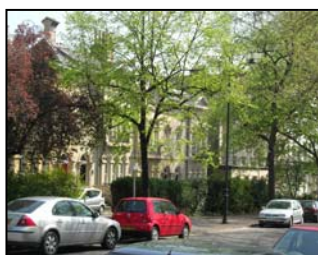
Figure 44 Trees in street scene of St George's Road