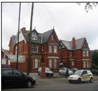
Figure 26 Villas on St George's Road