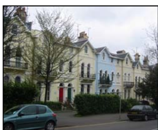
Figure 24 Houses in York Terrace

However, the predominant use in Bayshill is housing. Extensive neo-Classical and Italianate terraces, built in the Regency and early Victorian periods, are positioned along St George's Road and Parabola Road. There are also a large number of villas, many remaining in residential use (often multiple occupation), which perhaps dominate the character and appearance of Bayshill's character. These villas are set within large grounds, and reflect the historic plot form.