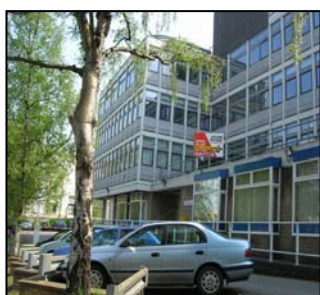
Figure 22 Government Offices