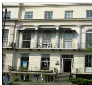
Figure 23 Offices in converted 19 th Century houses