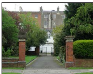
Figure 35 Grange Stables