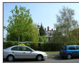
Figure 46 Trees screening Astell from Overton Road