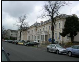
Figure 34 Carlton Hotel