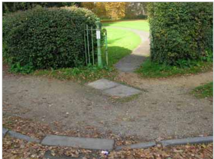
2007 South east gateway

The sense of arrival into the green space varies according to the state of decay and surface treatment at each gateway. To the south west there is a hard surfaced bitmac path which leads into the square and surrounds the gateway to the south west corner, which enhances the sense of arrival and leads the visitor into the square. However, to the right, alongside Clarence Road, this hard surface soon gives way to a compacted gravel and dirt surface. To the left along Clarence Square West the hard surfaced path stops abruptly and the grass verge has no footpath. Clear desire lines within the grass indicate the amount of foot traffic along this verge and the clear need for a footpath.