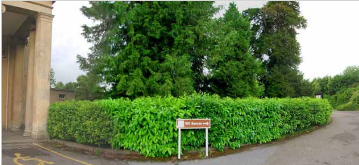
2007 Planting to north east of Pump Rooms

To the north of the gateway, mature trees and shrubs provide a green backdrop to the car park. A dense, clipped Laurel ( Aucuba japonica ) hedge defines the planting bed adjacent to the Pump Rooms. Within the bed stands a mature Yew ( Taxus baccata ) and several Western Red Cedar ( Thuja plicata ). A low, brown metal sign directs cars towards the car park.