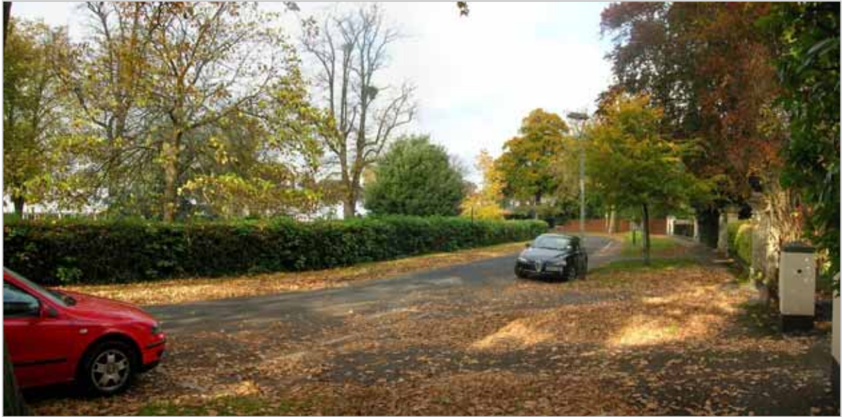
2007 Pittville Crescent looking north west