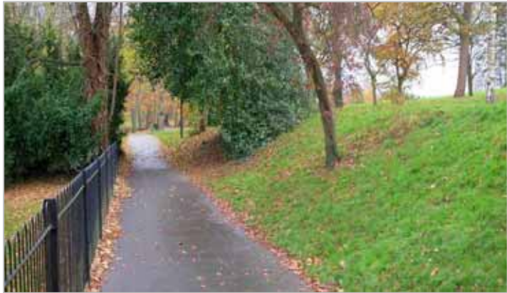
2007 Footpath through character area (above) mature tree (below)

A hard surfaced bitmac footpath runs parallel with the lake, passing close by the Boathouse at this point. This is the only footpath in the character area and it follows a circular route around the entire Lower Lake. The surface treatment is well maintained and the footpath is sufficiently wide to allow park users to pass with comfort although cyclists using the footpath do cause temporary pinch points, especially where mature trees line the route.