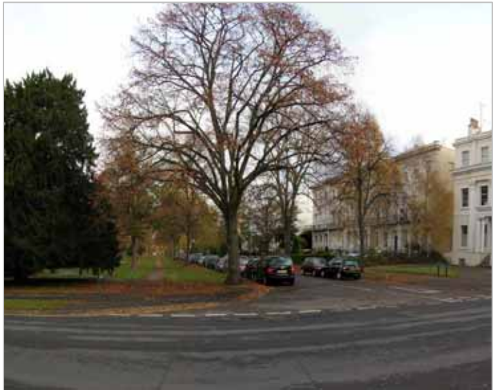
2007 Junction with Pittville Lawn and Wellington Road

The overall character of the lawn is enhanced by the mature deciduous and evergreen trees, both on the lawns and along the various surrounding roads. On this southern lawn the pattern of planning appears to be more random and views out towards the surrounding residences are blocked by the mature trees and shrubs. Some of the trees and shrubs are in need of maintenance work to check their growth and restore condition. The overgrown nature of some of the trees and shrubs gives an impression of danger and may lead to users becoming uncomfortable using this space.