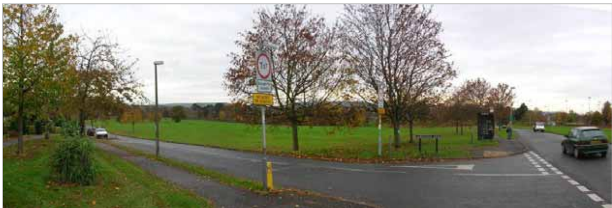
2007 Tommy Taylor's Lane to the west and Albermarle Gate to the north

The western boundary of this area is defined by Tommy Taylor's Lane. To the north the area is defined by Albermarle Gate with the front gardens of residential houses beyond. To the south is the western end of the Lower Lake and the Agg Gardner West character area, which is divided from Marle Hill by a hard, bitmac surfaced footpath which leads east from Tommy Taylor's Lane towards the Lower Lake. To the east the central Marle Hill sub area.