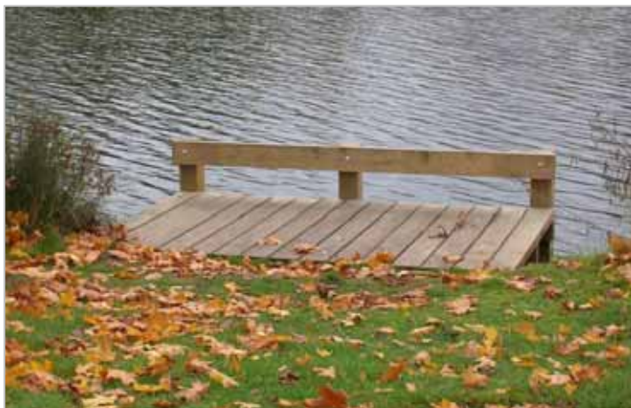
2007 Fishing Jetty

A buoyancy aid is provided close to the lakeside.