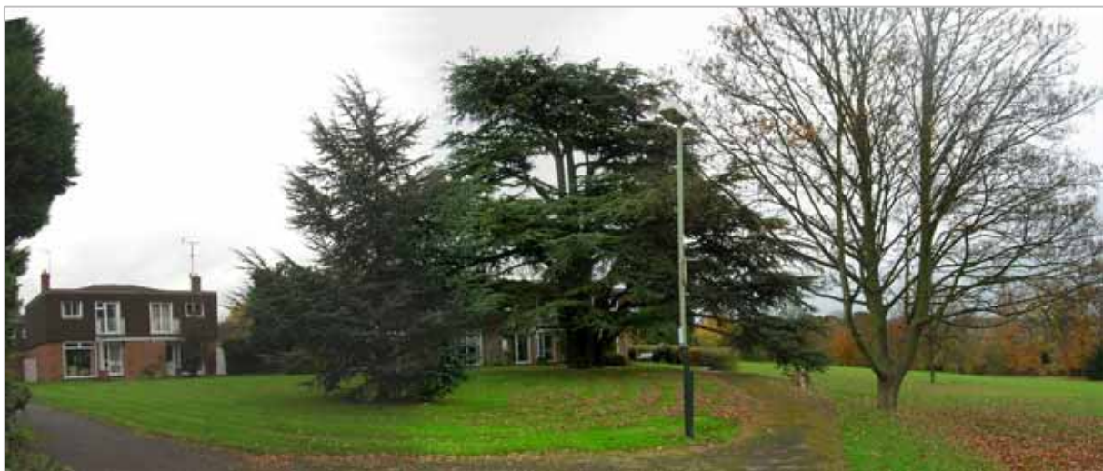
2007 Cedar of Lebanon contributes to the character and setting of Marle Hill

To the north east of this sub area the boundary becomes delineated from the residential houses by mature shrubs and trees. This planting provides visual and seasonal interest along with a valuable habitat for wildlife.