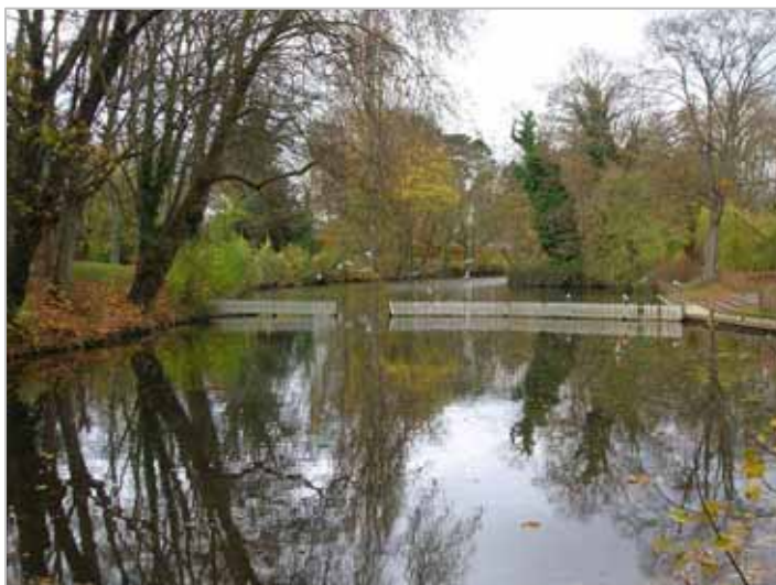
2007 The Children's Boating Lake

Wyman's Brook enters the Lower Lake beneath the wooden bridge. At this point the lake has been shallowed to create the Children's Boating pond.