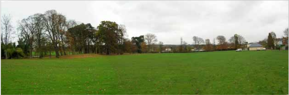
2007 The mature trees and bunds to the north form a boundary with the Lower Lake Character Area

and recreational purposes. A football pitch is often marked out here and local teams use the area for practice.