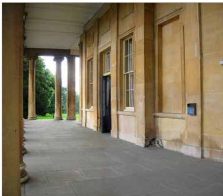
2007 East colonnade

From the gateway a number of mature trees and shrubs are visible to the south of the Pump Rooms.