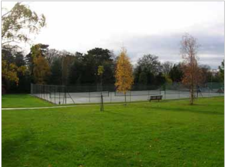
2007 Tennis courts

These courts are surrounded by a standard, pig mesh green fence and are located close to the boundary with the A435 Evesham Road.