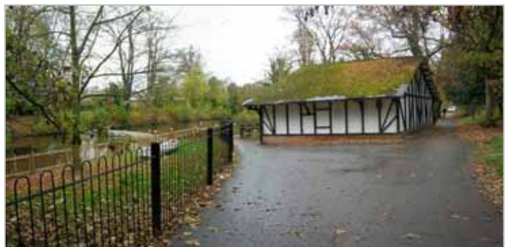
2007 Boathouse from the east (above) and west (below)

The north lakeside area runs from the Boathouse in the east to the western extent of the lake, where the footpath branches off to the south. To the north is Marle Hill, which slopes steeply upwards towards the Albermarle residential area to the north of Cheltenham. To the south is the Lower Lake.