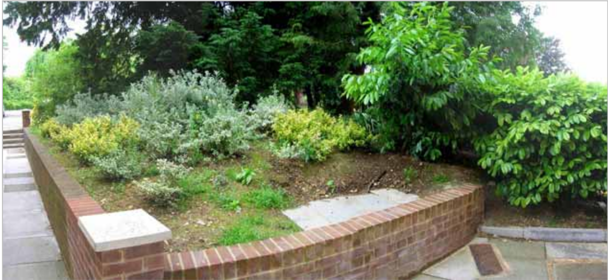
2007 New planting

To the east of this narrow courtyard is a low, red brick wall which retains a planting bed filled with mature shrubs and trees. Some new planting is in the process of being established here and sections of the wall have been recently replaced. Once established, this planting will provide a pleasant screen to the car park and interest for visitors who use this narrow courtyard space.