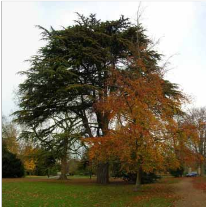
2007 Mature Trees (above) Central Cross café (below)

The trees are spaced sufficiently to allow good views of the surrounding villas and neighboring spaces.