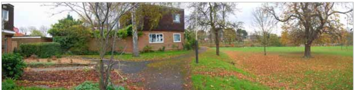
2007 Footpath to the north of Marle Hill centre