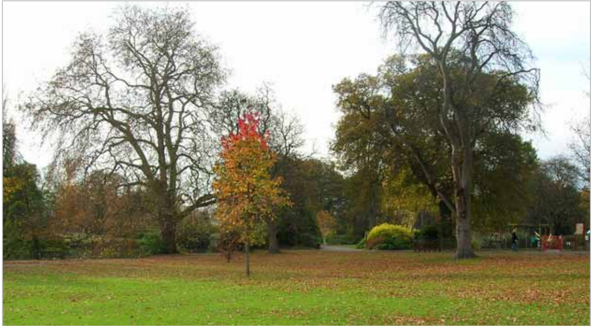
2007 Mature Trees

Mature species such as Horse Chestnut ( Aesculus Hippocastaum ), English Oak ( Quercus Robur ) and Beech ( Fagus Sylvatica ) are present towards the outer edge of the lawns and towards the area boundary. There is an increasing selection of 'memorial trees' being planted between the mature trees. The memory trees species are wide ranging and appear to be planted in a haphazard manner.