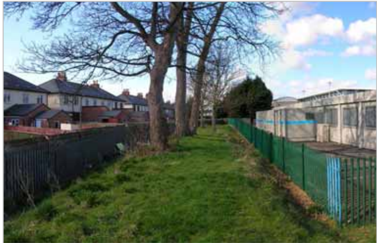
2007 Southern boundary

There is a large amount of rubbish within this strip of land, which appears to originate from the houses beyond.