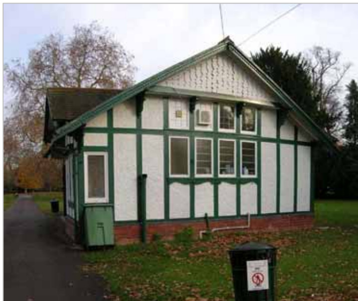
2007 Central Cross Cafe

The building, painted timber frames with cladding and brickwork, has a unique style and character which contributes to the overall setting of Pittville Park.