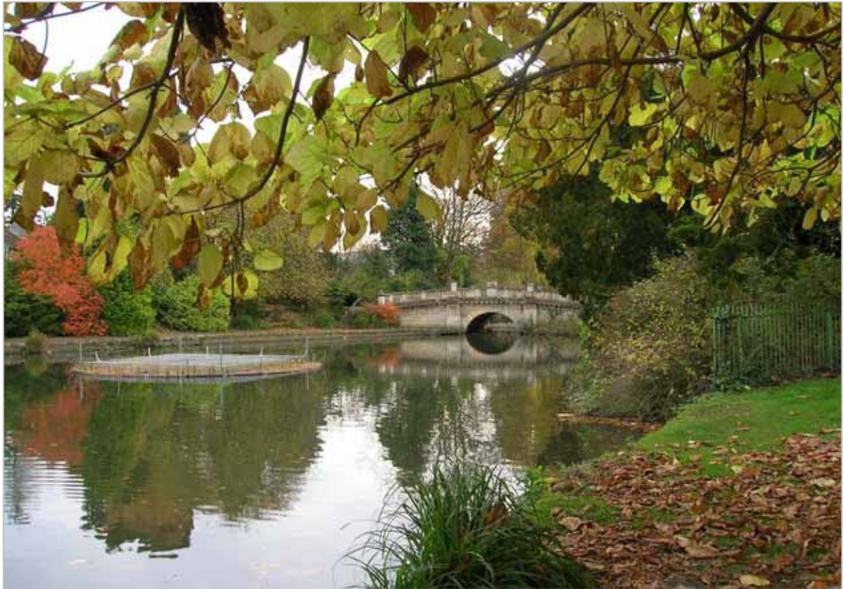
2007 Views across the Upper Lake (above and below)

At the north west point of the fenced play area, there are views back across the grassed play area, Pump Room lawns and the mature planting around the Upper Lake.