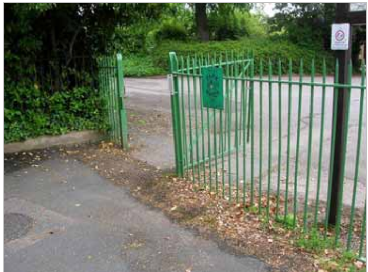
2007 Pedestrian gateway

A collection of signs and notices have been attached to the ironwork which gives a cluttered appearance.