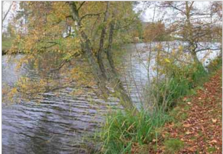
2007 North lakeside trees

There are a number of mature trees which extend down to the water's edge, some saplings have taken a foothold in the lakeside itself.