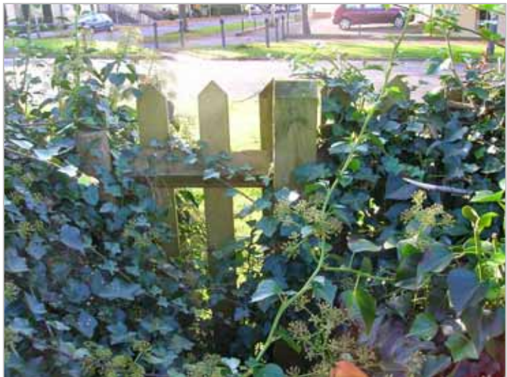
2007 Section of wooden fencing

The Holly hedge is, has, in places been colonized by tree spalings, Ivy and a selection of weeds and although there is evidence of spraying along the foot of the hedge, these invasive species are beginning to take a foothold and contribute to the overall appearance of neglect.