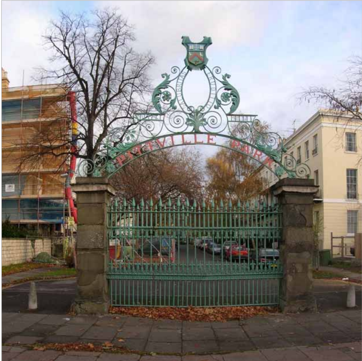
2007 Pittville Gates

The Pittville Gates, dating from 1897 were added to stone piers which date from the beginnings of the estate. The original ironwork was replaced in 1932 and subsequently removed during the Second World War. The gates we see today date are replicas and mark the entrance to the Pittville Estate.