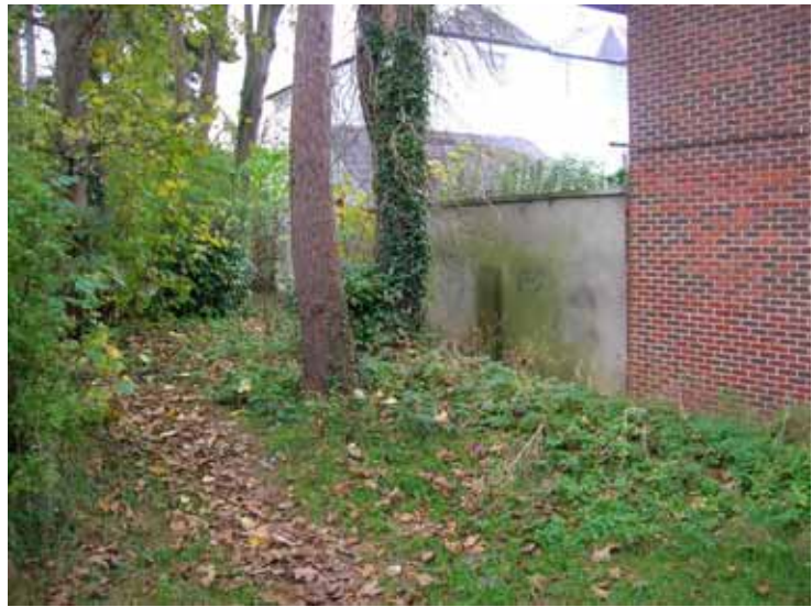
2007 Boundary wall

There are several pathways through this dense planting and an amount of litter indicating that it is a well used and hidden area within the park.