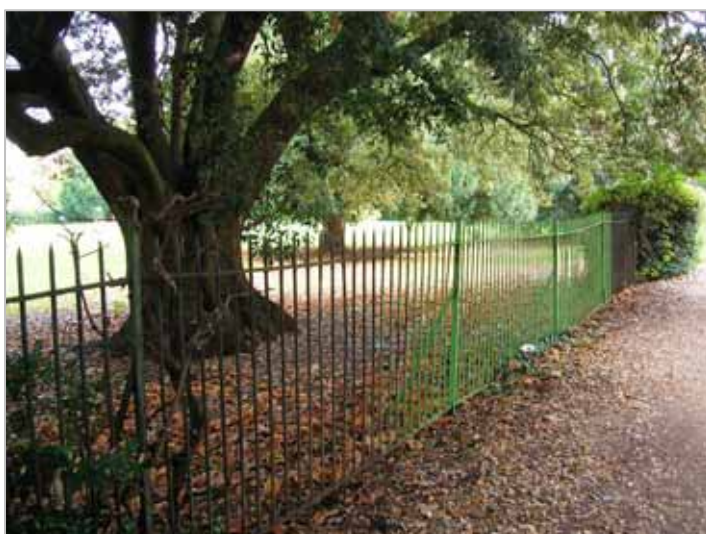
2007 Clarence Square South railings