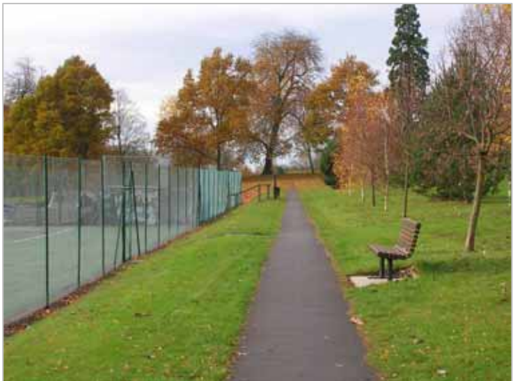
2007 Bench facing the tennis courts (above) and missing bench (below)

There is one bench sited adjacent to the footpath to the north of the tennis courts. One other base for a bench is sited adjacent to the skateboard park, however the bench is missing.