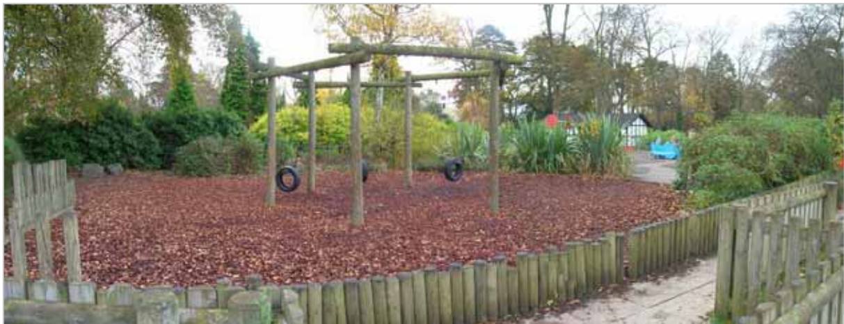
2007 Equipment for older children

There is an area of kit for older children, located to the side of the play area which comprises one frame with swinging tyres, providing little play value other than swinging. There are tyres missing for the frame limiting the number of children who can use the equipment at any one time. A bark surface is provided beneath this piece of equipment which sits well in the parkland setting and softens the landscape.