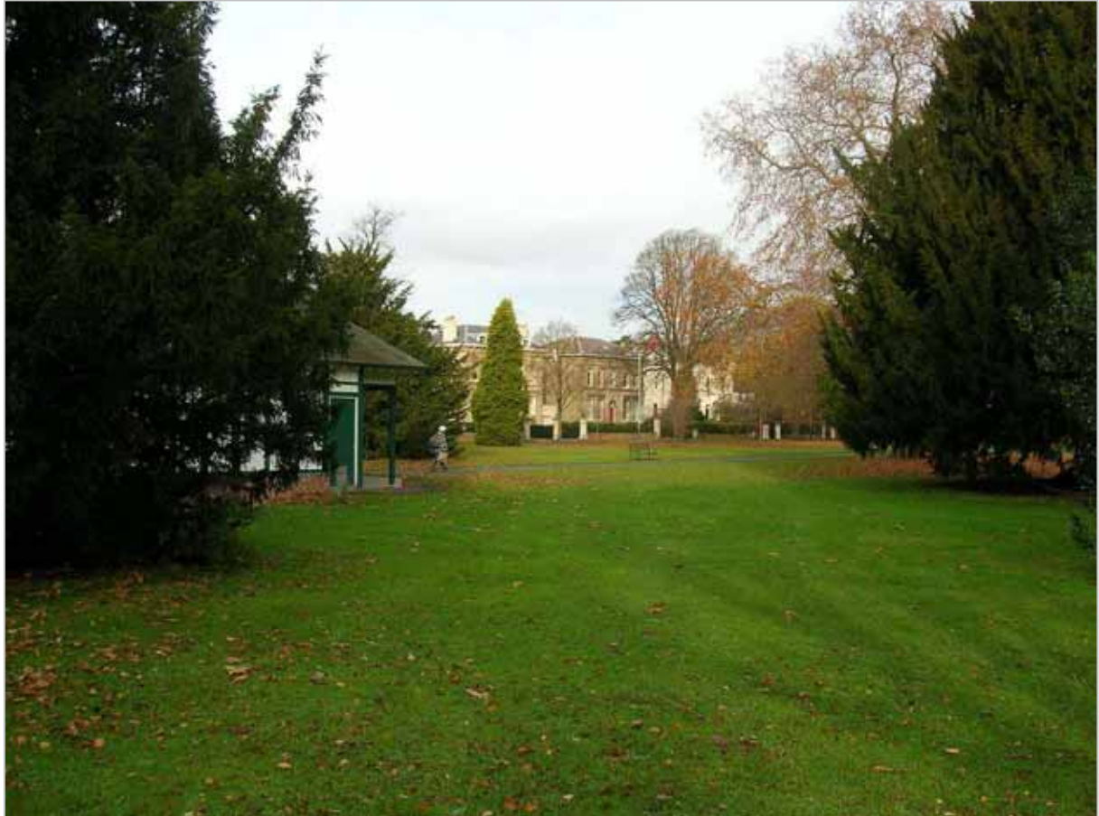
2007 Pittville Lawn North

The long gardens or lawns extend south from the Upper Lake but do not line up with this vista. Originally planned as pleasure grounds, the 1845 plan shows random plantings with no formal vistas. Today, trees and vegetation have matured to close views within this area, although natural gaps between the trees do afford glimpses of neighbouring trees and the surrounding residential houses along Evesham Road and Pittville Lawn.