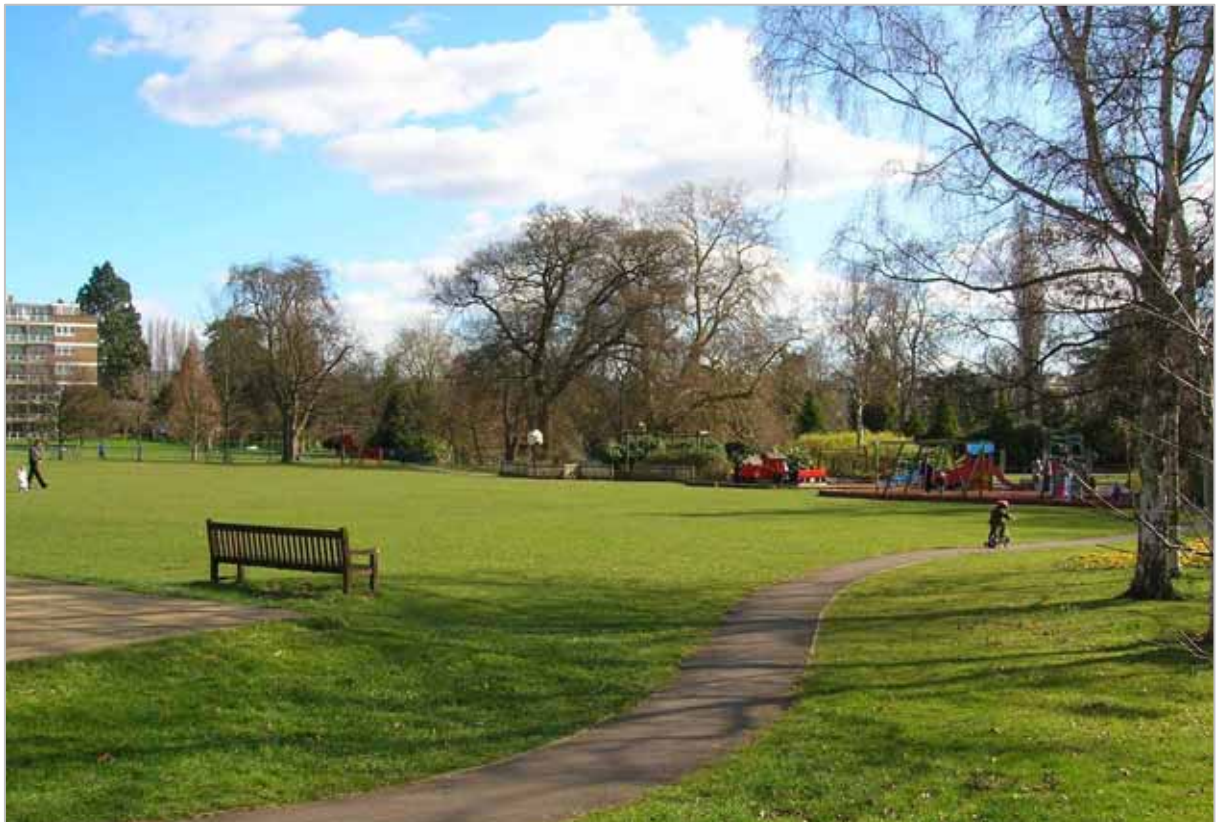
2007 View across play area towards Upper Lake