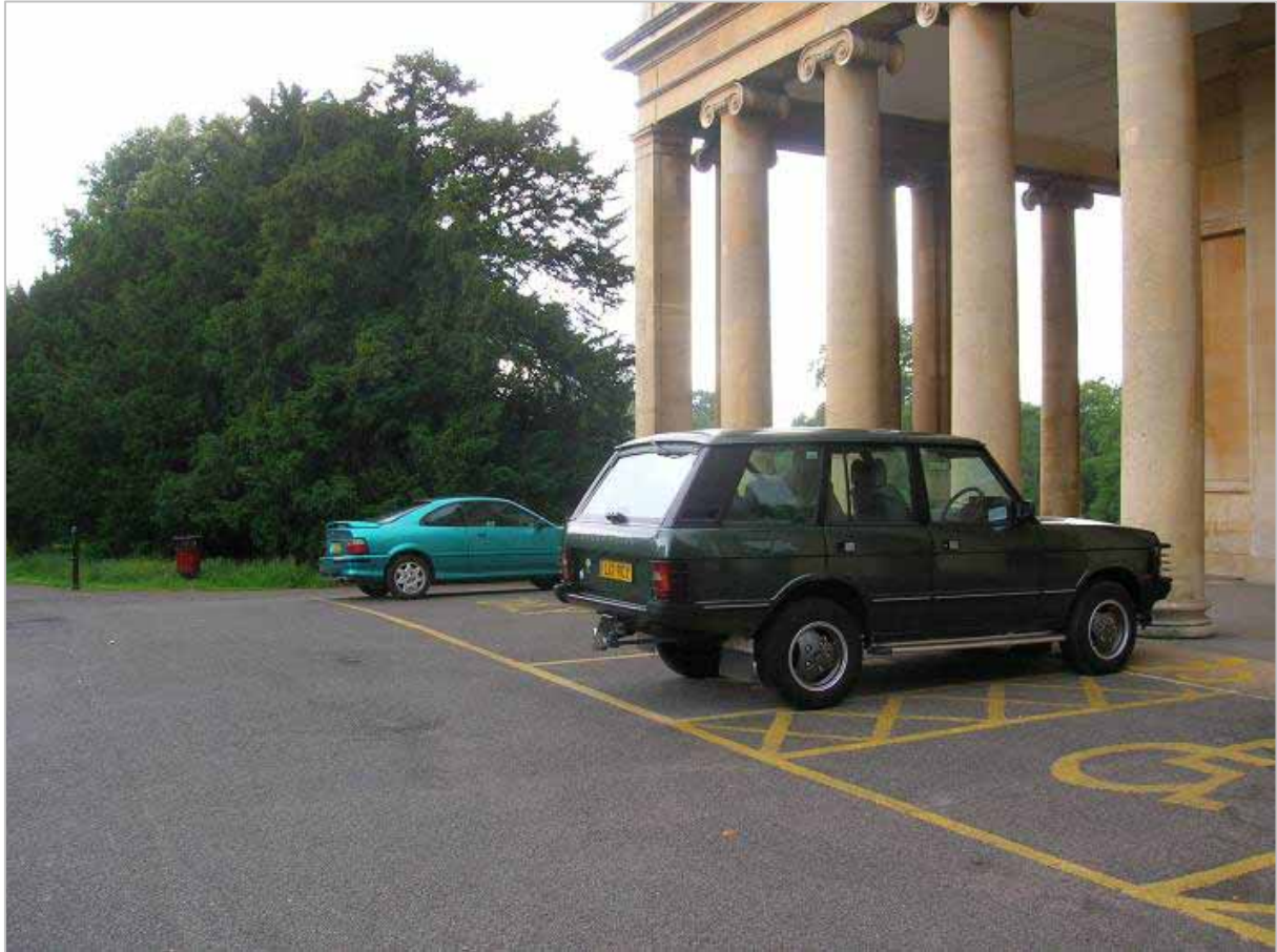
2007 Disabled parking adjacent to the Pump Rooms

There is a narrow pedestrian gateway to the south of the railings, which enables access directly from the pedestrian footpath running adjacent to East Approach Drive. The iron railings to the south of the gateway have a variety of posters and notices attached and give a cluttered appearance.