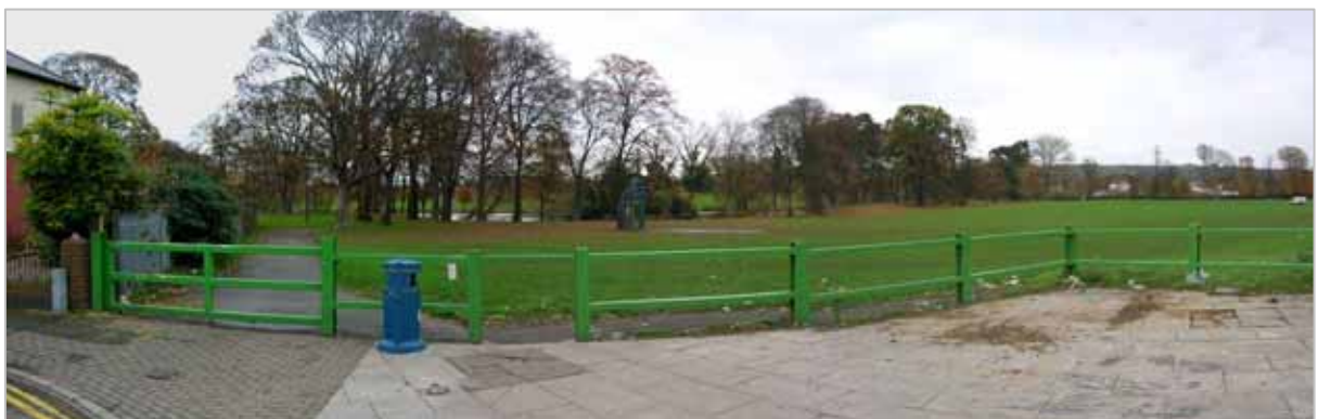
2007 St Paul's main gateway