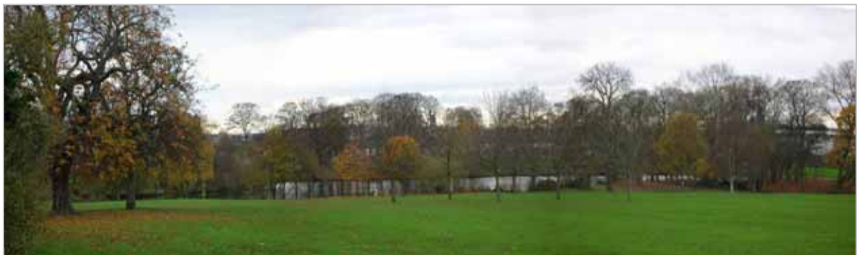
2007 looking south towards the Lower Lake

This sub area is all south-sloping grassland with scattered mature and semi-mature trees to the outer boundary areas. The terrain here is gently undulating compared to the western sub-section, as it is believed that this sub area was not used as a household and commercial tip and so the ground is not 'made up' as it is to the west. There is a very clear visual line in the grassland which divides these two sub areas.