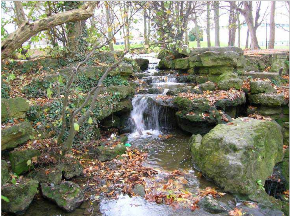
2007 Waterfall (above) Wyman's brook (below)