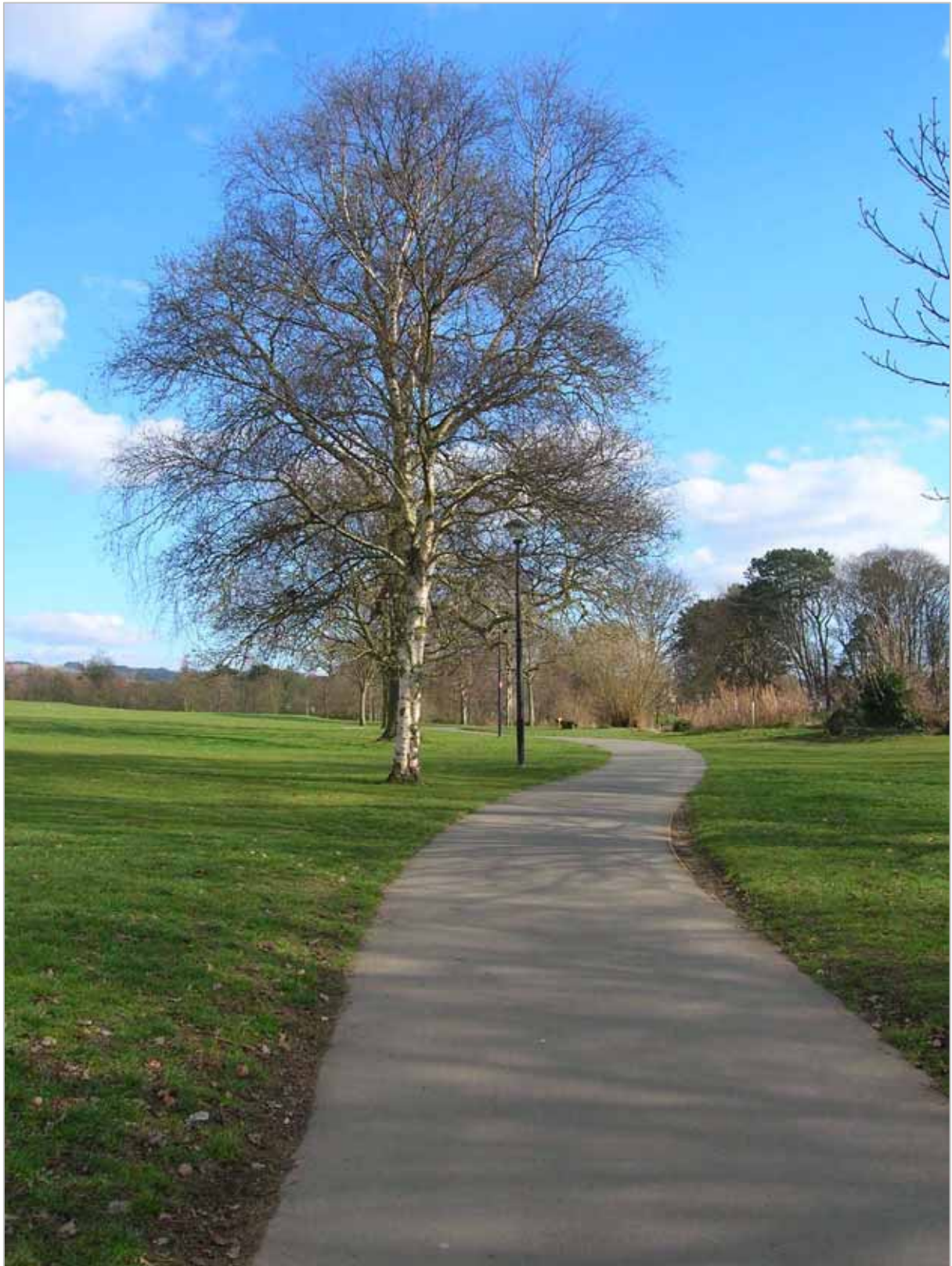
2007 Footpath between Agg Gardner West (right) and Marle Mill West (left)