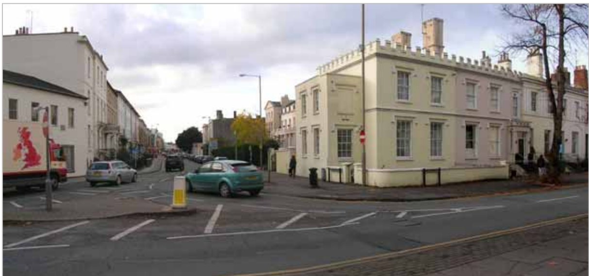
2007 View south along Winchcombe Street from Pittville Gates

Pittville Gates stand to the south of the park and were designed as the grand entrance to the estate. Views from these gates today are limited to views along the surrounding roads.