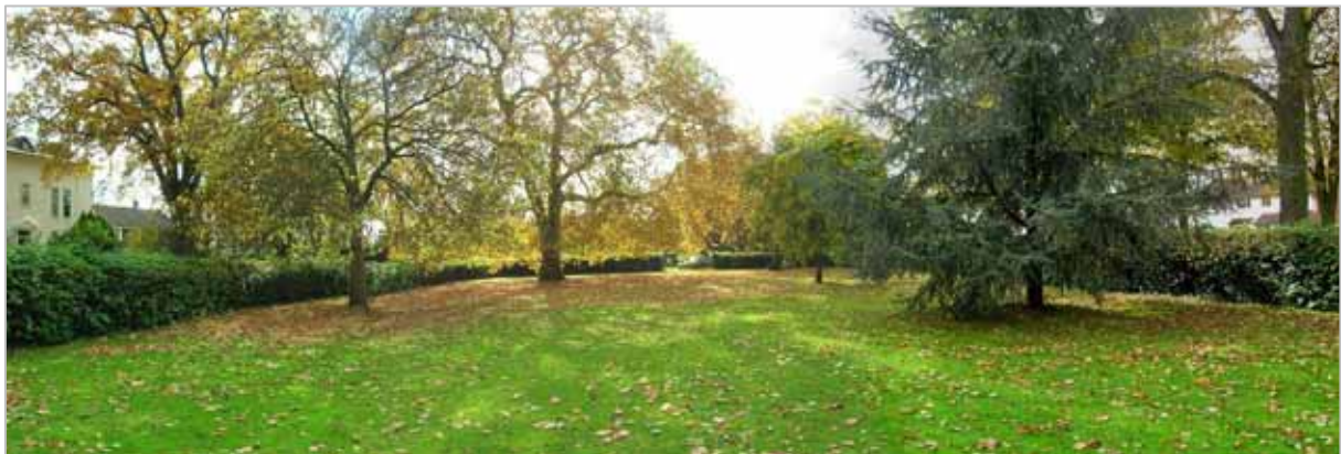
2007 Pittville Crescent north