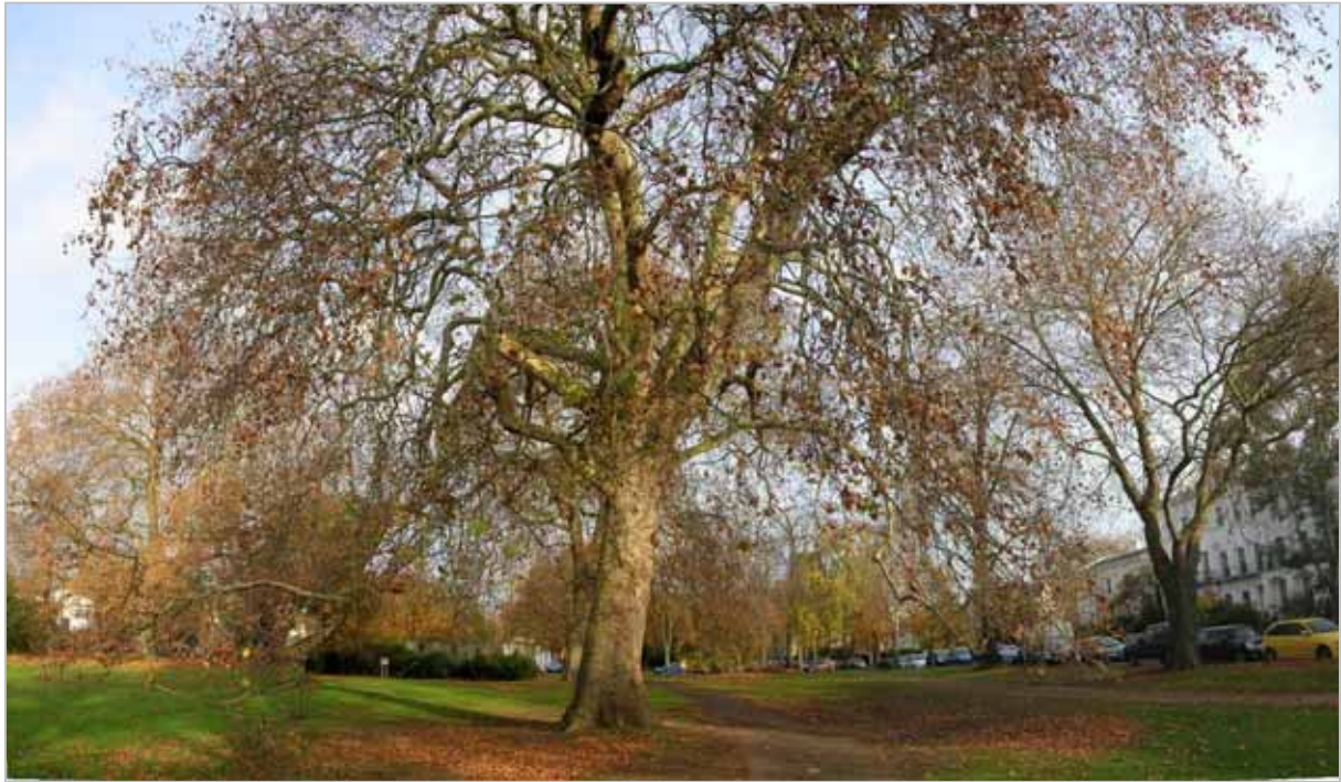
2007 Mature trees, Pittville Lawns South

The overall character of the lawn is enhanced by the mature deciduous and evergreen trees, both on the lawns and along the various surrounding roads. On this southern lawn the pattern of planning appears to be more random and views out towards the surrounding residences are blocked by the mature trees and shrubs. Some of the trees and shrubs are in need of maintenance work to check their growth and restore condition. The overgrown nature of some of the trees and shrubs gives an impression of danger and may lead to users becoming uncomfortable using this space.