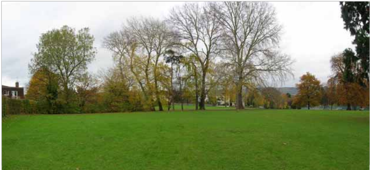
2007 Eastern boundary defined by mature trees