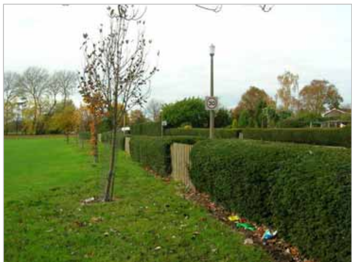
2007 New trees along the northern boundary

A line of new, young trees have been planted along this boundary adjacent to the hedge.