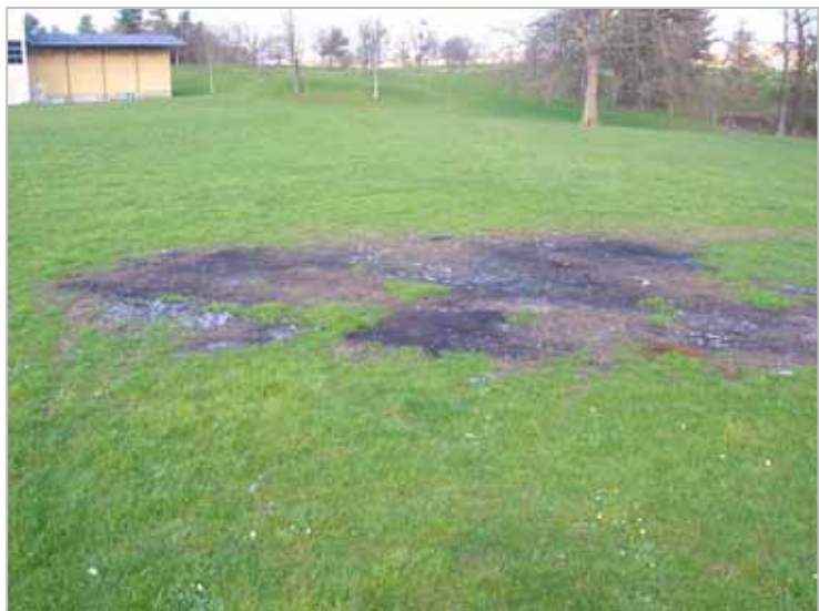
2007 Remains of a burnt out car

The landscape surrounding this play area, within this character area should provide a stimulating, natural environment for play, however consultation with park users and nearby residents has discovered that there is an element of fear and uncertainty in allowing children free access to this play area and surrounding landscape. This is due to the frequent misuse of Pittville Park by unauthorised vehicles, motorcycle riders and joy riders, who enter the park, drive at speed and then burn out stolen vehicles.