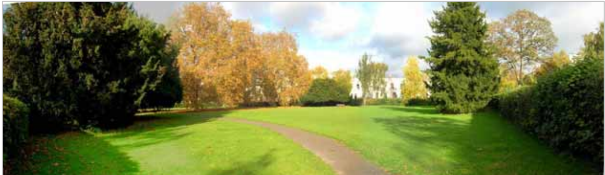
2007 Clarence Square looking north west

Within Clarence Square a collection of mature trees stand within the grassed setting, which give a parkland character to the square. Two magnificent, mature London Plane trees ( Platanus x hispanica ), one towards the centre of the square and one towards the northern boundary provide a sense of history and scale to the square. Their deciduous nature highlights seasonal change within the square.