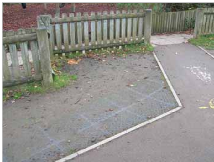
2007 Worn grass surface in play area