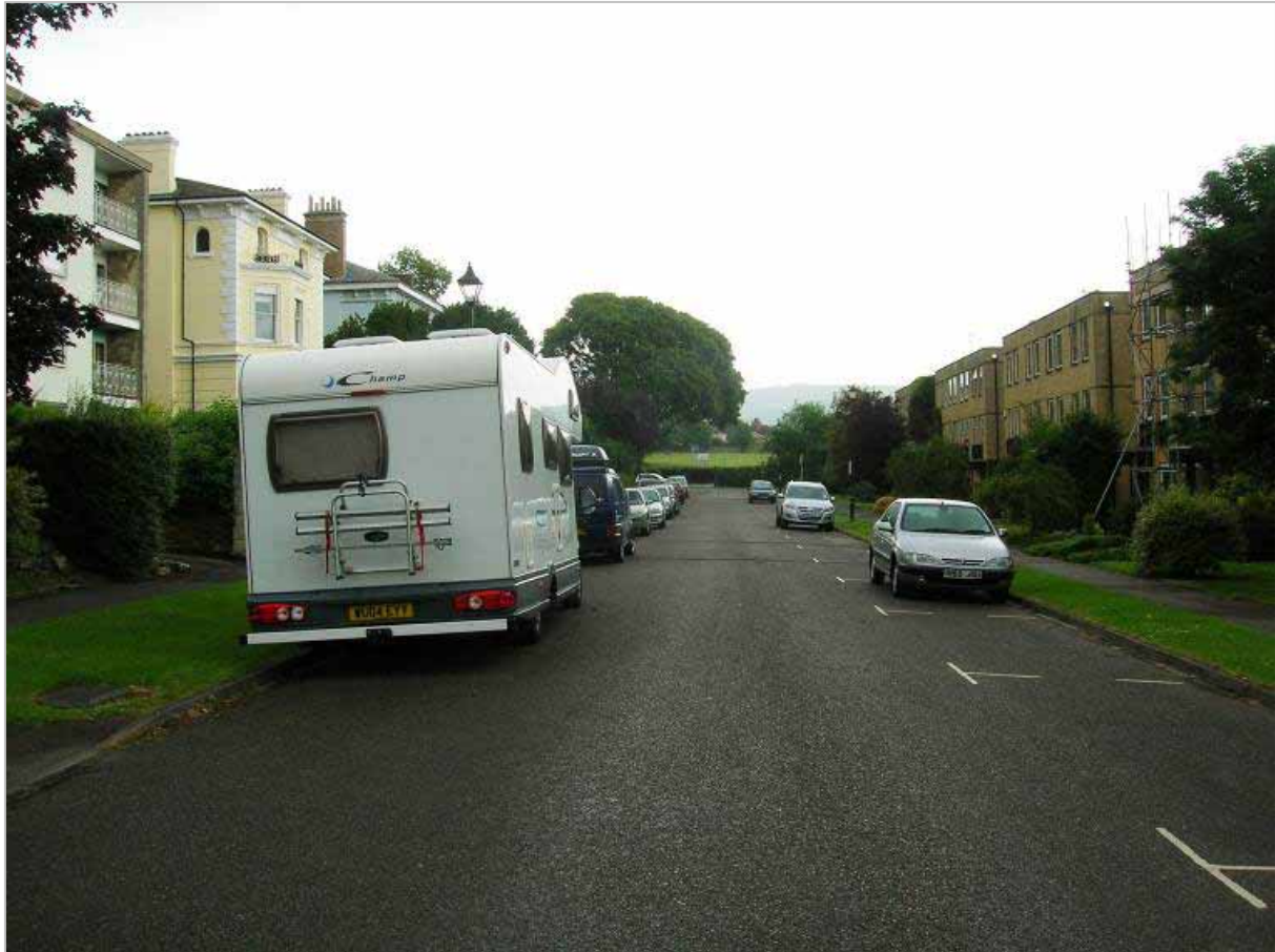
2007 View east along East Approach Drive

The gateway ironwork is showing signs of deterioration and gives a visual appearance of neglect. To the north and south, the bitmac road surface runs under a section of the ironwork. A lack of pedestrian or vehicular traffic here has enabled the colonisation of moss and weeds which continue to grow unchecked, adding to the visual appearance of neglect.