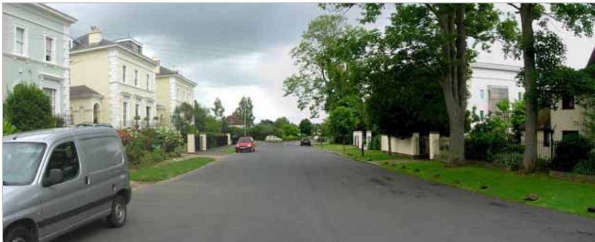
2007 View west along West approach Drive towards Evesham Road