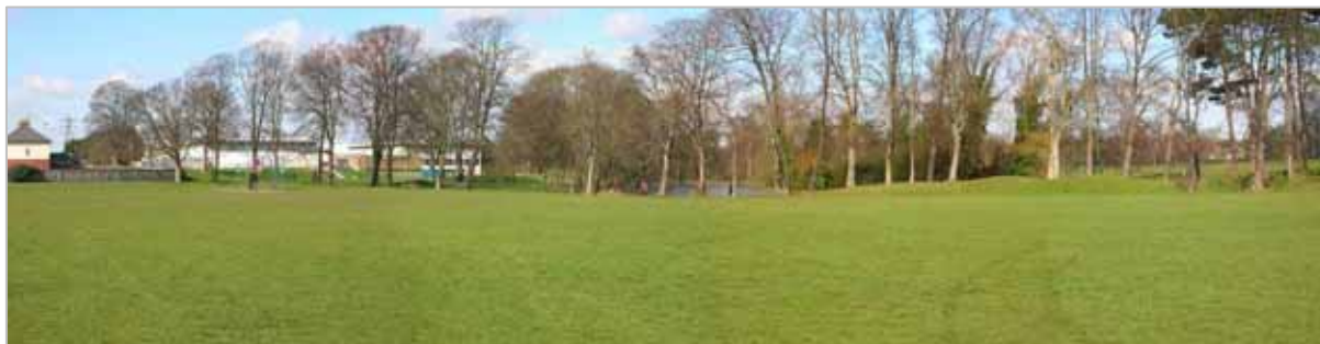
2007 Looking west from Agg Gardner recreation ground towards Leisure@Cheltenham

Glimpsed views of distant buildings and other features aid legibility and enable orientation and way finding within the park.