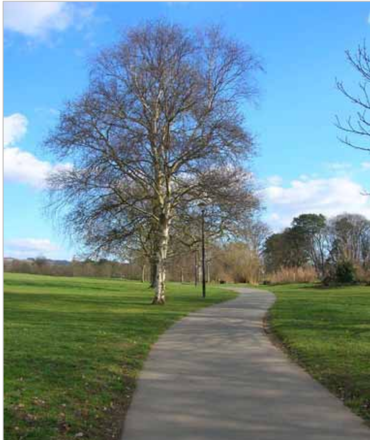
2007 Footpath leading east from Tommy Taylor's Lane

The surface treatment of this footpath is in good condition and the footpath is wide enough to allow pedestrians to pass each other in comfort, however it is not wide enough to allow cyclists to pass each other or for pedestrians to walk comfortably alongside or passing cyclists.