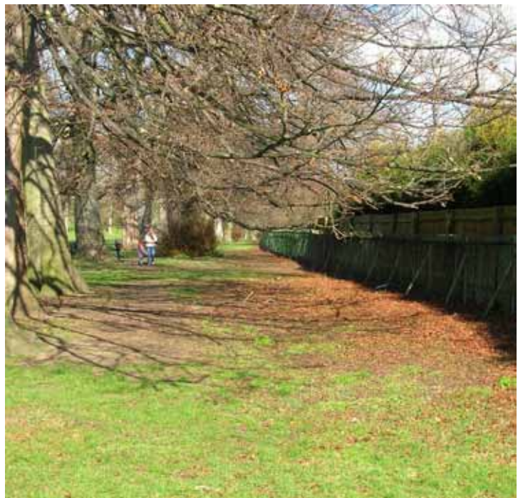
2007 Boundary treatment to the east

To the north the boundary with the Lower Lake is defined by a series of low bunds and mature trees. Mature trees also form a line along the eastern boundary, beyond which an iron fence, with a newer and higher wooden fence immediately behind.