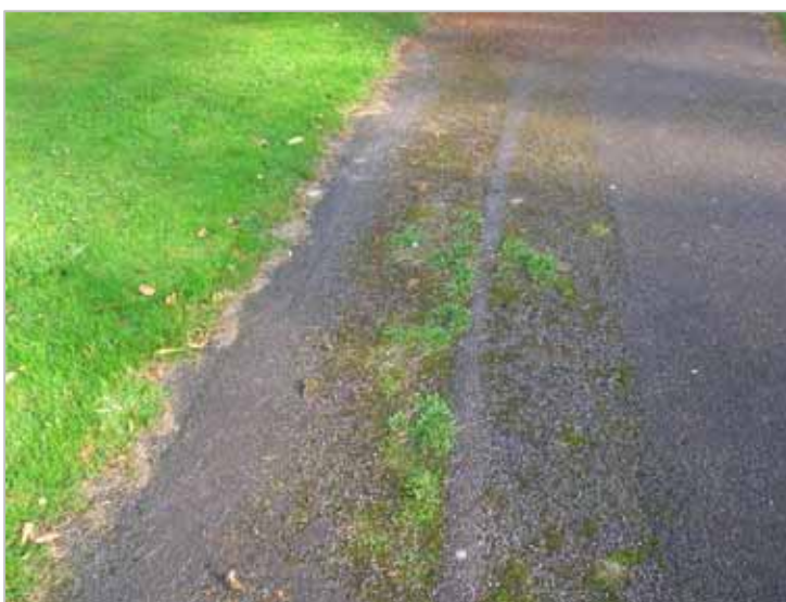
2007 Path surface (above and below)

Within the boundary of the hedge, Wellington Square is a mature green space filled with collection of trees and shrubs. The footpath leads from each gateway towards a path which encircles the square. This hard, bitmac surfaced path is in generally good condition although there are isolated sections which are becoming worn or being colonized by moss.