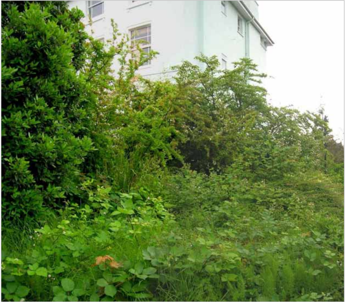
2007 Boundary to the east (above) and north (below)