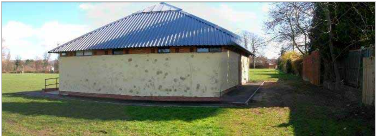
2007 The Agg Gardner Pavilion

In 2007 the Pavilion which stands to the south of the recreation ground was refurbished and now provides changing facilities for users.