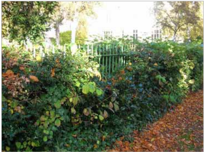
2007 Iron railings visible within the hedge

Views out of the green space are, in places restricted to gateway spaces only due to the height of the boundary hedge.