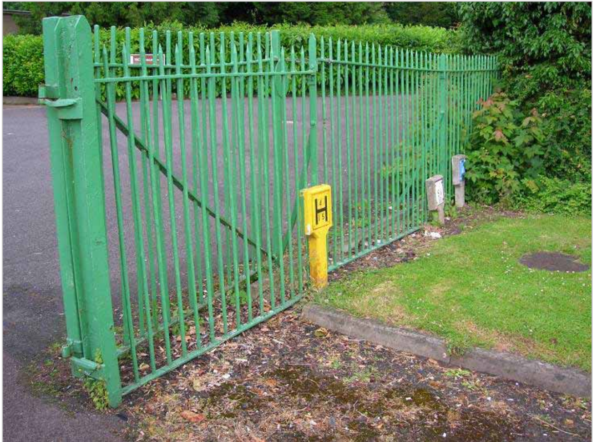
2007 Railings to north (above) and south (below)