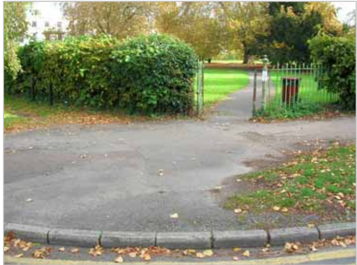
2007 South west gateway

The sense of arrival into the green space varies according to the state of decay and surface treatment at each gateway. To the south west there is a hard surfaced bitmac path which leads into the square and surrounds the gateway to the south west corner, which enhances the sense of arrival and leads the visitor into the square. However, to the right, alongside Clarence Road, this hard surface soon gives way to a compacted gravel and dirt surface. To the left along Clarence Square West the hard surfaced path stops abruptly and the grass verge has no footpath. Clear desire lines within the grass indicate the amount of foot traffic along this verge and the clear need for a footpath.