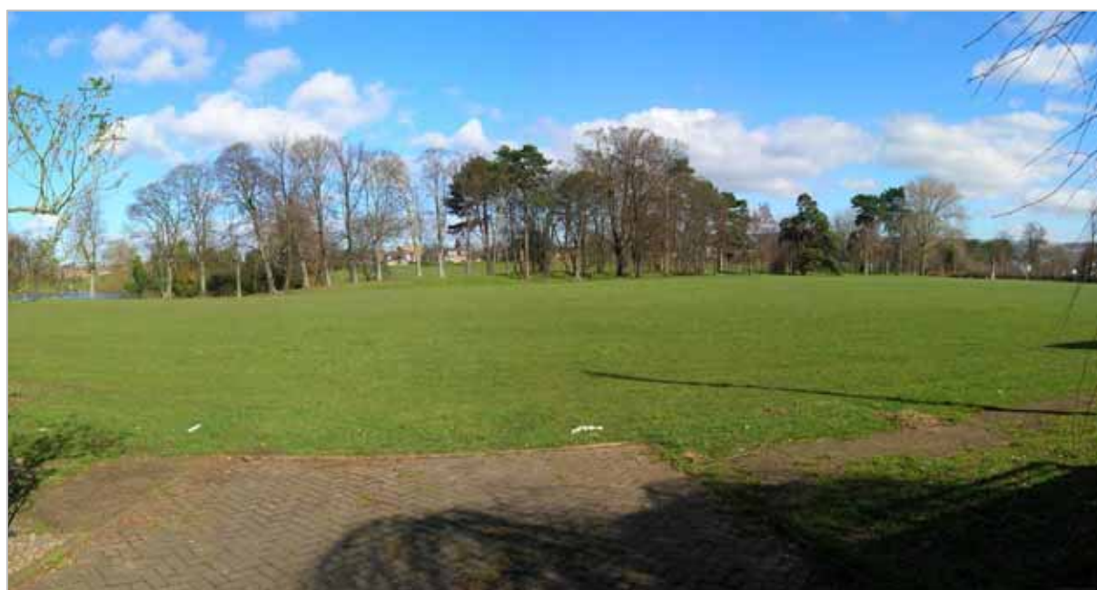
2007 View north from southern park boundary

To the south west of the park is the Agg Gardner recreation ground which is adjacent to the St Paul's residential area. Views into the park are presented at the gateways which adjoin Marle Hill Road. Mature tree planting within the park, surrounding the Lower Lake can be a barrier to views, although seasonal changes do allow glimpses through the canopy, towards Marle Hill to the north.