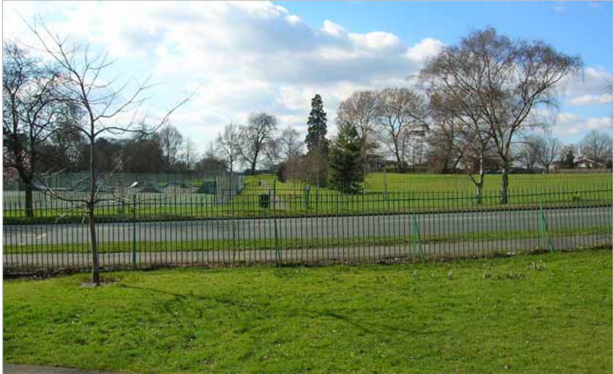
2007 View towards the west park from play area

Excellent views over the west park are afforded from the Pump Room Lawns, especially within the fenced play area. Whilst there is no gateway here, there is good visual access into the west park and a narrow footpath beyond Evesham Road is visible and offers a sight line towards the mature trees which once lined the historic carriage drive between Marle Hill House and Cheltenham town centre.