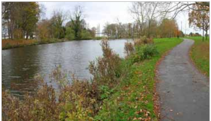
2007 North lakeside native plants (above) site of Rustic Bridge (below)

Along the lakeside the vegetation is predominantly water-loving species such as Iris and Carex species. In places these native perennials are growing unchecked and are becoming overgrown. Views of the lakeside are restricted in places because of this growth however along most of the length of the north lakeside planting is in keeping with the setting and provides a valuable habitat for water-loving wildlife.