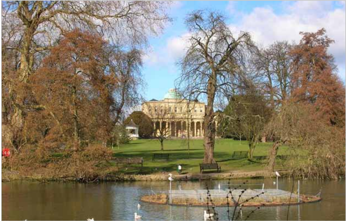
2007 Pittville Pump Room becoming obscured by trees

The path continues to run almost parallel with the lake for around most of the northern edge, occasionally circling around mature trees which have been allowed to grow into the lakeside. From the southern shore, the vista towards the Pump Room has become partially blocked by mature trees.