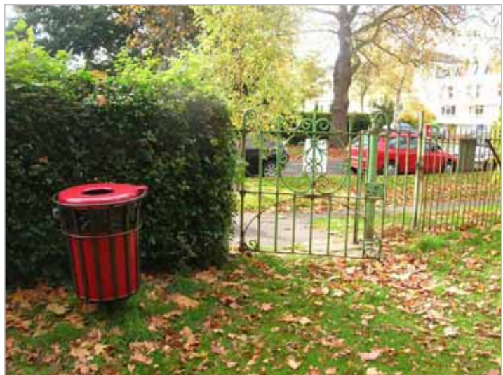
2007 Rubbish Bin

There are no seating opportunities within Pittville Crescent north, although a rubbish bin has been provided adjacent to the gateway.