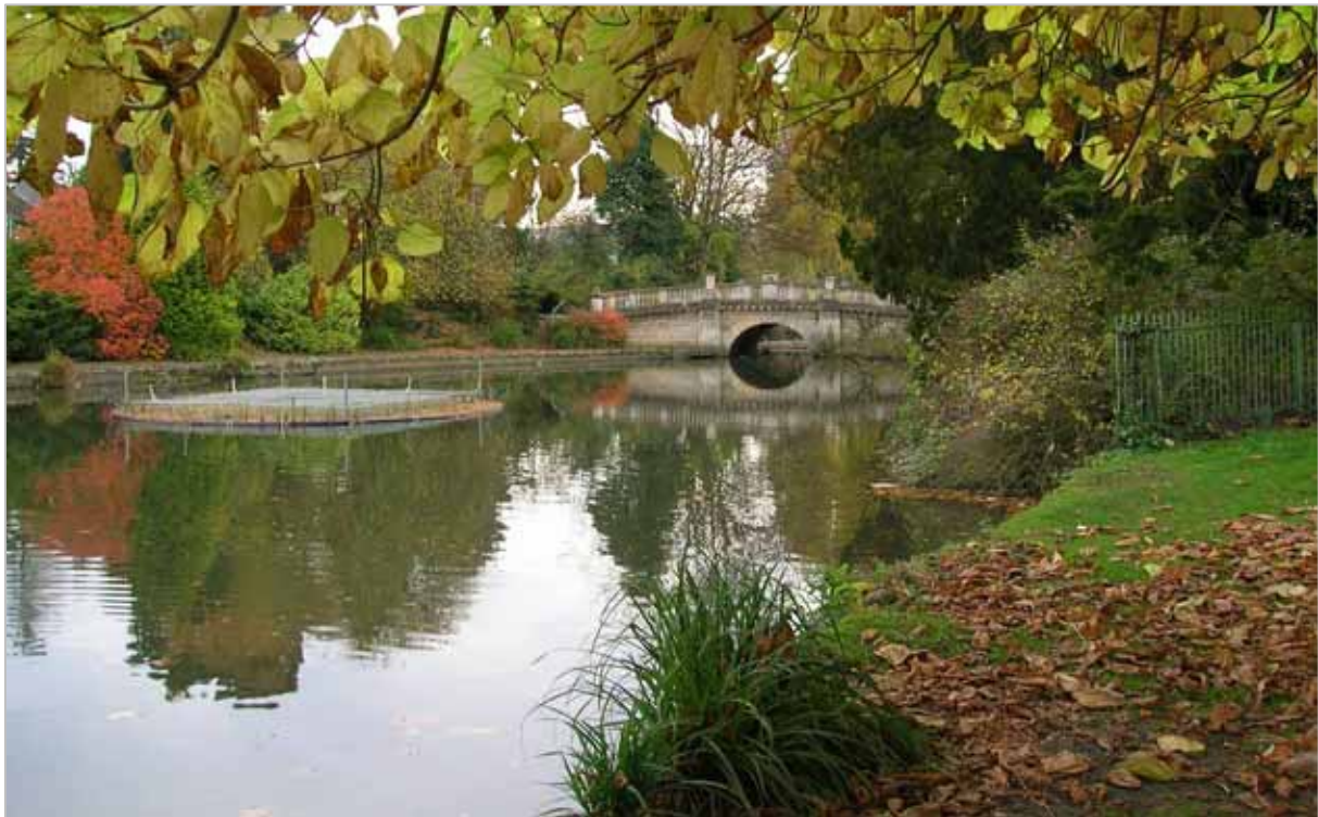
2007 East Bridge, Upper lake