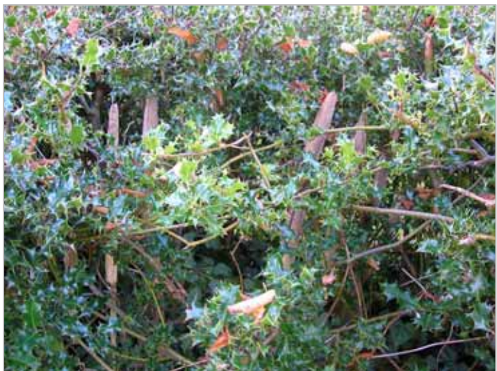
2007 Chestnut pailing within the Holly hedge