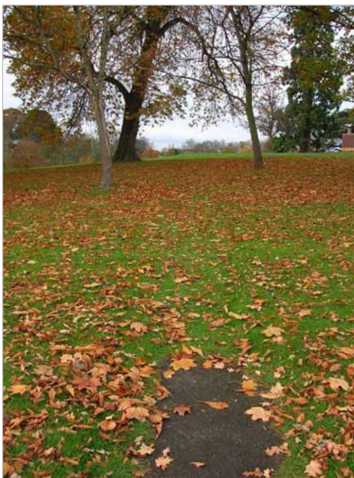
2007 Path ends well short of trees

This narrow, hard, bitmac surfaced footpath rises up a gently slope towards the avenue of trees to the west. However it comes to a dead end well in front of the avenue.