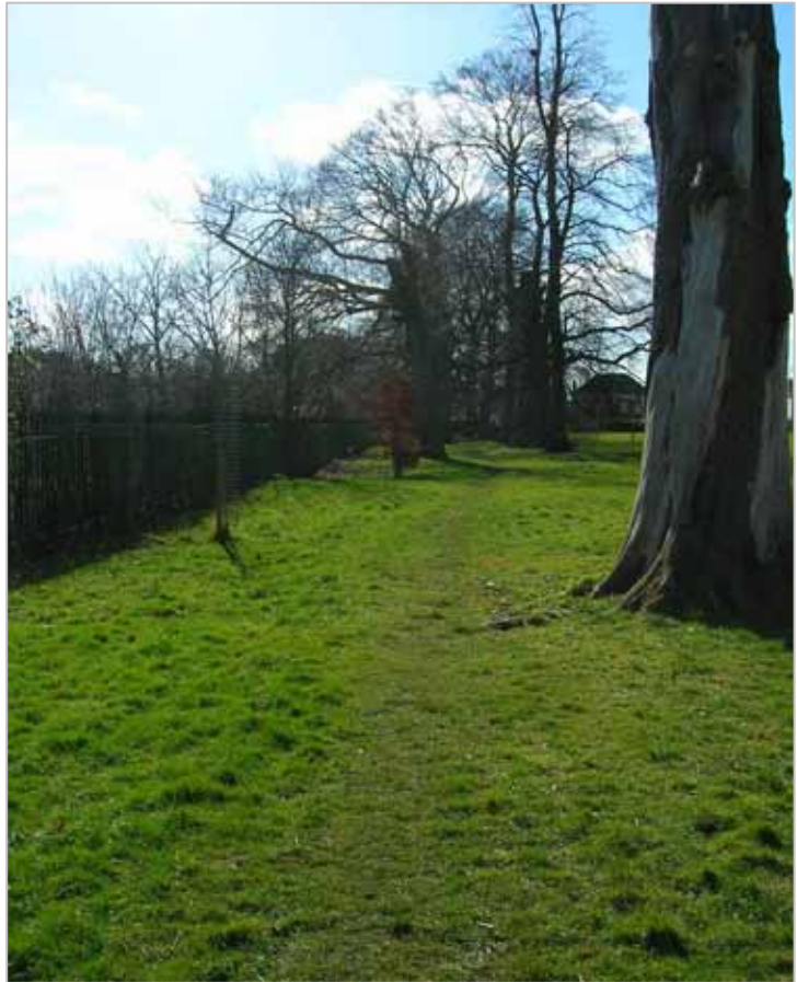
2007 Desire lines along eastern boundary (above and below)

Despite there being only one hard surfaced path in the character area, there are desire lines showing that people do walk through the area, on defined routes on a regular basis. These desire lines are particularly evident towards the eastern boundary of the area, where gateway openings in the boundary allow access through from the residential areas. It is interesting to note that historically there was a carriage drive here which passed over the Lower Lake via the Rustic bridge which was destroyed in 2004.