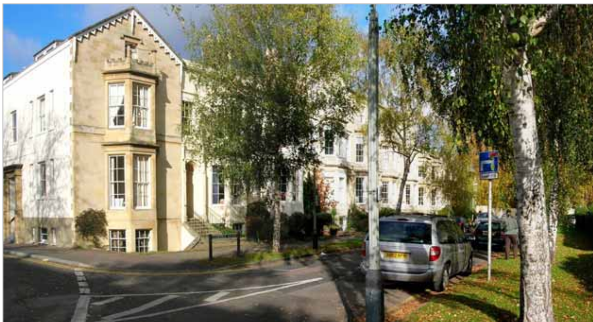
2007 Clarence Square (above and below)

The squares and crescents associated with Pittville Park also give the opportunity for short and medium distance views, predominantly along the roads which define those spaces. Some limited views are available within the squares and crescents and are illustrated below.