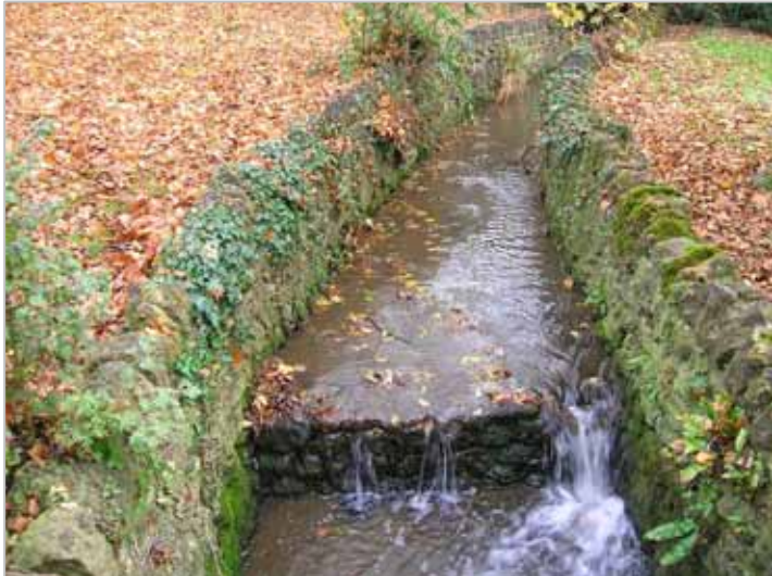
2007 Wyman's Brook

Beneath the bridge, Wyman's Brook has been canalised between two natural stone retaining walls, creating an interesting water feature. This section of the Brook is clean and well maintained.