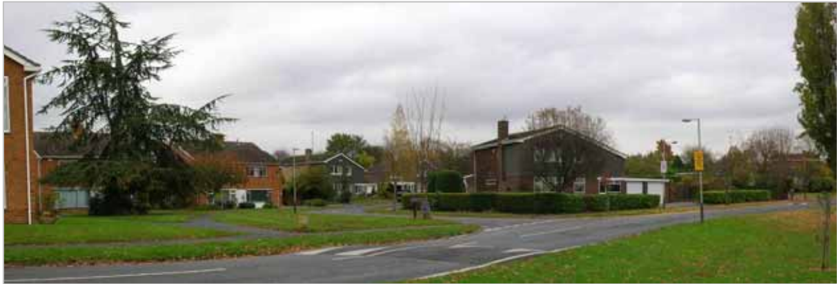
2007 Albermarle Gate and residential houses to the north

There are excellent long distance views from this area across Cheltenham to Leckhampton Hill in the south