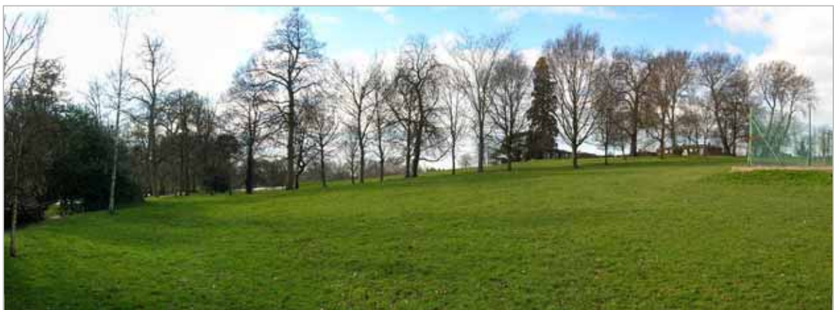
2007 Western boundary

The boundary to the west of this sub area is defined by the mature trees which were originally planted as an avenue along the carriage drive to Marle Hill House. These trees are an important landmark within the park and contribute to the character and setting of the area.