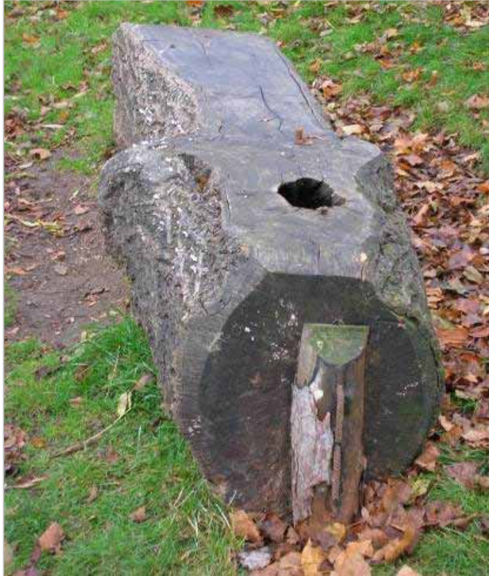
2007 Sustainable seating (above) and rubbish bins (below)

Seating opportunities are however limited and benches and fallen trees tend to be a considerable distance apart and there is a lack of cohesion to style of seating provided on this western side of the Pittville Park.