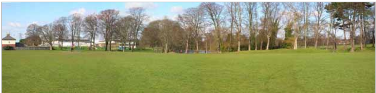
2007 Western boundary with Leisure @ Cheltenham visible through the trees

To the west stands the Leisure @ Cheltenham sports centre whilst adjacent to the eastern boundary is Dunalley County Primary School.