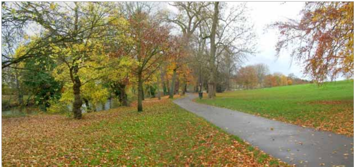
2007 North Lakeside

The north lakeside area runs from the Boathouse in the east to the western extent of the lake, where the footpath branches off to the south. To the north is Marle Hill, which slopes steeply upwards towards the Albermarle residential area to the north of Cheltenham. To the south is the Lower Lake.