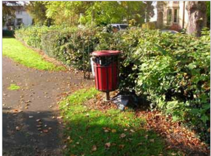
2007 Wellington Square rubbish bin

There is also equally poor provision of rubbish bins, the only bins within the square located adjacent to two gateways and on the occasion of site visits, appeared to be full with rubbish accumulating around the base of the bins.