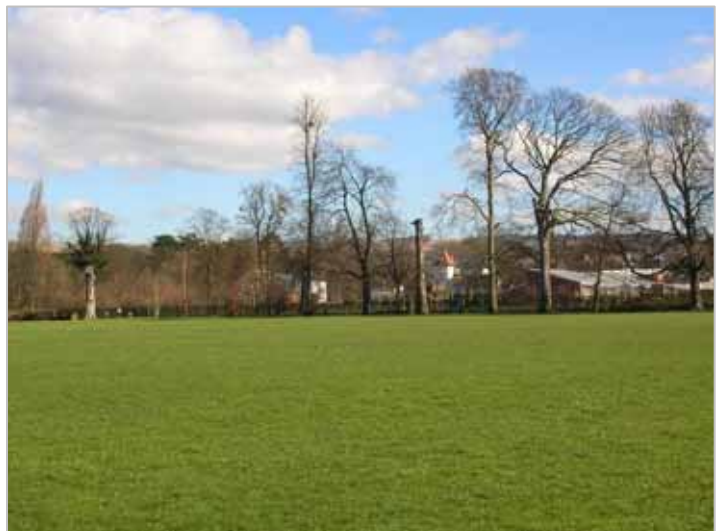
2007 Eastern boundary with Dunalley County Primary School visible behind the trees

This grassed character area slopes very gently north towards the Lower Lake. Popular as a recreation ground, it has a significant amount of open green space which is used for sporting