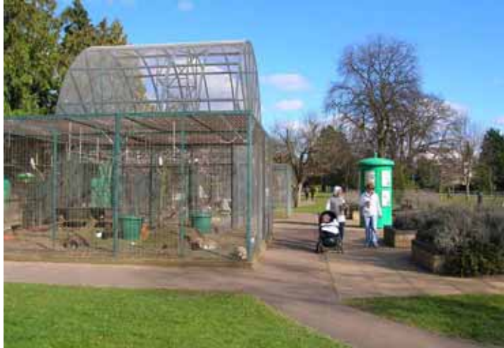
2007 Aviaries and chipmunk

The aviaries were established in their current position in 1936 although the present buildings are a more recent addition. The collection of animals include rabbits, cockatiels, peacocks and chipmunks and have become a very popular attraction in the park. The upkeep and maintenance on the aviaries is the responsibility of the Parks team.