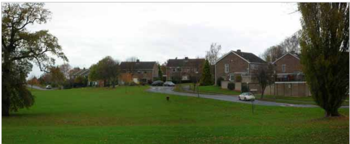
2007 Looking north-west towards Albermarle Gate and Residential houses