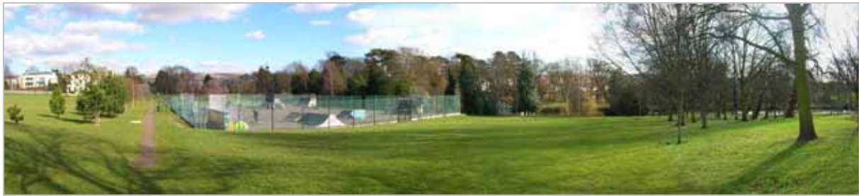
2007 Footpath looking east towards A435 Evesham Road

This sub area is popular with park users and desire lines in the grass reveal the extent of use.