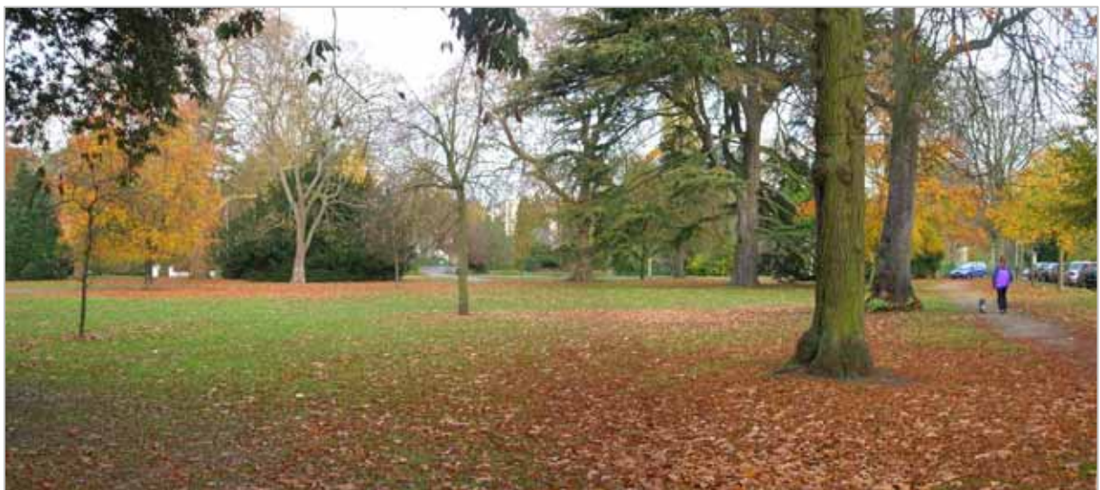
2007 Pittville Lawns

Pittville Lawns north runs from the Upper Lake south towards Cheltenham and is divided from Pittville Lawns south by Central Cross Drive. To the west is the busy A435 Evesham