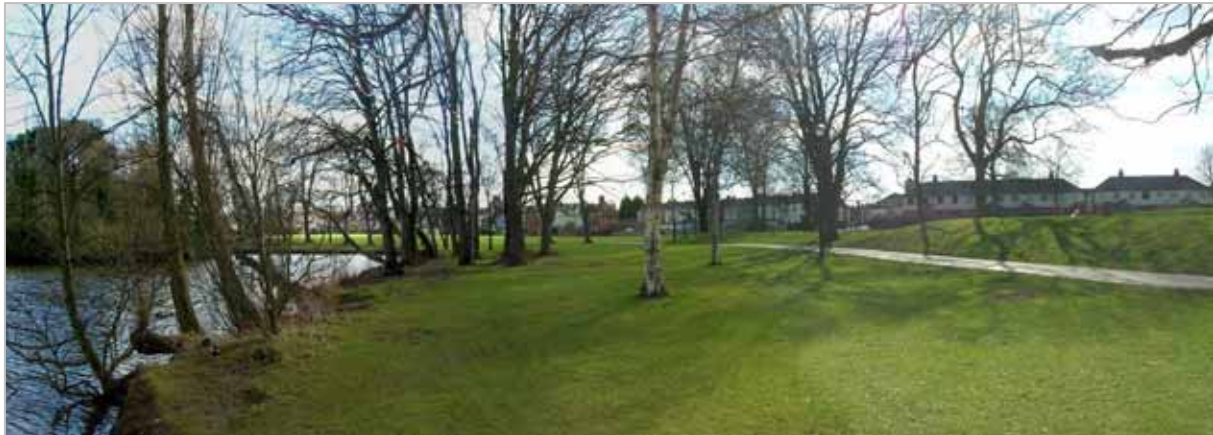
2007 South lakeshore looking east

Across the bridge towards the Agg Gardner recreation ground, the tree canopy is less dense and an open grassed area lies between the lakeside and the footpath. Tree saplings have begun to colonise the lakeside and some hang well over into the water.