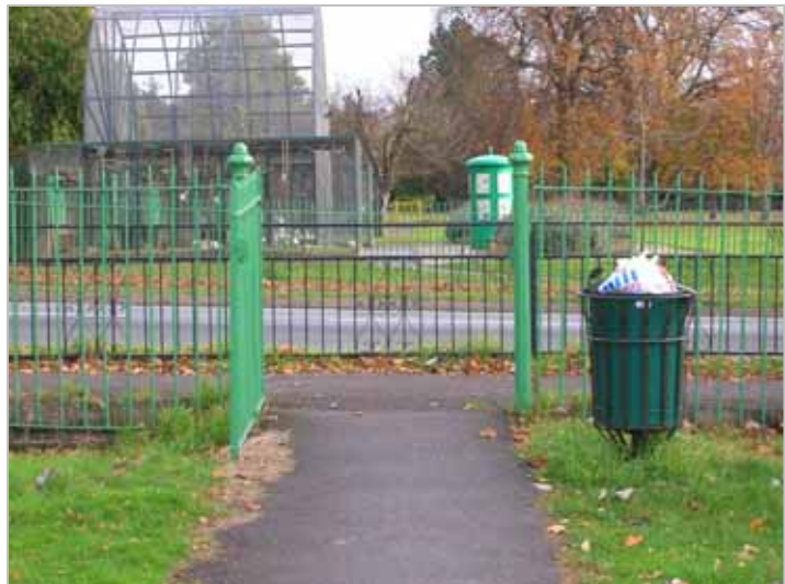
2007 Gateway off A435 Evesham Road

The boundary to the east is defined by a high green mesh fence which has been attached over the original park fencing which adjoins the A435 Evesham Road. This high fencing continues along the northern section of this boundary as is associated with the Approach Golf Course. A small, narrow gate provides access into the area off the road.