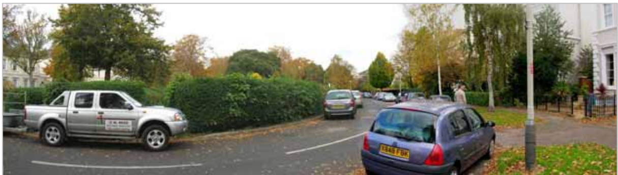
2007 Looking north along Pittville Crescent

This wide grassed verge to the west of the crescent adjoins Albert Road and contains mature street trees which contribute to the overall character of the setting. To the east, the grassed verge runs adjacent to Pittville Crescent.