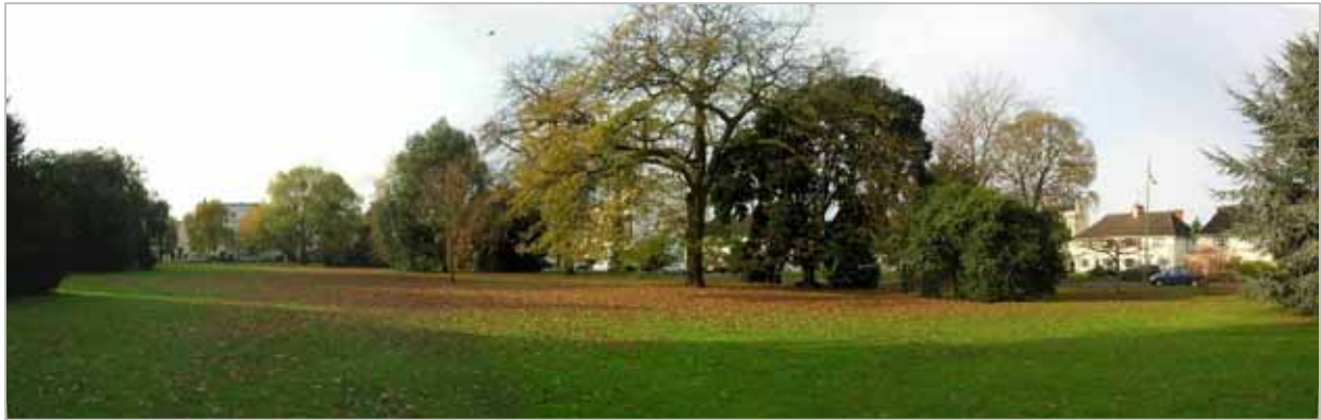
2007 Pittville Lawns south looking towards Cheltenham

Pittville Lawns South run south towards Cheltenham and the southern boundary is marked by Wellington Road. To the west runs the busy A435 Evesham Road and to the east the lawn is defined by Pittville Lawn. The northern boundary is defined by Central Cross Drive. This area was often known as the Long Garden Two.