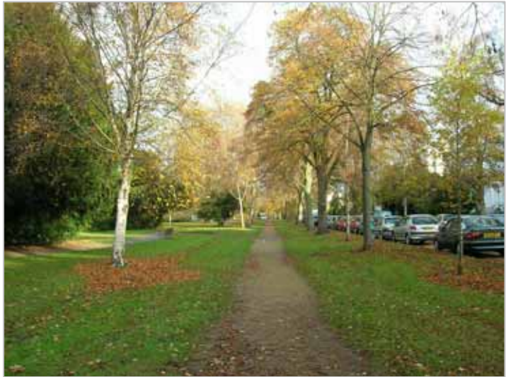
2007 Informal path adjacent to Pittville Lawn

To the west there is also a hard surfaced bitmac footpath which runs parallel to the A435 Evesham Road. This hard surfaced path is repeated to the north, running parallel with Central cross Drive and in the south, running parallel with Wellington Road. In places tree roots are distorting the bitmac surface, which may prove to become a tripping hazard in the future and contributes to an untidy and neglected atmosphere.