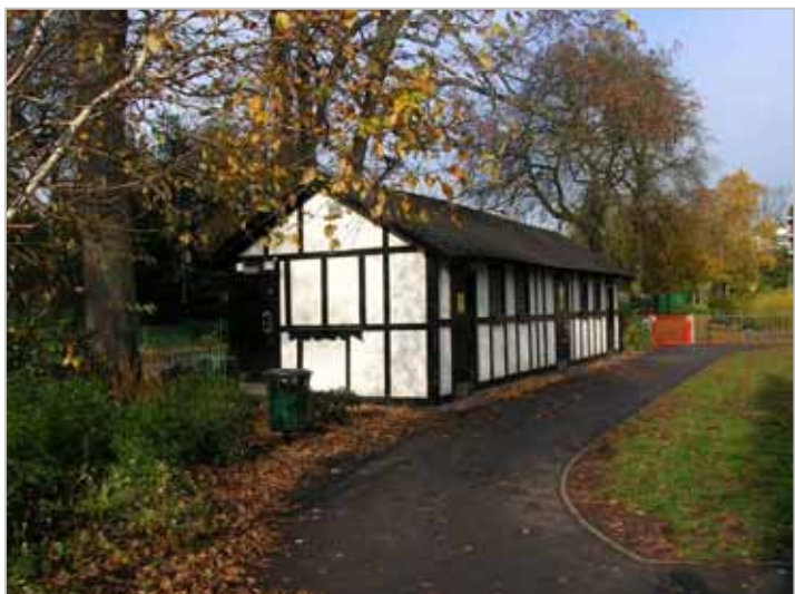
2007 Toilet Block

This building, of painted timber and cladding, was built to replace former building which dated from 1960. The original separate blocks were located within the shrubberies to the north of the Pump Rooms. These toilets are conveniently located close to the children's play area