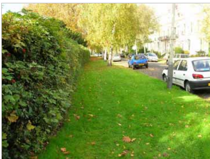
2007 Clarence Square North

There is no footpath beyond the northern boundary however, well worn desire lines in the grass are an indication of the amount of foot traffic this strip of grass receives.