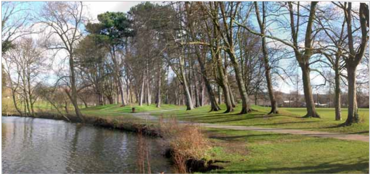
2007 South Lakeside looking east

There is a small island towards the south western lakeside which is covered almost entirely with mature trees, shrubs and perennial plants. The island is the home to waterfowl and Swans and is not accessible from the shore.