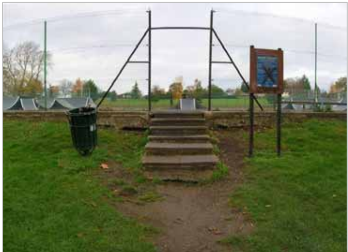
2007 South entrance to skateboard park (above and below)

There are two entrances to the skateboard park, one to the north and one to the south. As the terrain slopes gently to the south, there are steps leading down from the southern entrance directly onto the grass below. No footpath has been provided to lead to and from the skateboard area and as a consequence of popular use, the grass is now worn away. This wear is visually intrusive and combined with the poor condition of the steps and concrete footings to the skateboard area gives the appearance of neglect and decay.