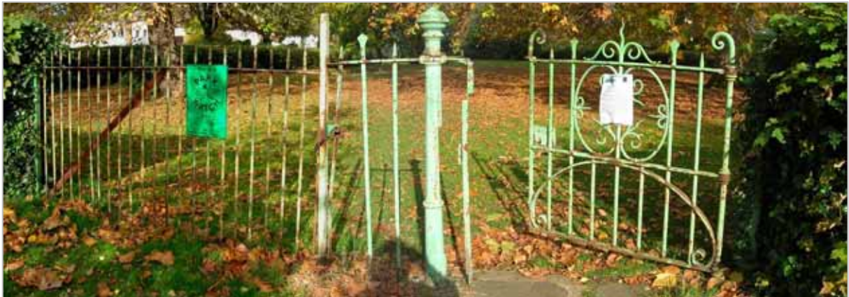
2007 Pittville Crescent north ironwork

There are no seating opportunities within Pittville Crescent north, although a rubbish bin has been provided adjacent to the gateway.