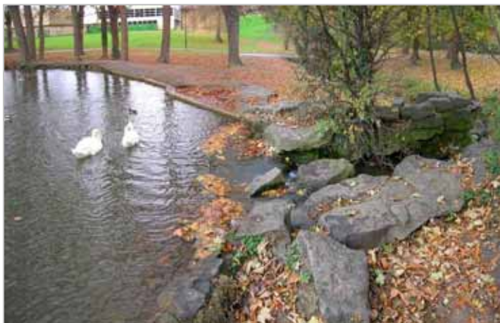
2007 To the west the Lower Lake runs into Wyman's Brook

The Weir, at the time of survey, was considered to be in structurally poor condition. Repair work has recently been completed, including the addition of pH neutral boulders.