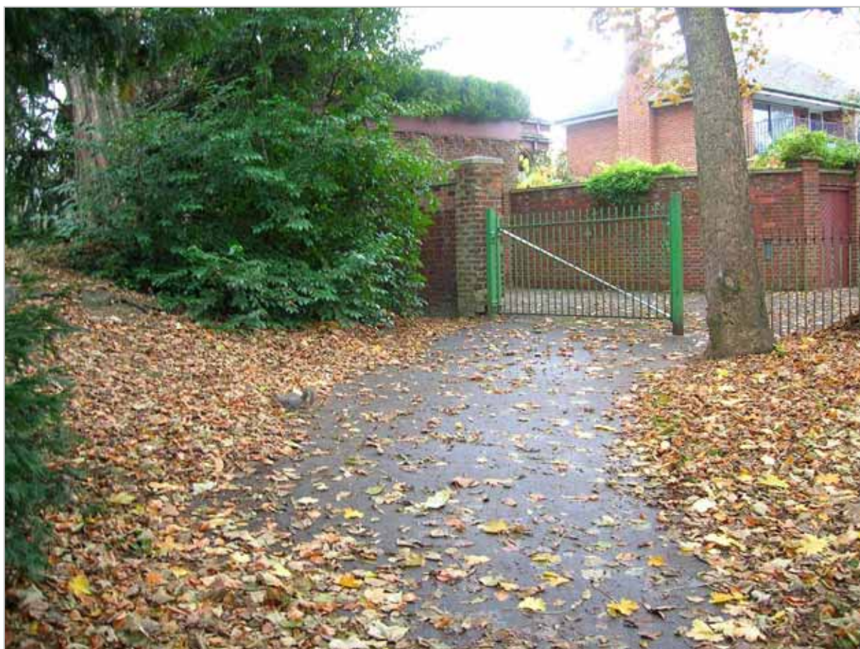
2007 Gateway form West Drive

The ground rises significantly towards the eastern extent of this area, the footpath continues along on the lower ground around the edge of the lakeside. The higher ground is heavily planted and the boundary to the south is defined by the walls of neighbouring residential houses and rendered concrete walls.