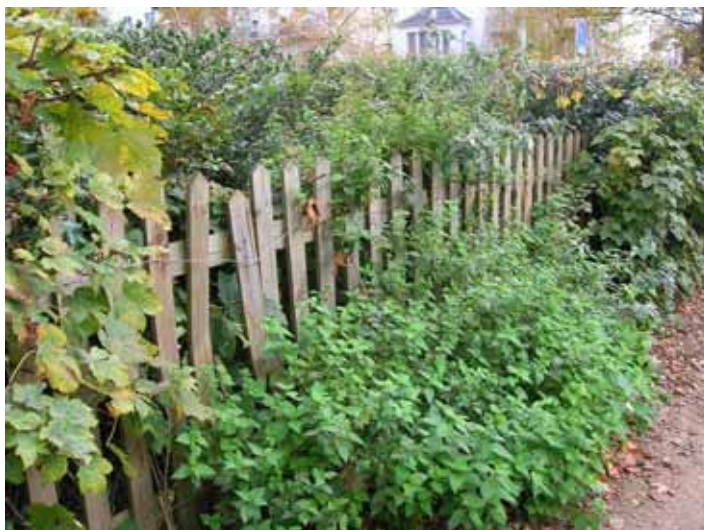
2007 Wooden railings along Clarence Road