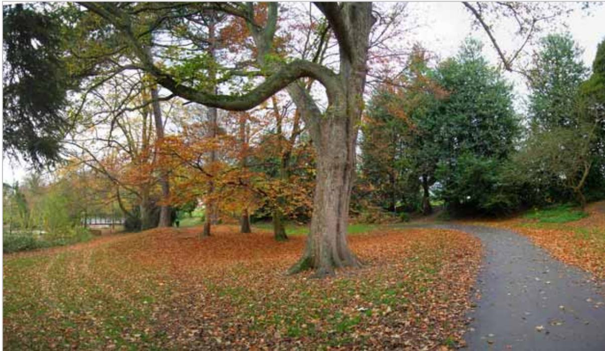
2007 Footpath towards the north lakeside

The east lakeside area is predominantly planted with mature native trees which provide the area with a dense canopy throughout the summer months and give seasonal interest throughout the year.