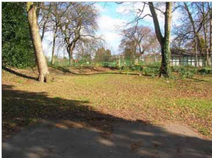
2007 Bitmac surface ends short of a possible entry point into the western park

The bitmac surface towards the north has an unusual u shaped addition close to the A435 Evesham Road at the point where the gates into the eastern park stand. This is a very logical point to have the entry gate into the western park but at present this is not in existence.