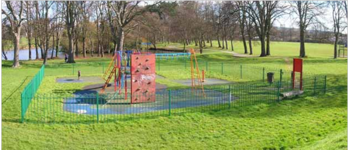
2007 Children's Play area

Immediately to the west of the Sycamore avenue is a very small children's play area. This fenced area contains a limited amount of equipment which has a very low play value, only offering opportunities for physical play. The current equipment is beginning to look tired and neglected.