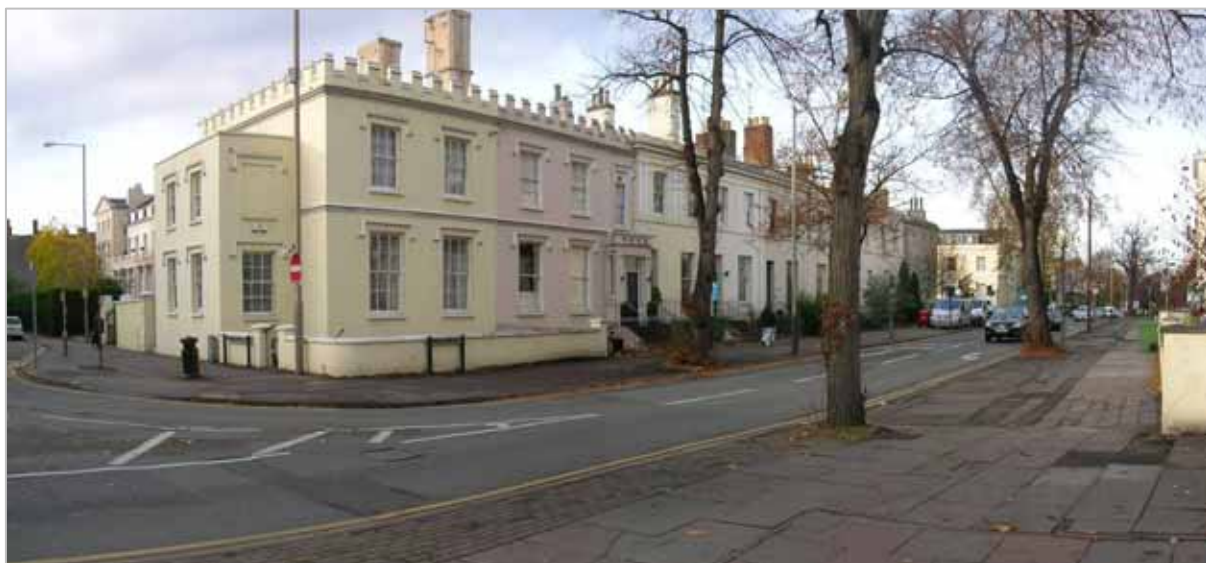
2007 View south to Winchcombe Street and Cheltenham town centre