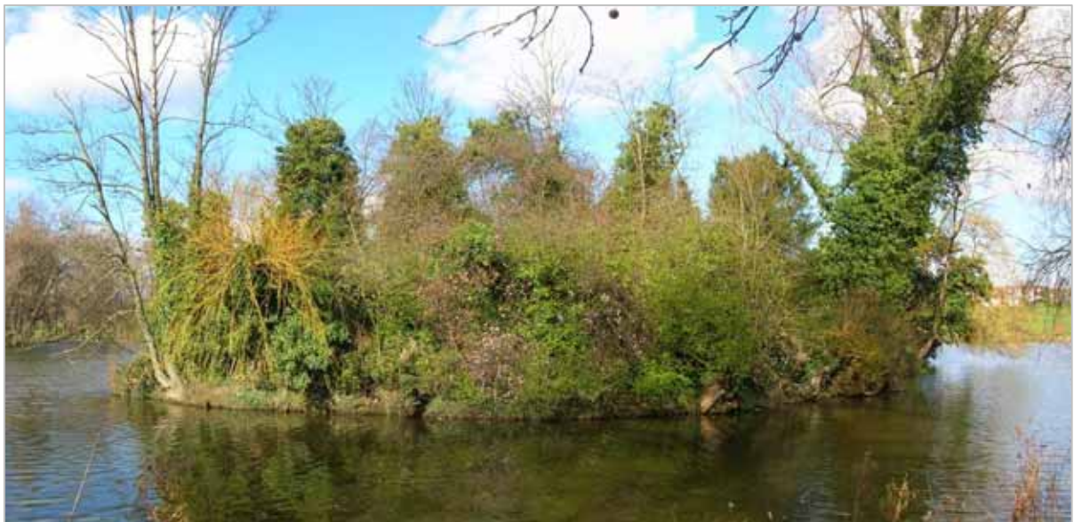
2007 Lower Lake Island

There is a small island towards the south western lakeside which is covered almost entirely with mature trees, shrubs and perennial plants. The island is the home to waterfowl and Swans and is not accessible from the shore.