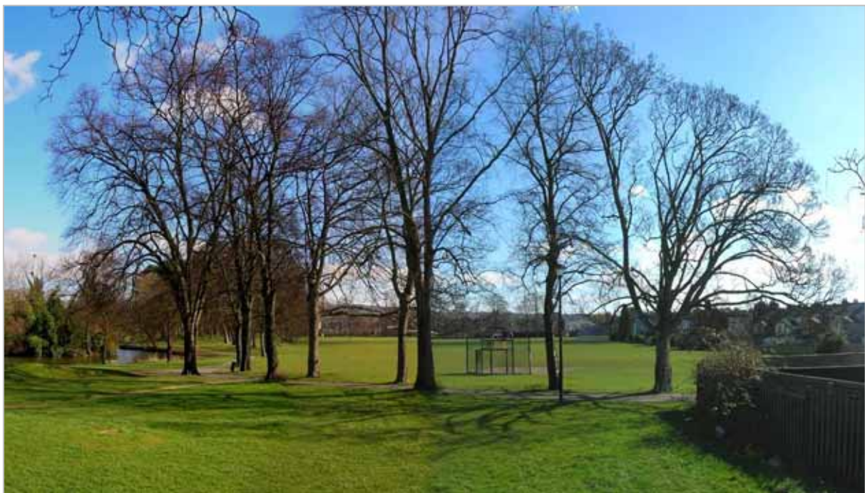
2007 Sycamore avenue defines this character area to the east

This character area is predominantly grassed parkland with scattered medium to mature trees. To the east the ground is flat, with man made bunds rising steeply to the south-west. The mature Sycamores ( Acer pseudoplatanus ) form a north-south avenue and continue to follow the hard, bitmac surfaced footpath when it splits to follow the southern Lakeside to the east and west.