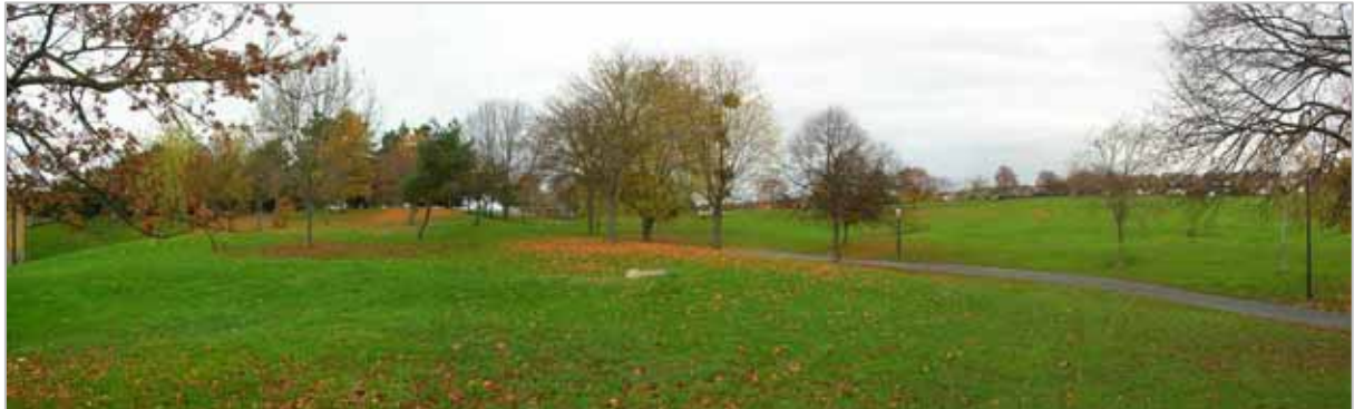
2007 Western hilltop

To the west of the character area the ground rises significantly to the north. Here young to semi-mature trees have been planted within the grass covered hilltop. The ground then slopes down towards the north until it reaches the footpath which connects to Tommy Taylor's lane. This raised ground within the character area is possibly a man made feature created with spoil from the construction of the Leisure @ Cheltenham sports centre.