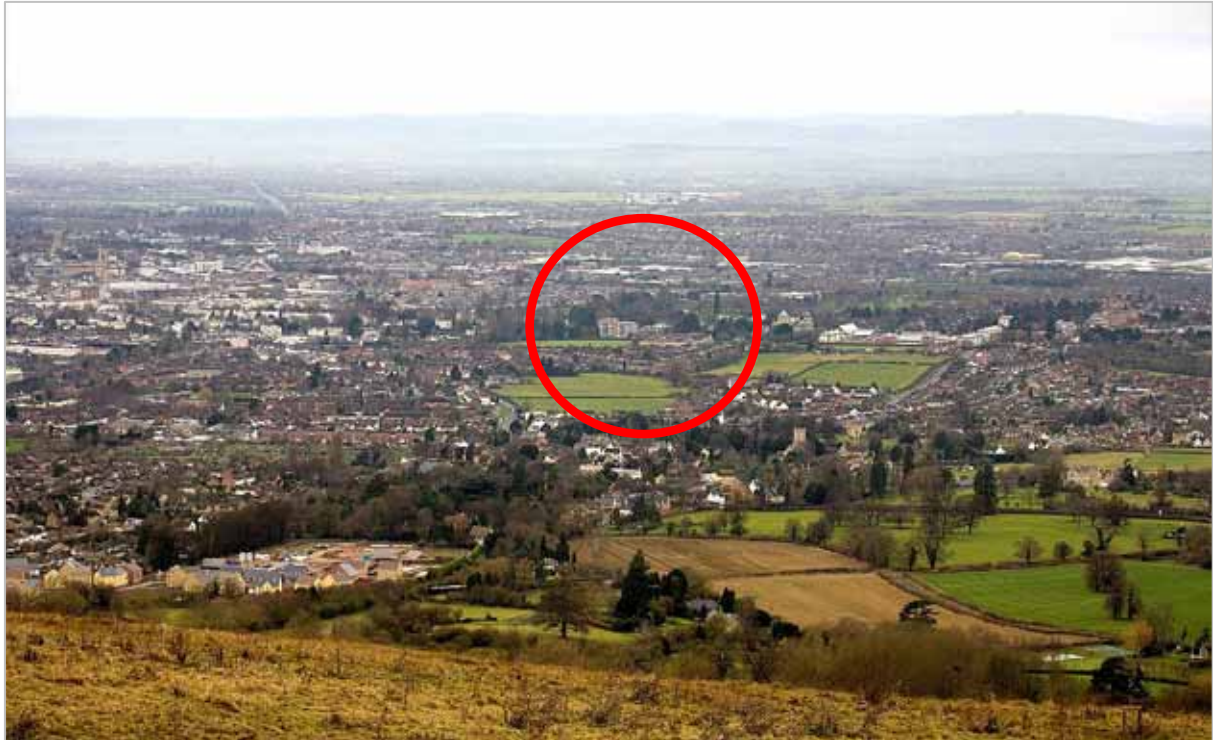
2007 View from Cotswold escarpment towards Pittville Park (above and below)

The location of Pittville Park on the undulating flood plain of the River Sever restricts views into the park, apart from those afforded on higher ground. To the east of the park, on the Cotswold escarpment, a suitable vantage point offers long distance views over Cheltenham and features of Pittville Park can be distinguished and are highlighted below. See Fig 3.4