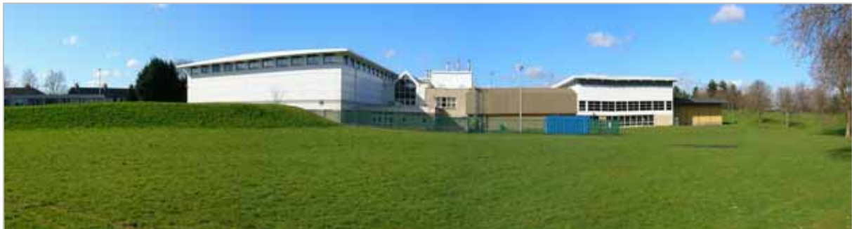
2007 Leisure @ Cheltenham forms part of the western boundary

The Agg Gardner West character area runs from the Leisure @ Cheltenham sports centre and Tommy Taylor's Lane, east to the line of mature Sycamores ( Acer pseudoplatanus ) which form an avenue over the entrance path from the St Paul's residential area. The area extends north to the footpath which links the Lower Lake to Tommy Taylor's Lane and its southern boundary is defined by the high boundary fence which borders the St Paul's residential area. This character area forms the south western corner of Pittville Park.