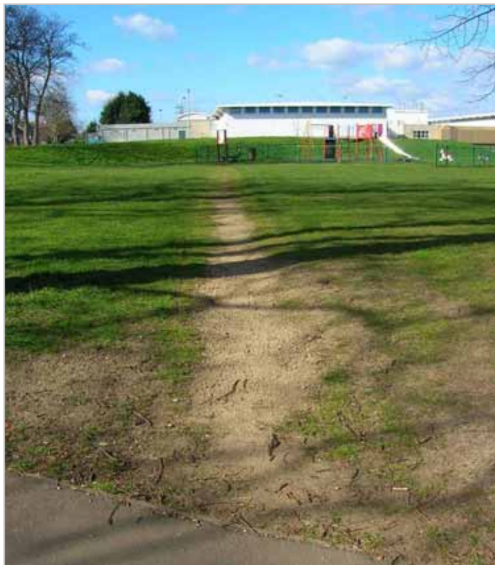
2007 Desire line to Children's Play area

The footpath leading to the Children's Play area is well worn, with the gravel surface long disappeared and now appears as a desire line which leads from the main footpath is an indication that this is a well used route.