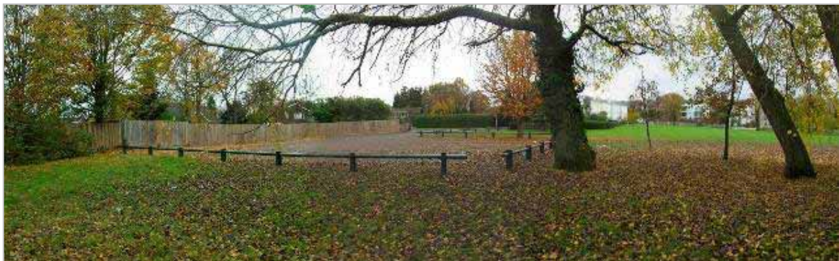
2007 Albermarle Road car park

There is a small car park with space for approximately thirty cars, to the north of this sub area, off Albermarle Road. The car park has an informal loose gravel surface and has a low metal fence to demark the parking limit. There are two gaps within this low fencing which allow park users to pass through, but no footpaths have been provided in this area.