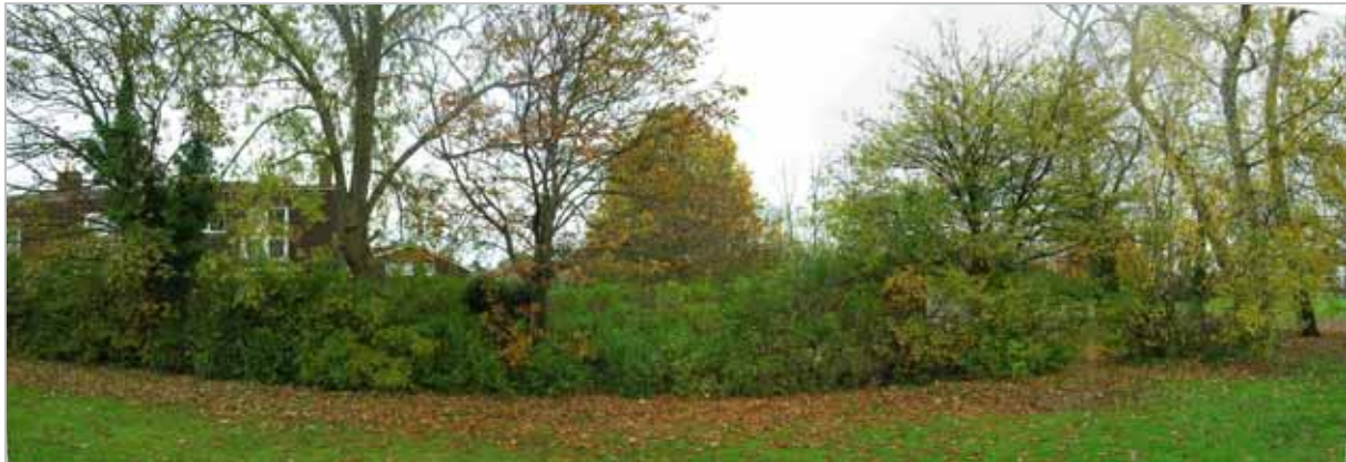
2007 Boundary to the north east of the sub area

To the north east of this sub area the boundary becomes delineated from the residential houses by mature shrubs and trees. This planting provides visual and seasonal interest along with a valuable habitat for wildlife.