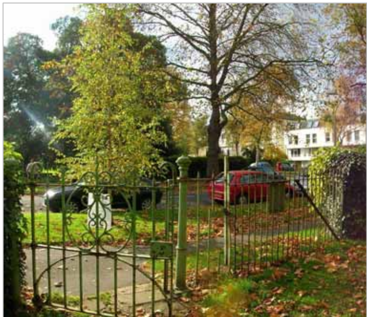
2007 Gateway into Pittville Crescent north

The gateway opens into the grassed crescent without a hard surfaced path. The result is a dirt covered entrance which detracts from the historic importance, character and setting of this space.