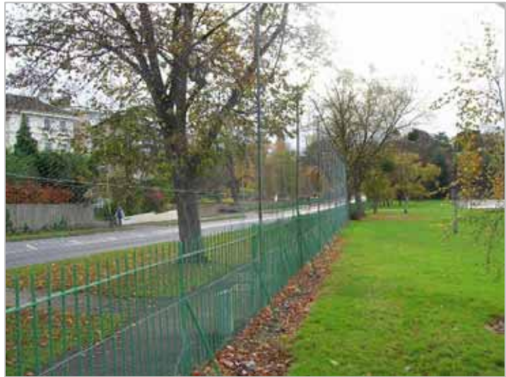
2007 Eastern boundary, A435 Evesham Road

The Marle Hill East sub area is defined by the A435, Evesham Road to the east, Albermarle Gate to the north, the Lower Lake character area to the south and the western edge of the mature tree avenue which located the historic carriage drive from Marle Hill House.