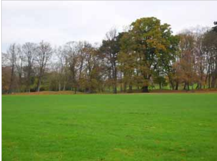
2007 Veteran Oak can be seen centre right, standing out amongst younger trees

This parcel of land is bounded to the north by the lake footpath, to the east by the school playing field, and to the south by the St Paul's housing development. Most of this area is devoid of trees, being used as an open recreational area, although there are close planted mature groups of mixed broadleaf and coniferous trees to the north, and a now much depleted row of over-mature Beech along the eastern edge. The latter are of some concern from a health and safety viewpoint, and steps are currently being taken to address these issues. The general condition of the mixed species planting in the north is fair, although within the groups there are a significant number of Sycamore and Norway Maple which are in a poor condition, we think largely as a result of squirrel damage. There is one noteworthy tree amongst these, however, and that is a very large veteran Oak (189cm stem diameter) which could be over 200 years old