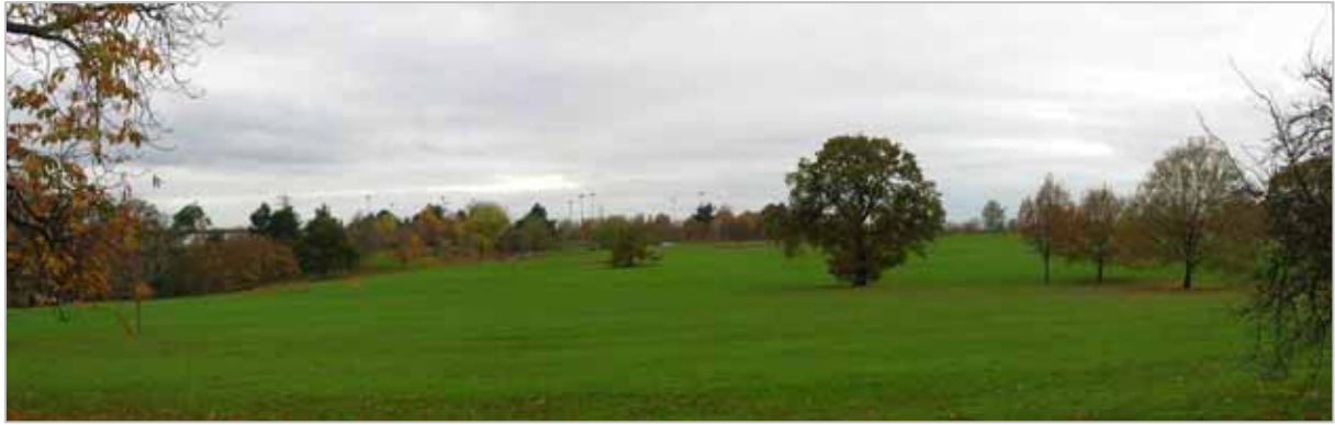
2007 Looking west from Marle Hill Centre, towards Tommy Taylor's Lane