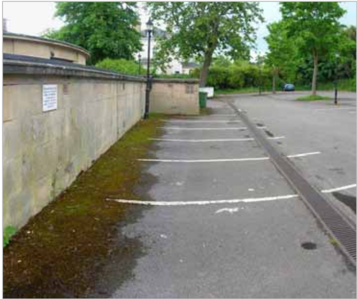
2007 Southern extent of car park

The hard bitmac surface extends to the building wall, with a series of slot drains to intercept surface water which is flowing towards the Pump Rooms. There is a build up of moss along the surface immediately adjacent to the building, which appears to be well established and adds to the general visual appearance of neglect.