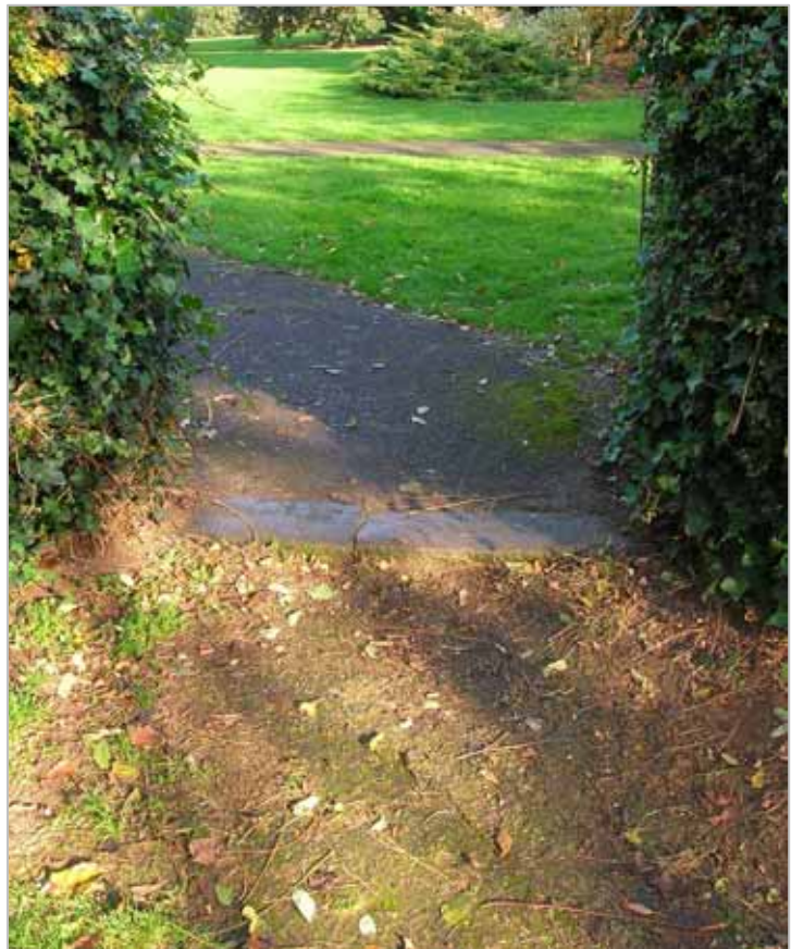
2007 Gateway to the west with worn grass verge

Signage within the square is visually worn and also in a state of decay. Sloping signs detract from the visual qualities of the square and contribute to the overall sense of neglect.