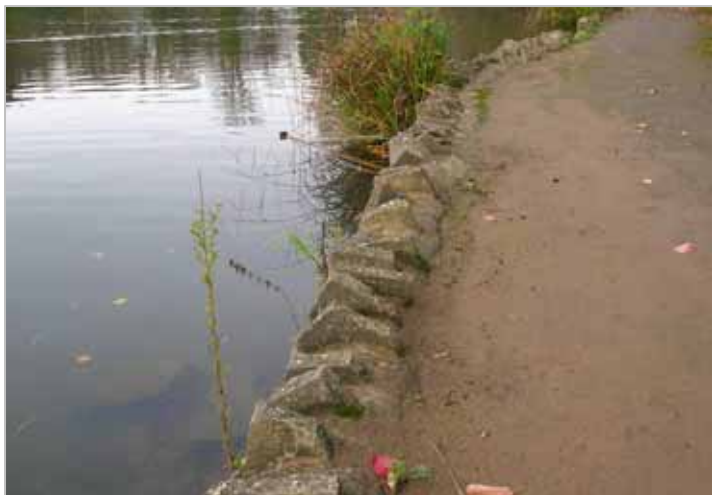
2007 Replacement edging material

To the north the lakeside is open and the hard surfaced path runs parallel with the lakeside. An informal stone edging divides the path from the water and, in places, this has become worn and dislodged. Replacement pieces have been incorporated from a variety of sources which do not maintain visual continuity.