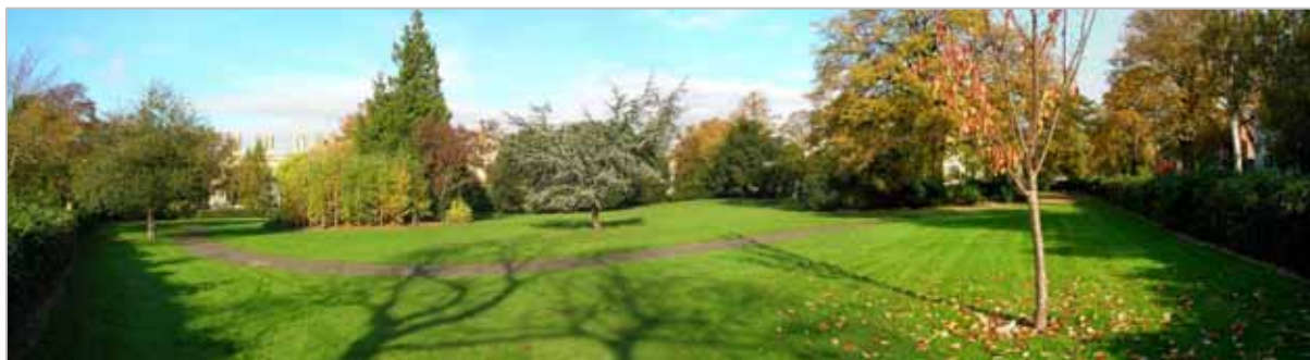
2007 Wellington Square looking north west

Within the boundary of the hedge, Wellington Square is a mature green space filled with collection of trees and shrubs. The footpath leads from each gateway towards a path which encircles the square. This hard, bitmac surfaced path is in generally good condition although there are isolated sections which are becoming worn or being colonized by moss.