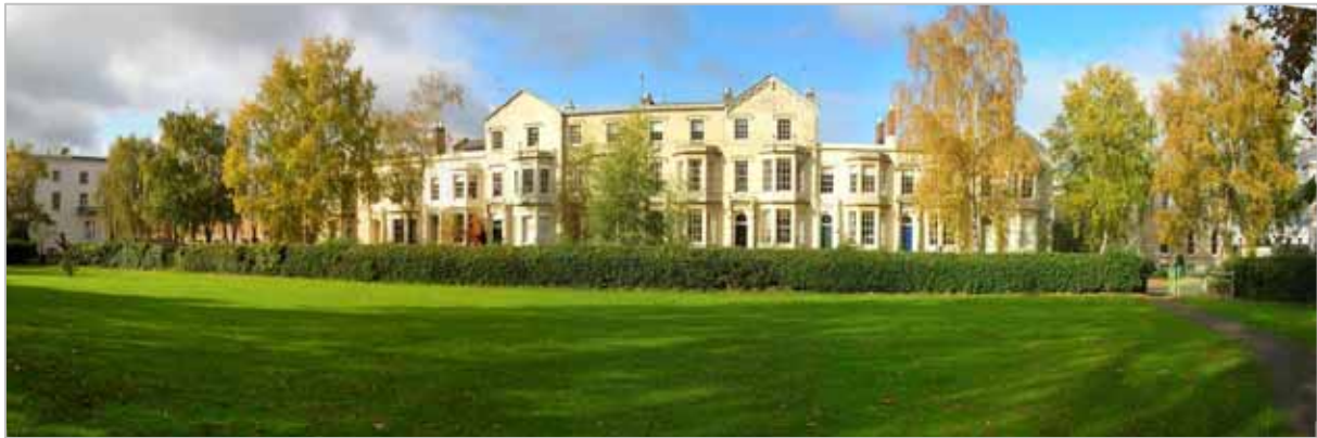
2007 Clarence Square looking west

Clarence Square is located to the south of Wellington Square, with its southern boundary defined by Clarence Road.