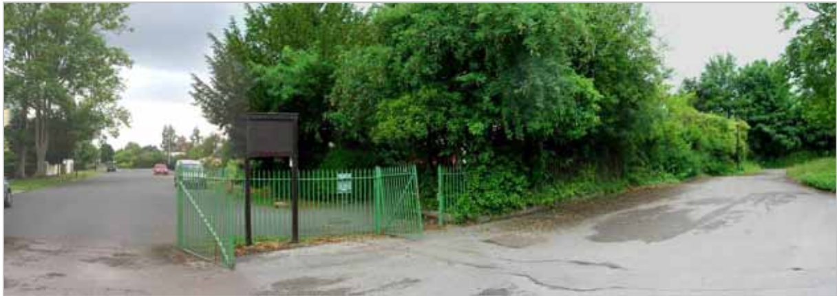
2007 Ironwork at the western gateway

The hard, bitmac surface level is such that the gates have worn a groove into the surface with the process of opening and closing. The bitmac surface is also showing signs of deterioration and has been removed, repaired or replaced in sections.