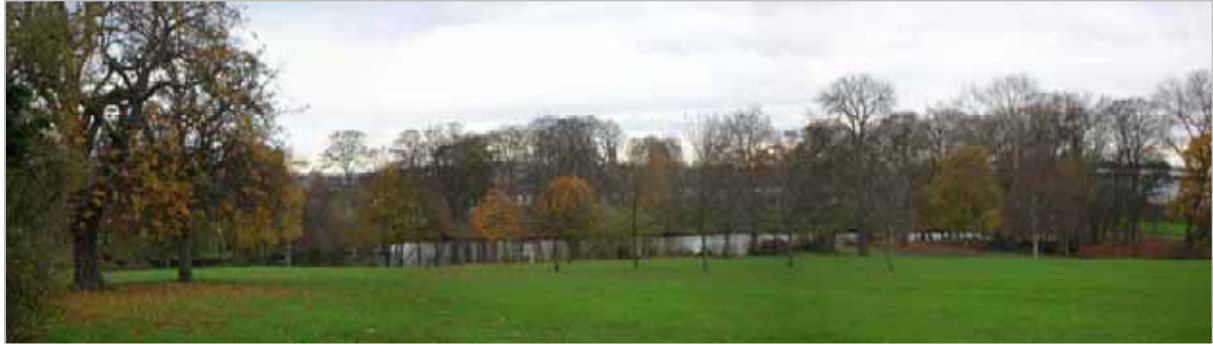
2007 Long distance views to Cheltenham town centre

Views south towards Cheltenham town centre are best achieved from Marle Hill, as its height above the park enables seasonal views through the canopy of mature trees. The distinctive church spires of St Mary's Church, St Paul's Church and Francis Close Hall are visible from the Agg Gardener recreation ground. Christ Church spire to the west is also visible from this point. Linear road patterns within the residential housing of St Paul's also enables views to these church spires.