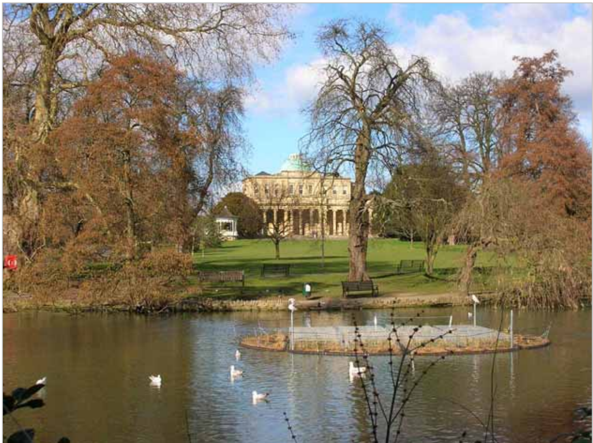
2007 Pump Rooms vista

Arguably, the most significant vista within the park is from the south shore of the Upper Lake, looking north towards the Pump Rooms. Historic photographs and the 1845 plan of the proposed Pittville estate reveal this intentional vista. Today, trees and vegetation have matured to close this vista and it is only visible now when seasonal changes to vegetation allow glimpse through the canopy. The vista is further spoilt by the addition of a floating reed bed within the Lower Lake, installed to control algae levels; it is an important addition although sited in visually the wrong place.