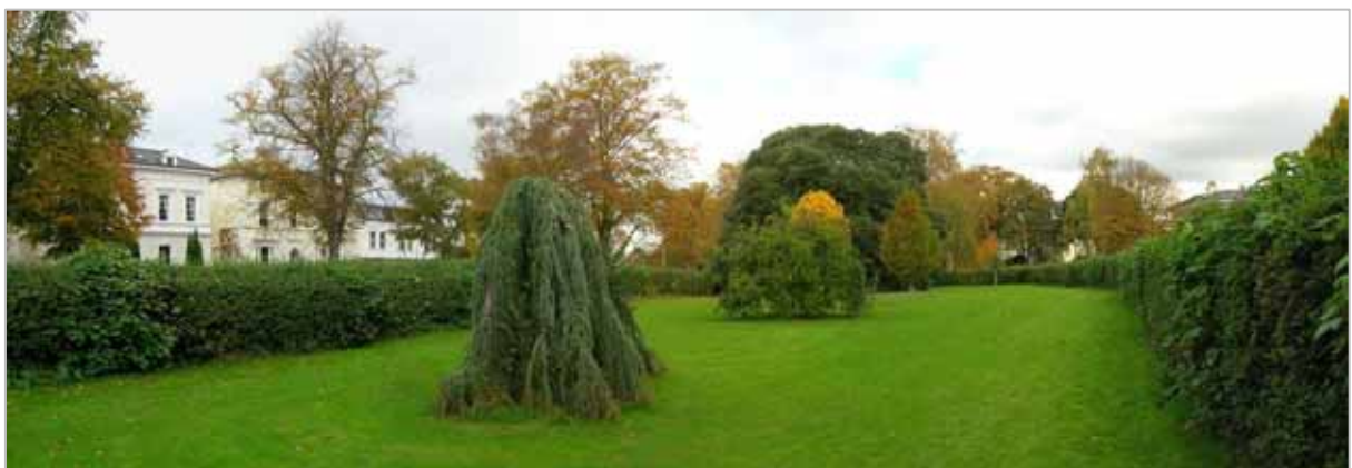
2007 Pittville Crescent south