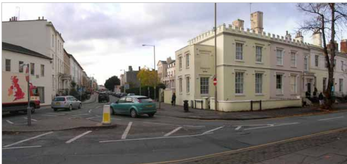
2007 View west to Clarence Road