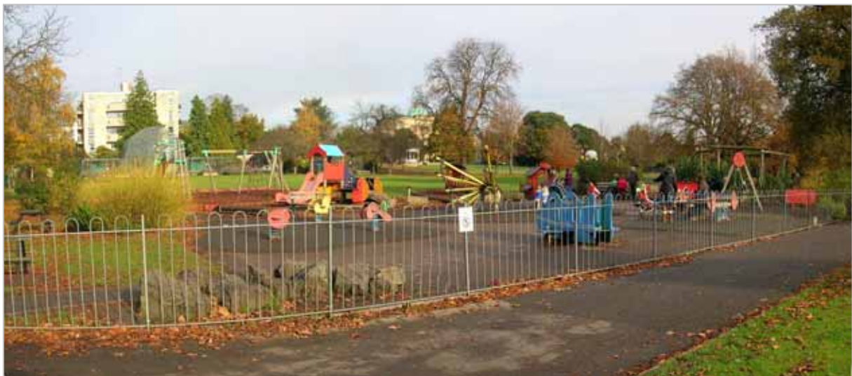
2007 Fenced play area

To the west of the Pittville Lawns is a large fenced off area which is occupied by the children's play area and aviaries. This is a very popular area for families with young children and older school children who use the park during their lunch breaks and after school. The equipment in the play area is understood to have been installed around 10 – 15 years ago and is looking tired and faded. Whilst there is a good range of equipment in the play area it caters predominantly for physical play and is aimed predominantly for younger children.