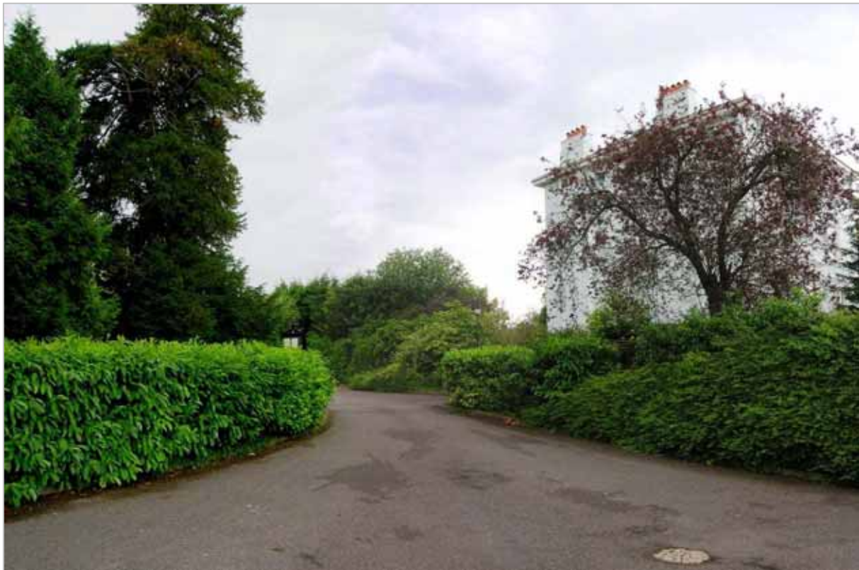
2007 Pinch point towards the car park

The wide bitmac surface extends north through a pinch point created by mature planting to either side. The planting is clipped to form a dense barrier alongside the bitmac surface to allow vehicular passage, although it is difficult to establish the species and nature of individual shrubs as a result.