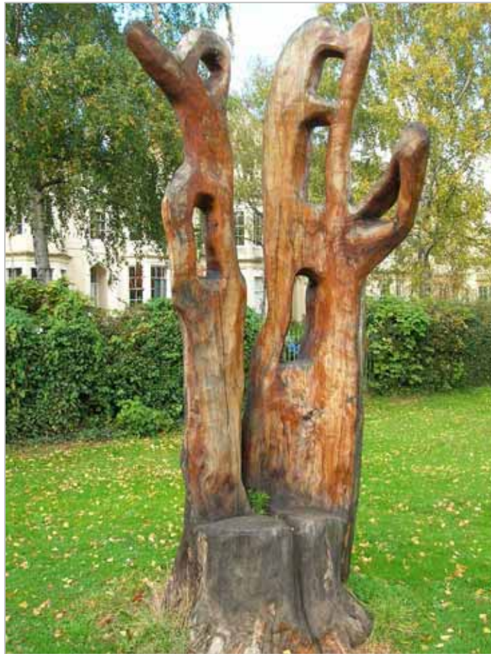
2007 Clarence Square sculpture

To the south western corner of the square stands a contemporary sculpture carved from wood, which provides an interesting focal point in the square which can also double as a seat.