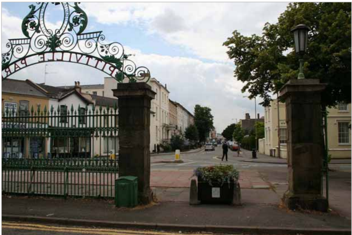
2007 Pittville Gates looking south

One box planter has been added between the wider of the western openings. There is a lack of symmetry with this single planter and whilst the plants contained within seem well maintained, the planter itself does not compliment the character and setting of the Pittville Gates.