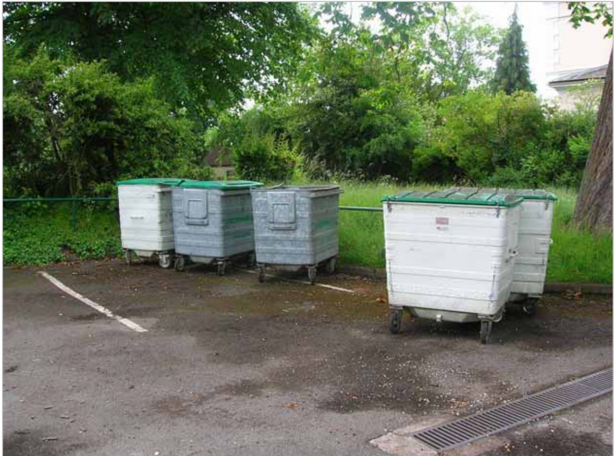
2007 Waste bins