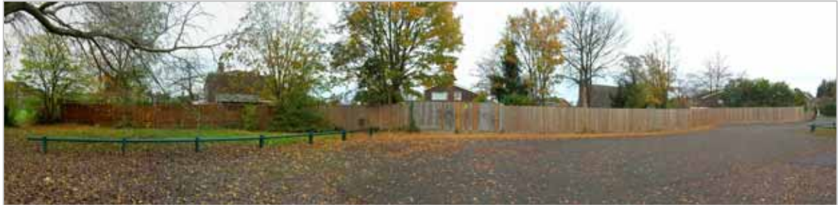
2007 Car park and fenced boundary

The boundary to the north is defined by Albermarle Gate and various boundary treatments. To the north west, within a small car park, the boundary is defined by a high wooden fence which backs on to the rear gardens of the residential houses.