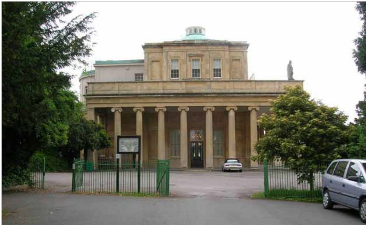
2007 Western approach to the Pump Rooms

The approach to the Pump Rooms from the west is via the West Approach Drive, off Evesham Road. This entrance is not considered to be the main vehicular access point and the gates are closed and locked throughout the night.