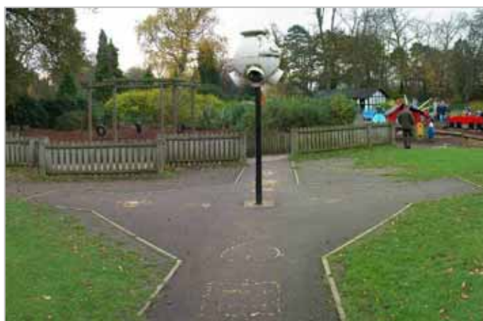
2007 Worn play surface markings

A serpentine path leads up the gentle grassed slope towards the aviaries which stand to the north of this fenced area. Green iron railings separate the area from the busy A435 Evesham Road to the west. To the side of this path is a large expanse of grass which is ideal for free play and is popular with families and older children