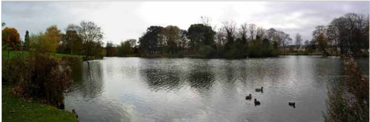
2007 Lower Lake from the west

The western lakeside area extends between the north and south lakeside area close to the Leisure @ Cheltenham sports centre. From this point there are views over the lake towards the island and towards both north and south lakeside.