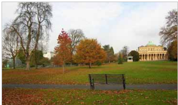
2007 Park benches

A plentiful supply of well maintained seating has been provided in this character area, comprising both wooden and wrought iron benches, in a variety of well chosen locations for optimum views of the Pump Rooms, The Upper Lake and internal views of the character area.