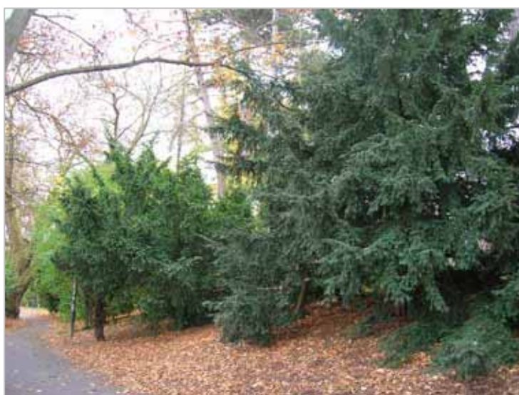
2007 Planting to the east of the area

The ground rises significantly towards the eastern extent of this area, the footpath continues along on the lower ground around the edge of the lakeside. The higher ground is heavily planted and the boundary to the south is defined by the walls of neighbouring residential houses and rendered concrete walls.