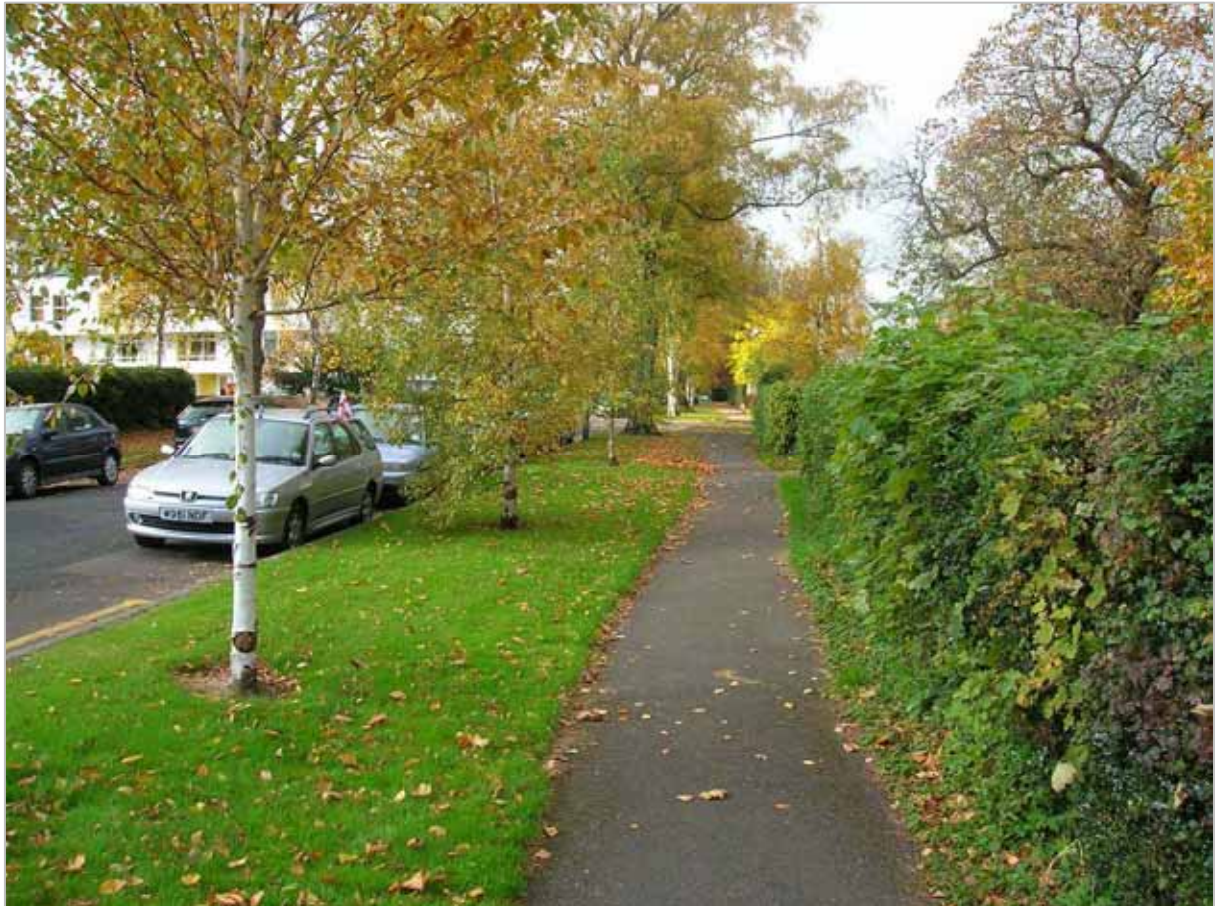
2007 Looking north along Albert Road. Grassed verge and pedestrian footpath with boundary hedge to the east

Access into Pittville Crescent north is via a single gated entrance to the south adjacent to Central Cross Drive. The ironwork is in the same style as Pittville Park and shows the same degree of deterioration and feeling of neglect.