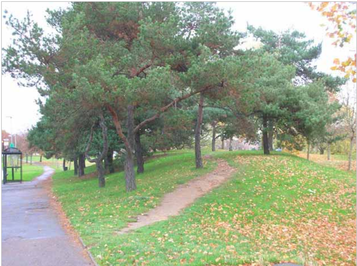
2007 Mature Scot's Pine along Tommy Taylor's Lane

To the western boundary of this character area, adjacent to Tommy Taylor's Lane stand a group of Scot's Pine ( Pinus sylvestris ). There is no footpath through these trees however, there are clear desire lines indicating that this is a popular route into the park at this point.