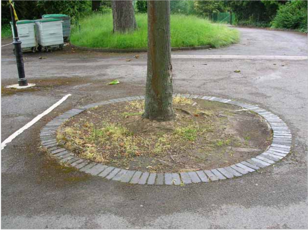
2007 Planting circles within the car park

To the south western corner of the car park stands a mature Horse Chestnut ( Aesculus hippocastanum ) and Lime ( Tilia x europaea ). To the north of the car park, along the boundary with neighbouring residential properties stand several Sycamore ( Acer pseudoplatanus ) and a Norway Maple ( Acer plantanoides ).