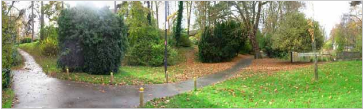
2007 East Lakeside looking south west

The eastern lakeside is adjacent to the A435 Evesham Road and is the entry point to the Lower Lake area for the majority of park users. The area runs from the A435 Evesham Road towards the Boathouse on the north shore and to the West Drive gateway on the south shore.