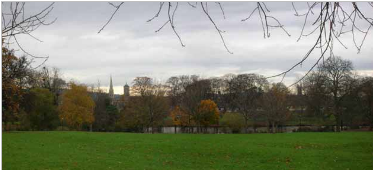
2007 Lower Lake to the south with Cheltenham and Leckhampton Hill beyond

There are excellent long distance views from this area across Cheltenham to Leckhampton Hill in the south