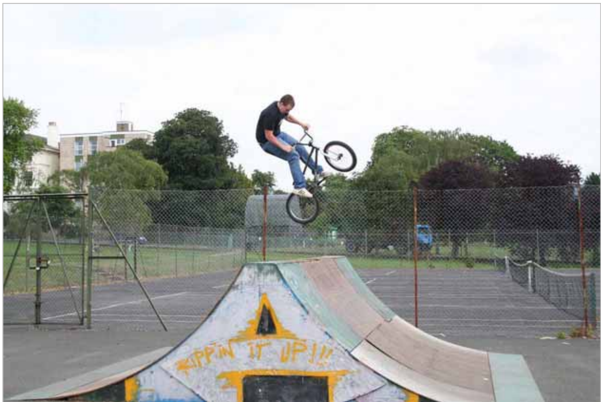
2007 Skateboard park

To the west of the tennis courts, in the space once occupied by more tennis courts, stand the skateboard park. This is a recent addition to the park and is popular with younger park users.