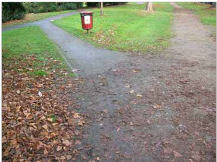
2007 Path deterioration

To the east however, there is an informal path with a compacted gravel surface which runs parallel with Pittville Lawn. This informal path is showing signs of deterioration, especially at the junctions with roads and hard surfaced footpaths.