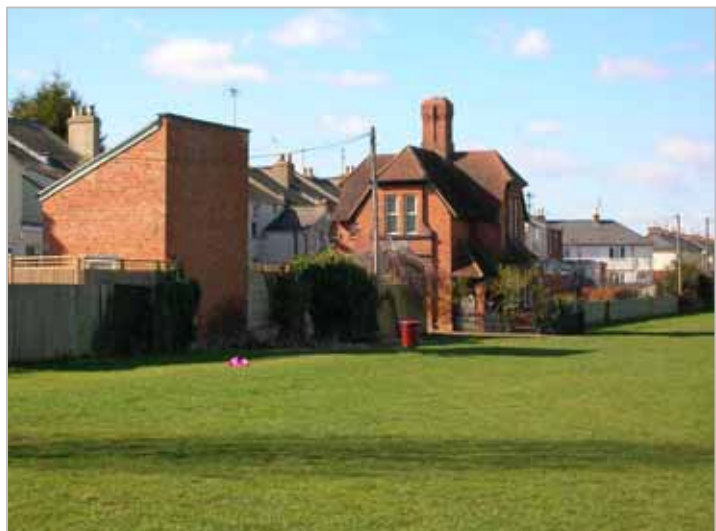
2007 Boundary treatment to the south

To the south the boundary is formed by the rear garden fences of the St Paul's area, and in places has an un-uniform and messy appearance.