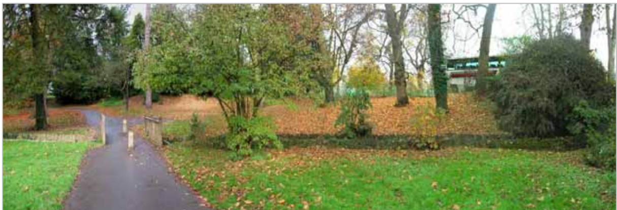
2007 East lakeside looking north

To the east the area is defined by the A435 Evesham Road with Pittville Pump Room Lawns, and the Upper Lake beyond. Crossing the A435 Evesham Road can be difficult, especially at times of busy traffic. A subway was built in 1892 to connect the two sides of the park, although originally an entry fee was charged to access Pittville gardens and a turnstile was installed to collect money from park users.