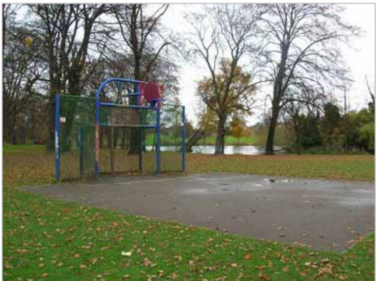
2007 Multi use games area

There are no seating opportunities provided for in this character area.