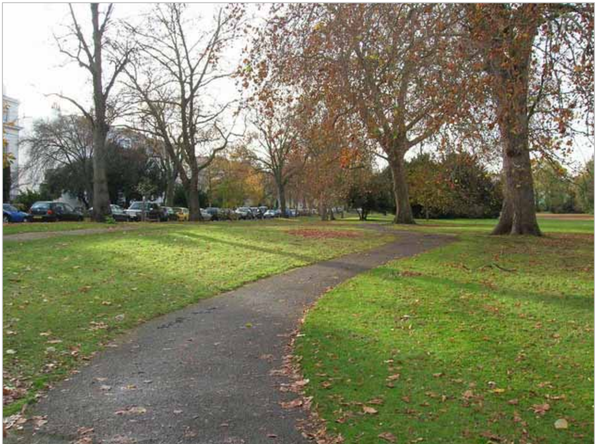
2007 Pittville Lawns South, path

The southern lawns differ from the northern lawns in the layout of the footpaths. Here the central footpath has been replaced with a sinuous, bitmac surfaced path which runs around the perimeter of the lawn, a short distance away from the various surrounding roads.