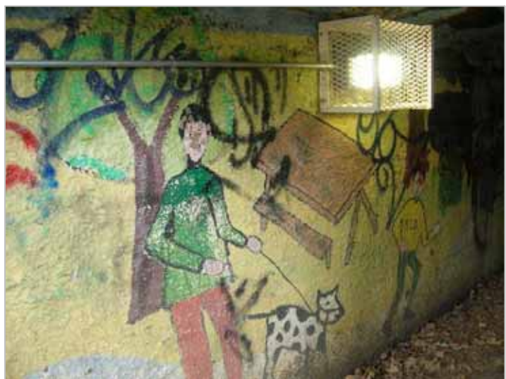
2007 Subway art work and lighting

The lighting within the subway is poor and on darker days is barely adequate to light the passage.