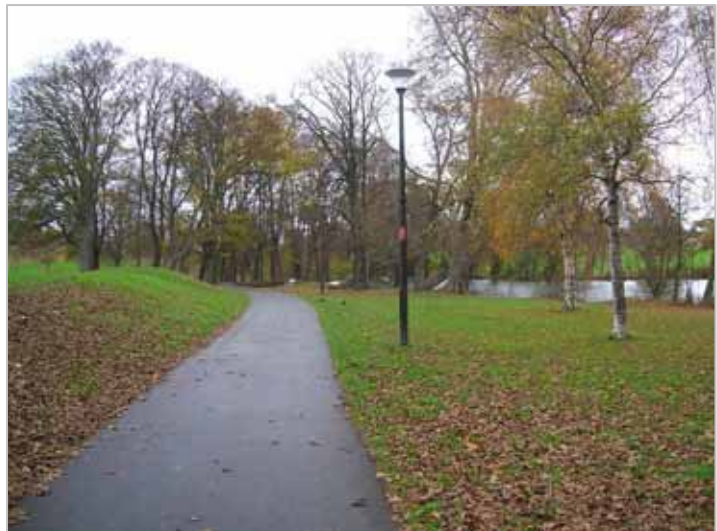
2007 Path running west towards Leisure @ Cheltenham

The path runs beneath an avenue of mature Sycamore trees ( Acer pseudoplatanus ) before it forks to the north-west towards the Leisure @ Cheltenham building and north-east towards the A435 Evesham Road. These paths run into the Lower Lake character area.