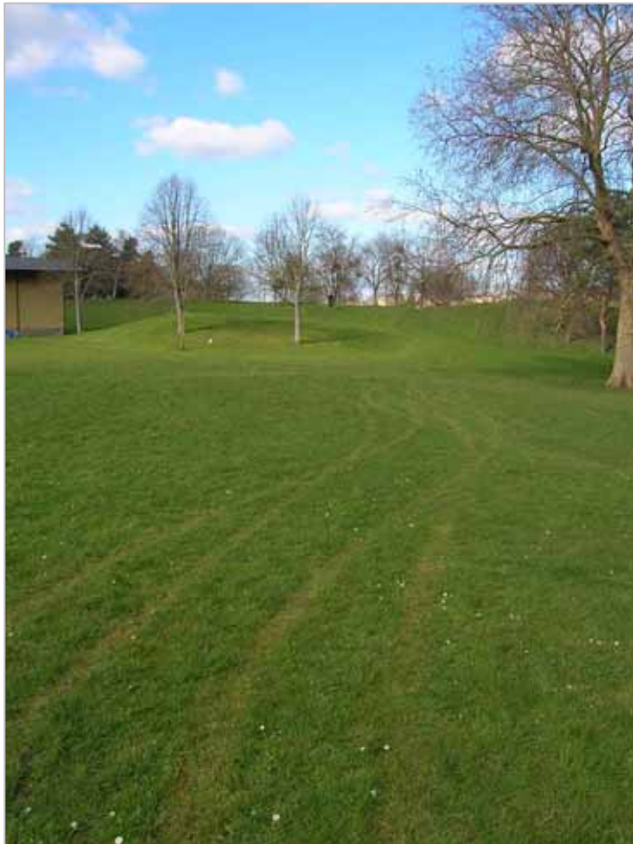
2007 Tyre tracks in the grass close to the western lakeside made by unauthorised vehicles

A bollard has now been installed into the centre of the footpath close to the bridge which crosses Wyman's Brook. This measure is already proving inadequate as motorbikes can still pass by easily on the footpath and cars are now being driving across the grass adjacent to the Leisure @ Cheltenham sports centre.