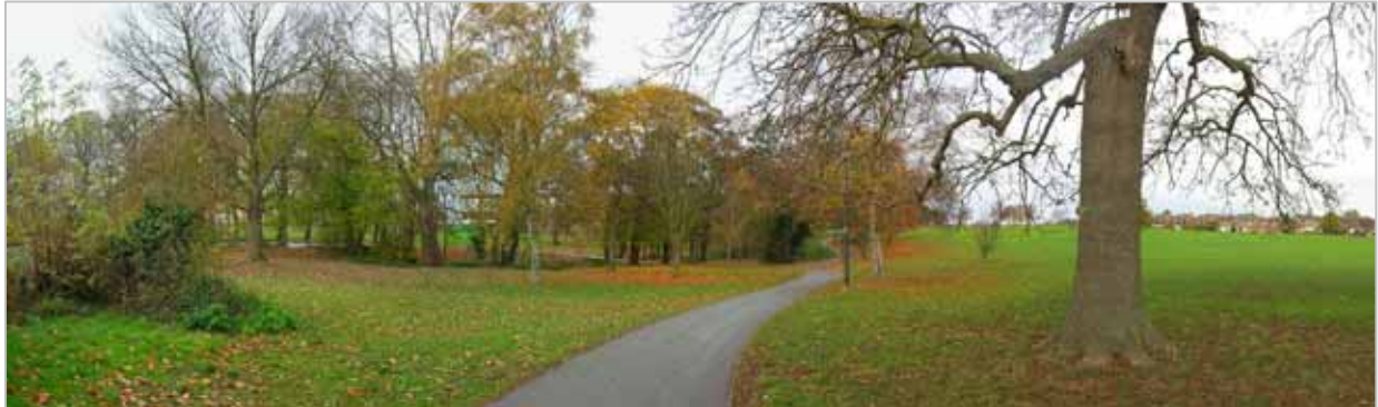
2007 Southern boundary of the sub area defined by footpath

The southern extent of this sub area is defined by a hard, bitmac surfaced footpath which runs east-west to the north side of the Lower Lake.