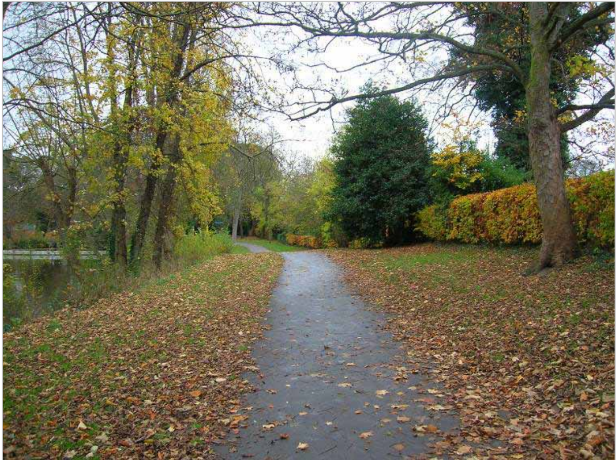
2007 Footpath looking east along the south bank of the Lower Lake and boundary hedge

At the eastern end of the boundary fence is a gateway leading into West Drive. The gateway is defined by a green iron railing fence and gate. The gate is padlocked but there is also a narrow opening to allow pedestrian and cycle access.