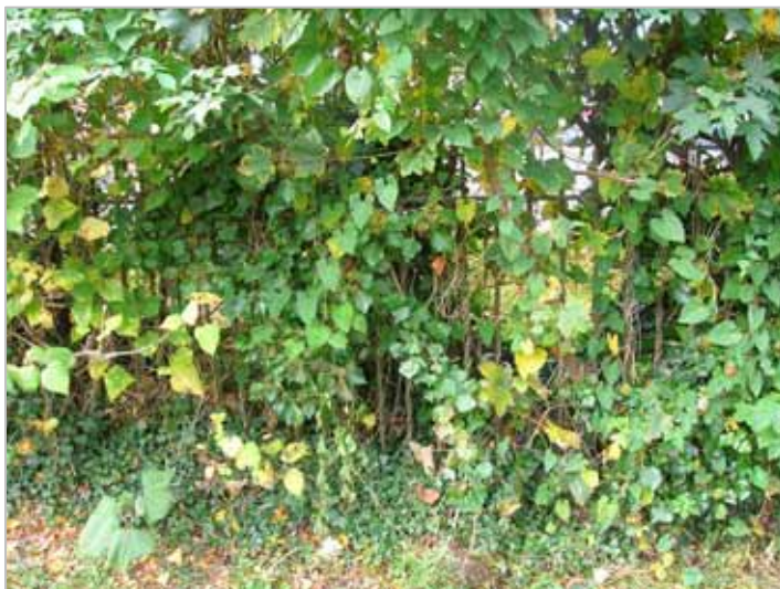
2007 Iron railings within the hedge

The hedge, which is well above head height, gives a overwhelming sense of enclosure to the green space with views out limited to gateway spaces.