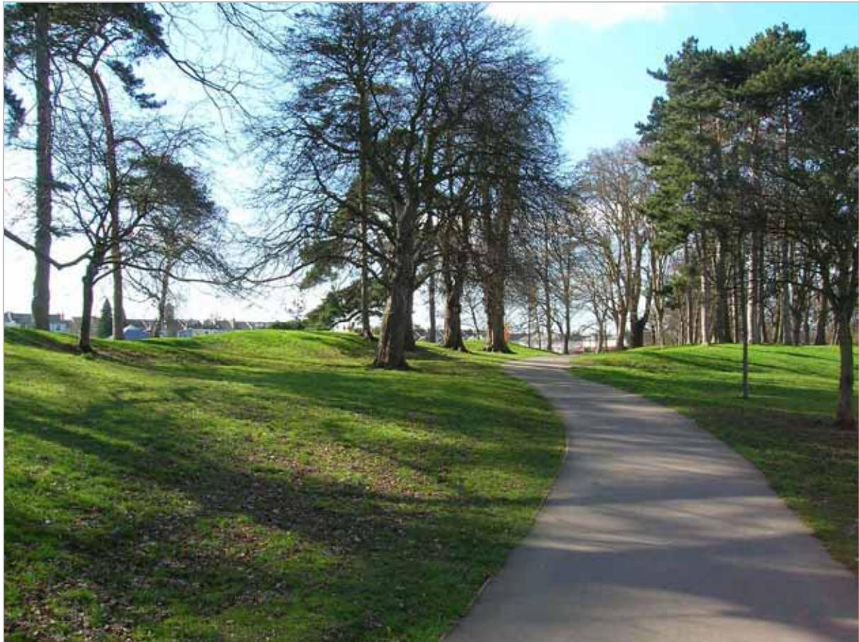
2007 Footpath looking west

The footpath which takes a circular route around the lake has a more sinuous path to the south, winding around the mature trees and bunds and creating a more interesting user experience. Towards the centre of the lakeside, close to the island, the footpath divides to follow two different routes, one around a bund and close to the lakeside, the other follows a path between the bunds, eventually rejoining the first path.