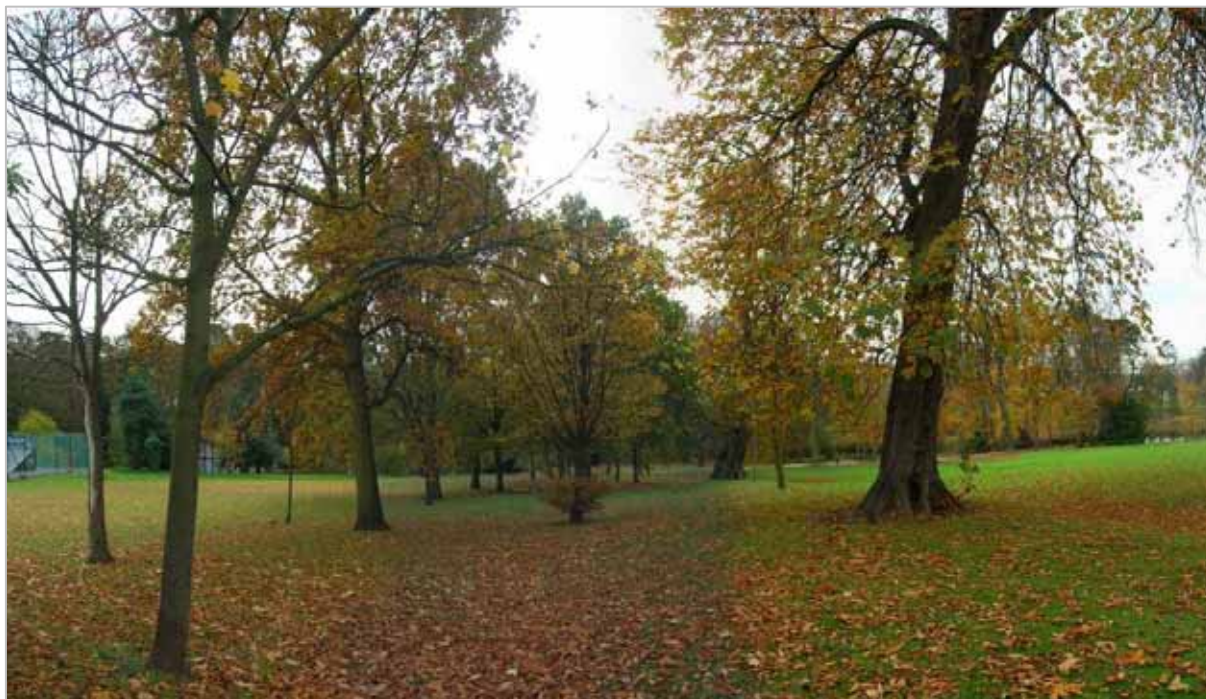
2007 Avenue of trees

There is only one formal footpath which runs through this sub area, leading from the entrance gate off the A435 Evesham Road and running adjacent with the tennis courts and skateboard park.