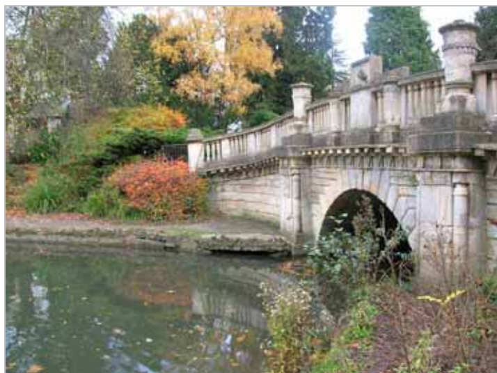
2007 Bridge to the east of the Upper Lake

The bridges provide valuable focal points within the east park and contribute the historic significance and aesthetic value within the park.