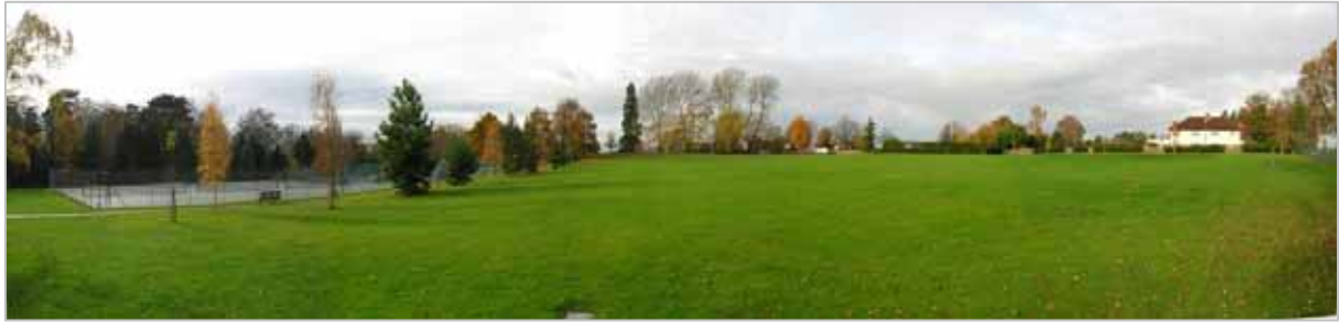
2007 Looking west over Marle Hill East

The Marle Hill East sub area is defined by the A435, Evesham Road to the east, Albermarle Gate to the north, the Lower Lake character area to the south and the western edge of the mature tree avenue which located the historic carriage drive from Marle Hill House.