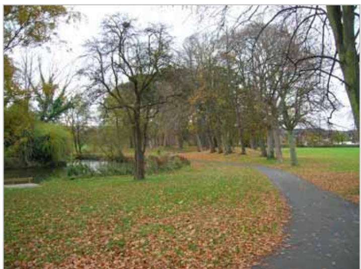
2007 Path running east towards A435 Evesham Road