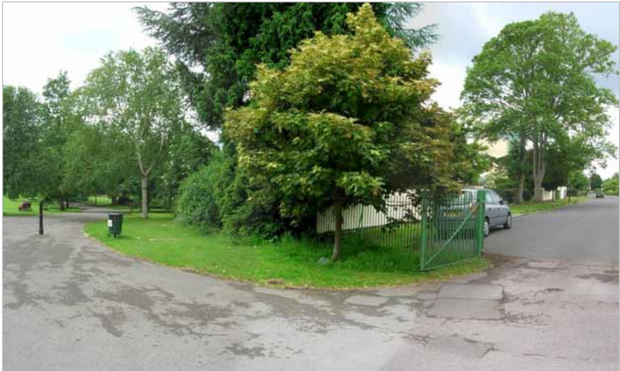
2007 Gateway looking south west

The ironwork to the south of the gateway is bordered to the east by a grassed verge and mature trees.