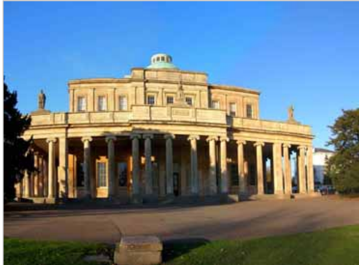
2007 Pittville Pump Rooms