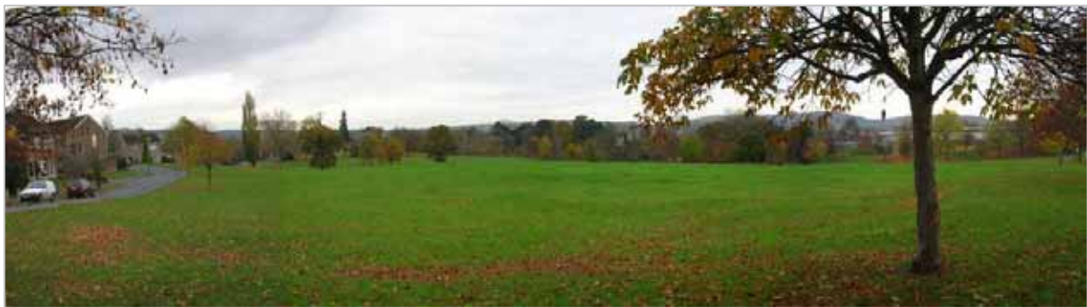
2007 Marle Hill looking east

The western boundary of this area is defined by Tommy Taylor's Lane. To the north the area is defined by Albermarle Gate with the front gardens of residential houses beyond. To the south is the western end of the Lower Lake and the Agg Gardner West character area, which is divided from Marle Hill by a hard, bitmac surfaced footpath which leads east from Tommy Taylor's Lane towards the Lower Lake. To the east the central Marle Hill sub area.