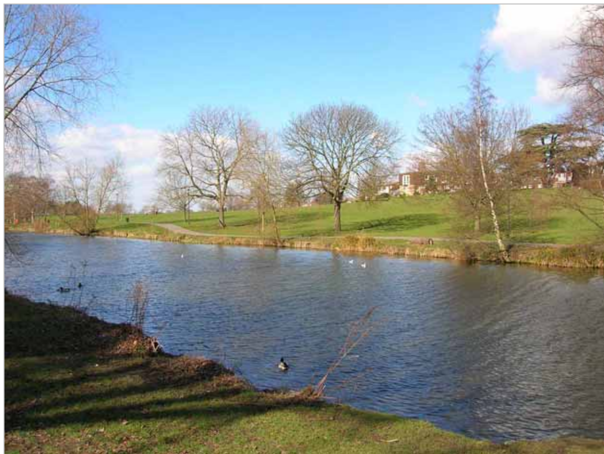
2007 View north west across Lower Lake

To the south west of the park is the Agg Gardner recreation ground which is adjacent to the St Paul's residential area. Views into the park are presented at the gateways which adjoin Marle Hill Road. Mature tree planting within the park, surrounding the Lower Lake can be a barrier to views, although seasonal changes do allow glimpses through the canopy, towards Marle Hill to the north.