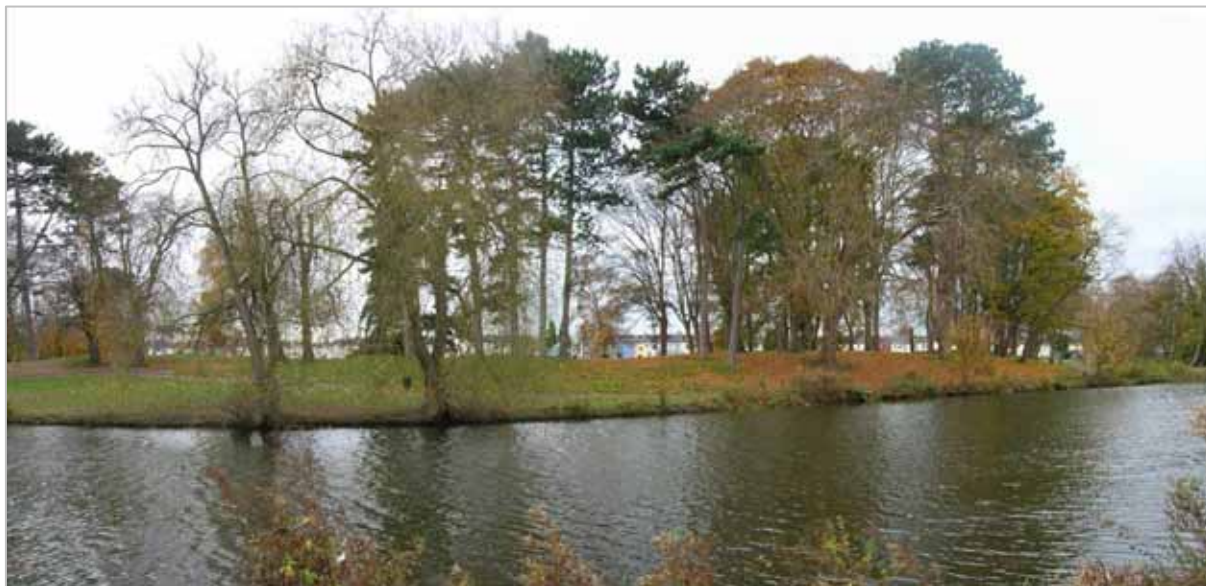
2007 The south Lakeside from the north

The South Lakeside area runs from the A435 Evesham Road at the point where the Lower Lake begins, past the island in the lake towards the Leisure @ Cheltenham sports centre. As the lakeside turns north this area ends. To the south is the Agg Gardner recreation ground and beyond that Cheltenham town centre and to the north the Lower lake.