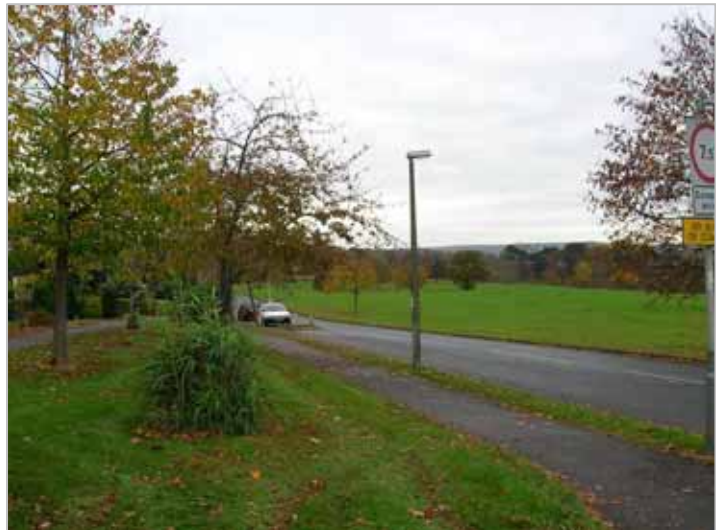
2007 Footpath alongside Albermarle Gate

To the north Albermarle Gate has a footpath adjacent to the residential houses only.