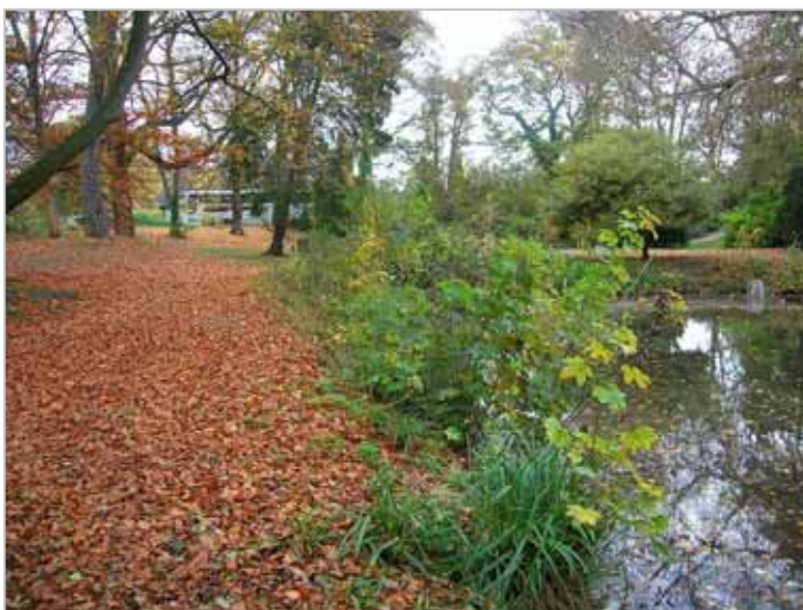
2007 Planting around the eastern lakeside

Planting around the lake at this point is, in parts, becoming overgrown and is in need of maintenance to keep it in check.