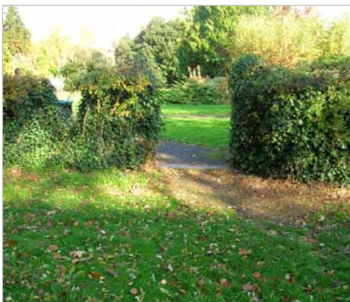
2007 Wellington Square gateway with missing gate

Access into Wellington Square is via gateways to the north, south, east and west sides. The gateways are defined by open sections of the hedge, by iron railings with gate missing and iron gates. The ironwork is in decline and is in need of renovation or replacement. The lack of unity in the gateway treatment also adds to the appearance of neglect.