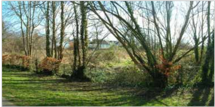
2007 Boundary to the south

Towards the eastern section of this area, the lakeside is contained within a narrow strip of land. To the south are allotments and Dunalley County Primary School. The boundary is defined by a medium height iron fence with Beech hedging and tree saplings. In places the hedging is in poor condition and is in need of replacement.