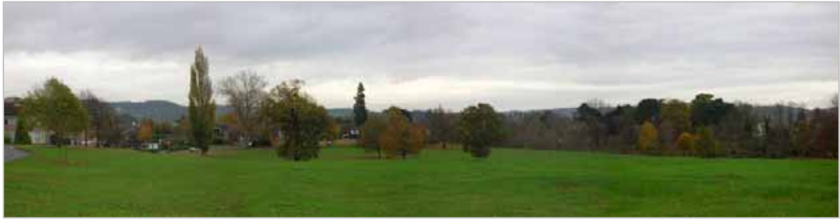
2007 Undulating grassland

There are no footpaths which run through this area, except those which run along the boundary with other areas. There is a narrow, hard surfaced footpath adjacent to Tommy Taylor's Lane which runs north-south alongside the road.