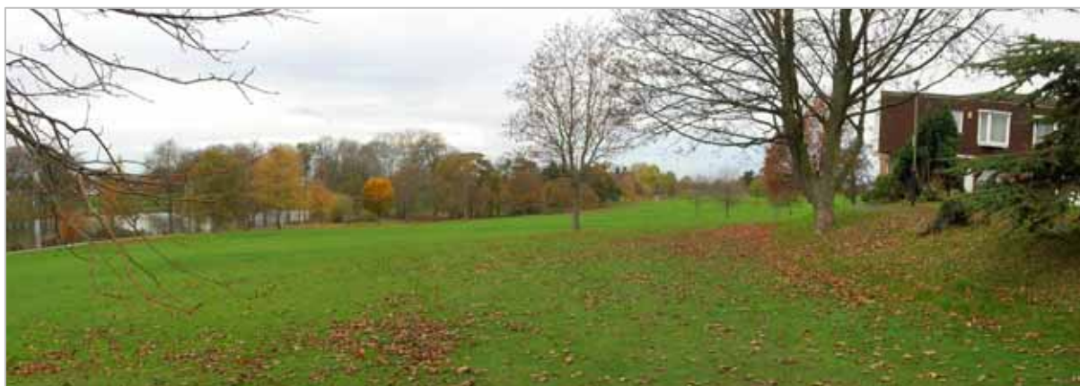
2007 Looking south west from Marle Hill East