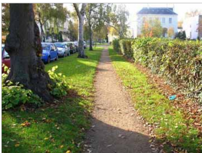
2007 Wellington Square north

The verge which encircles the square has, in places a footpath which runs adjacent to the boundary hedge. This footpath is surfaced with compacted gravel and is, in places becoming worn.