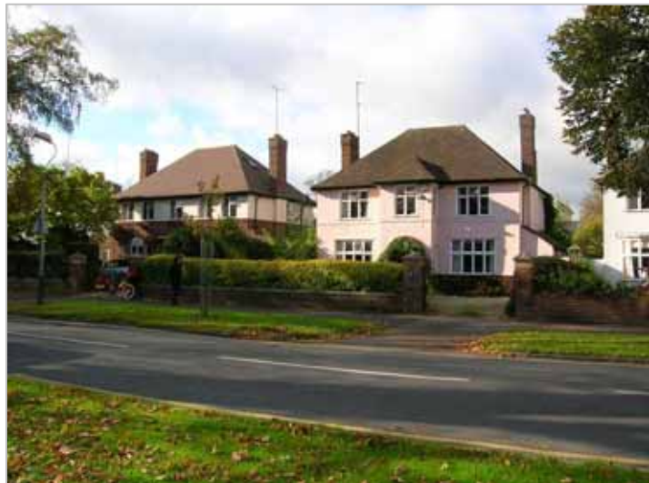
2007 Houses along Albert Road

Albert Road and Pittville Crescent are predominantly made up of individual houses and villas, all with enclosed, mature gardens. There are a significant number of street trees along both roads which give a sense of vertical scale and age to the area.