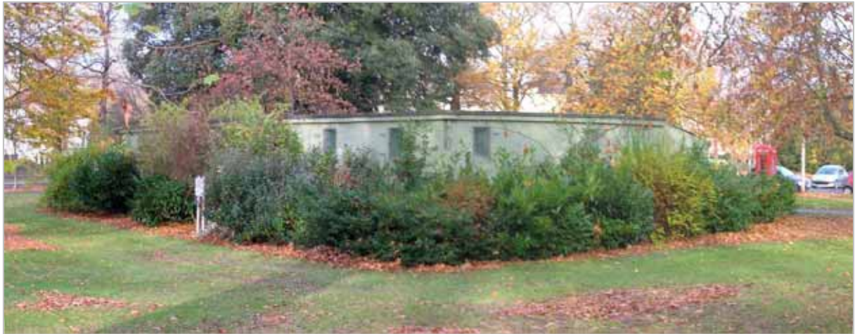
2007 The Scout Hut (above and below)

The only building in Pittville Lawns south stands adjacent to Central Cross Road to the north. It is a former air raid precaution control centre and was built in 1942. The building has had various uses and today is home to the 10 th Cheltenham (All Saints) Scout Group.