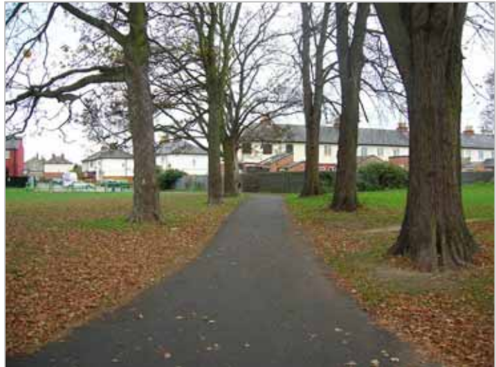
2007 Path through Sycamore Avenue

There is only one hard surfaced path which runs along the boundary with the Agg Gardner West character area. This path leads from the St Paul's gateway in the south directly north into the park.