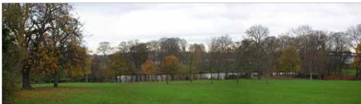
2007 Looking south from Marle Hill Centre, towards the Lower Lake