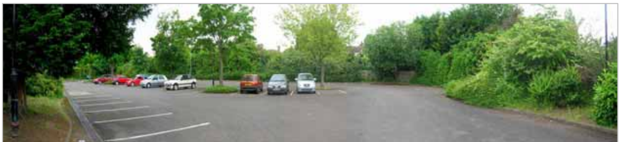
2007 Car park looking north