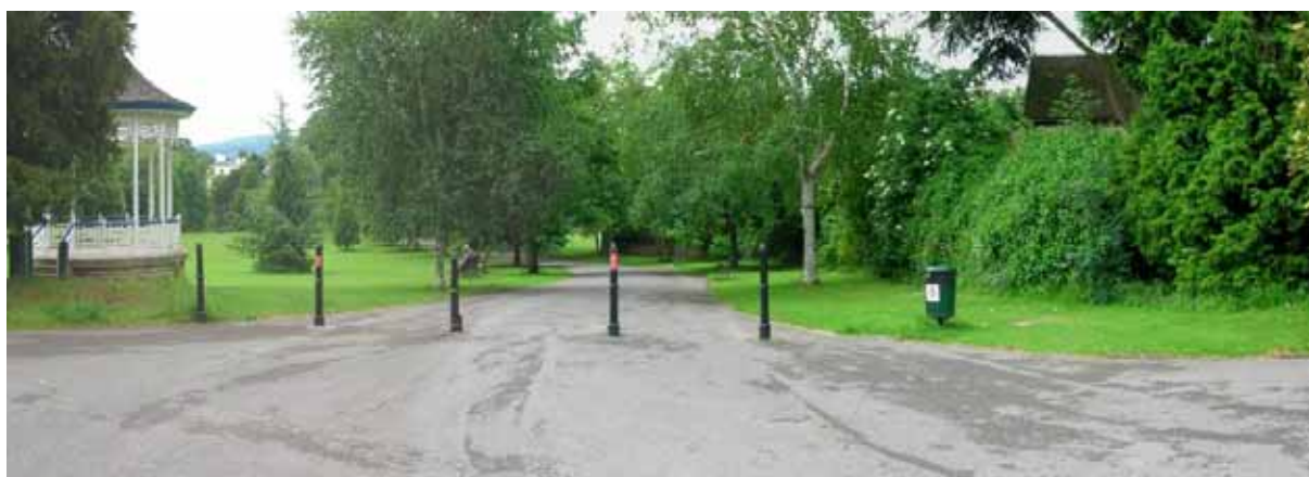
2007 Drive to the south west

The hard bitmac surface continues to the south west towards the play area and on to the upper lake. A row of black bollards prevent vehicular access beyond this point.