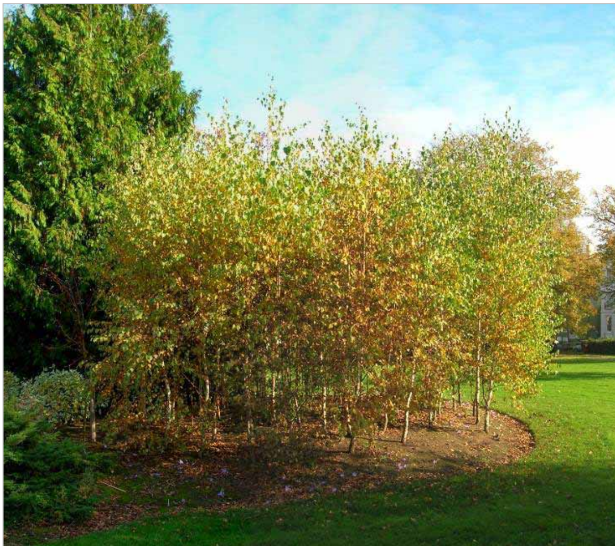
2007 Trees and shrubs

Within this distinctive green space there is little seating provision. On the occasion of site visits in November 2007, this single bench was damaged.