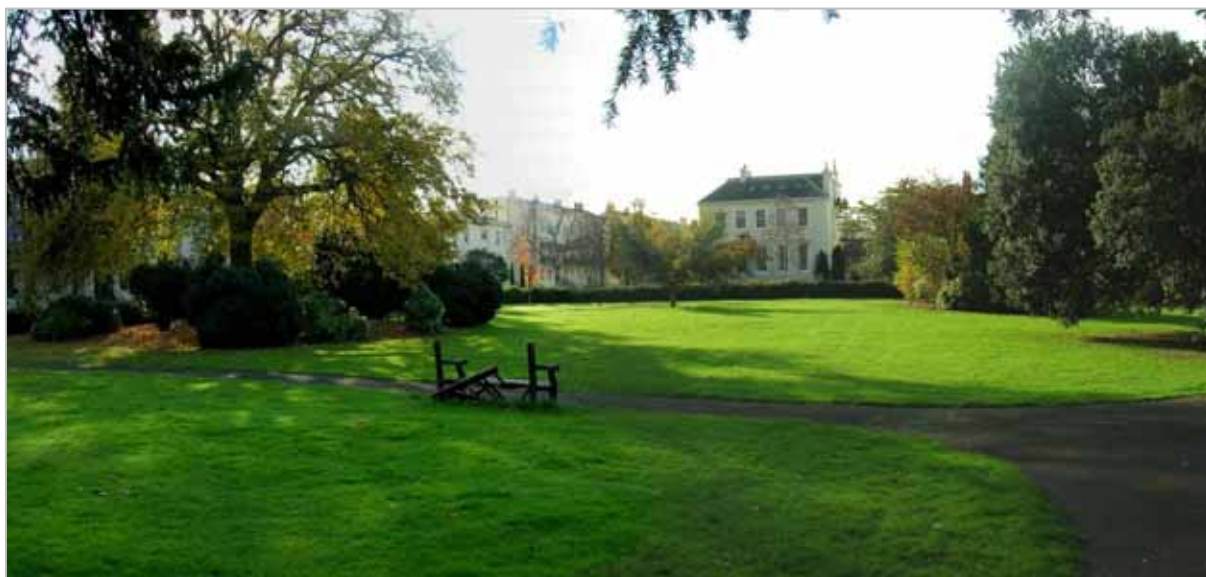
2007 Wellington Square broken bench

Within this distinctive green space there is little seating provision. On the occasion of site visits in November 2007, this single bench was damaged.