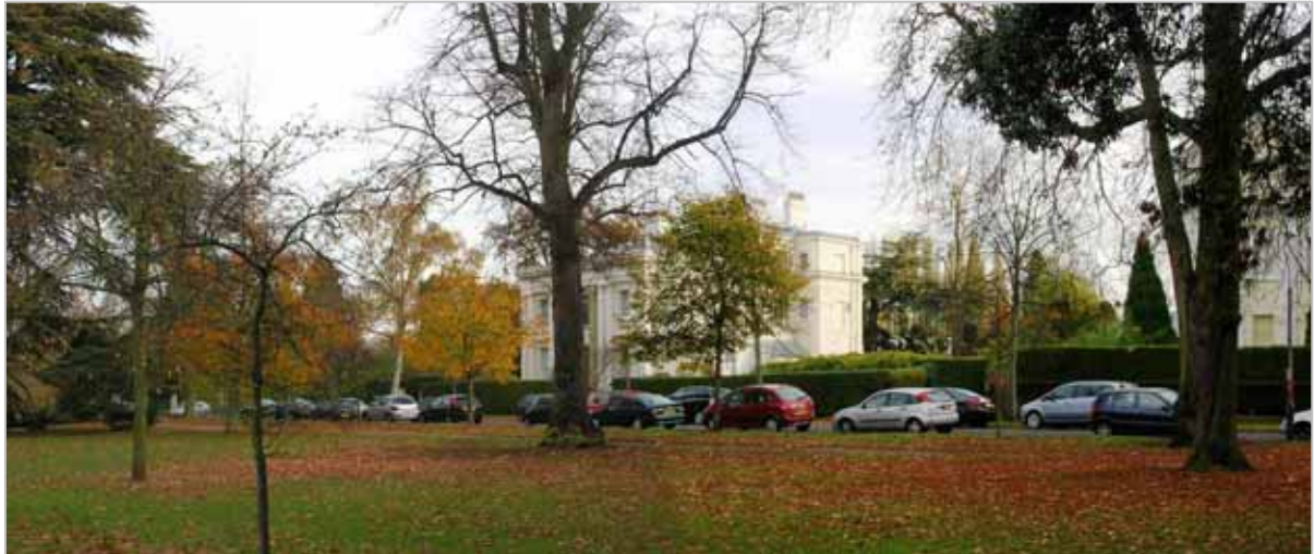
2007 Surrounding residential properties, Pittville Lawn North

The Pittville Lawns are located to the south of the Upper Lake, to the east of the A435 Evesham Road. The lawns run towards Cheltenham town centre and are surrounded by Regency and later Victorian villas, detached houses and terraced houses, many of which are listed as being of special architectural, historical or cultural significance. The lawns were originally fenced and the residents whose houses surrounded the lawns had keys. Between 1890 and 1954 there was an admission charge for entry into the lawns.