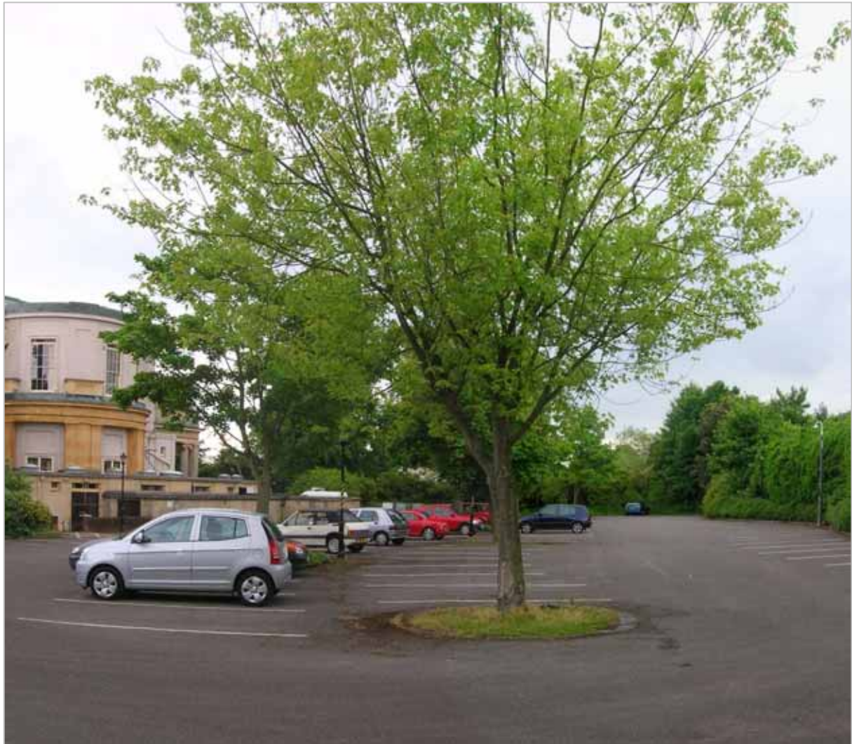
2007 Car Park looking west