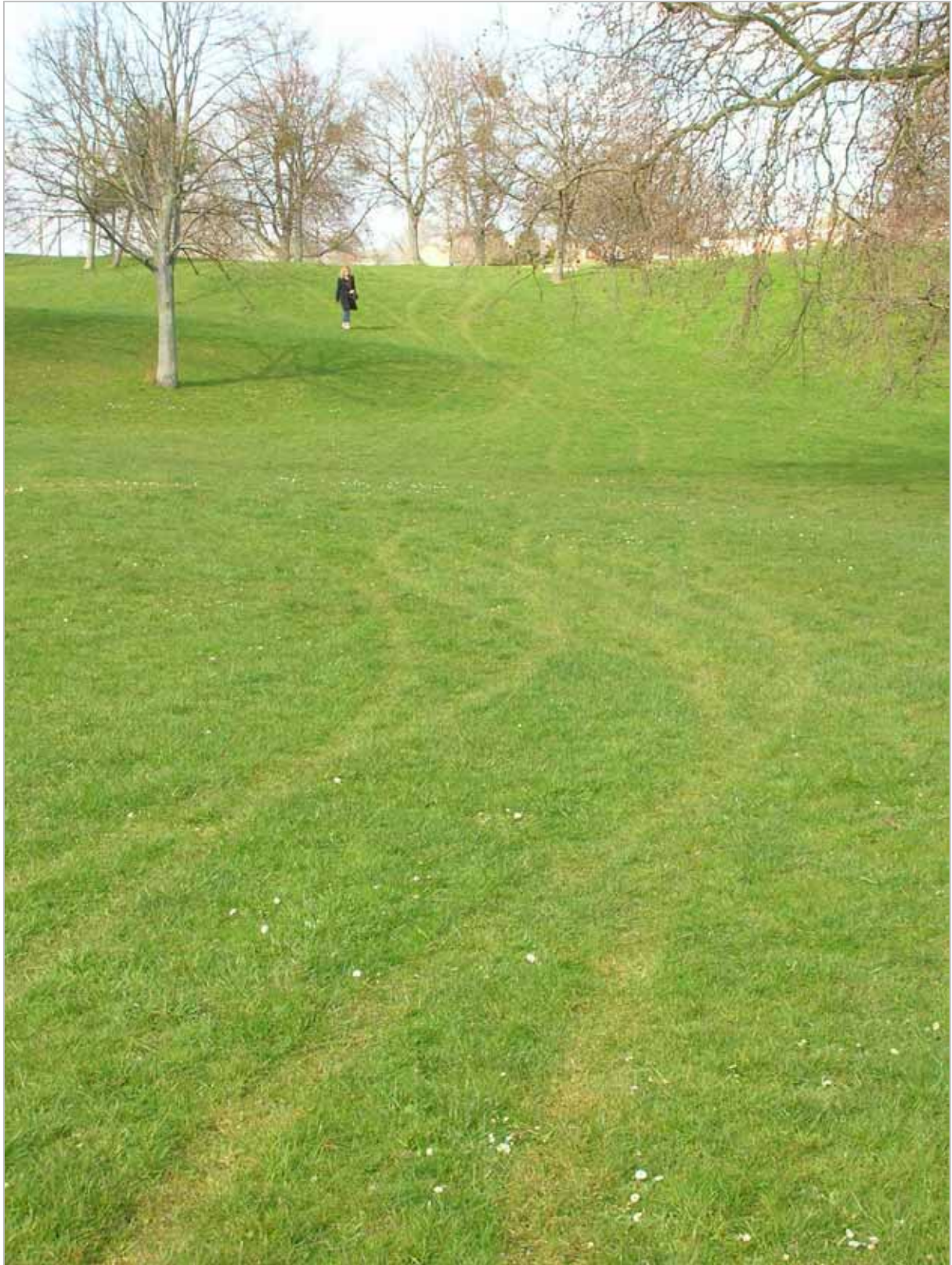
2007 Tyre tracks made by unauthorised vehicles