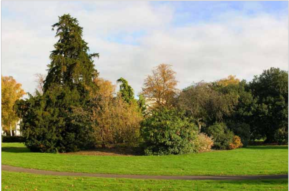
2007 Wellington Square