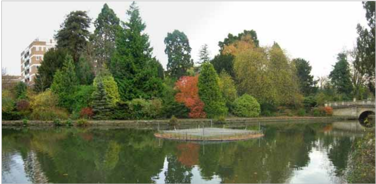
2007 Rockery and eastern bridge

There is also a rockery towards the western bridge, which is also dated from 1890. This rockery is however far more overgrown and has lost all of its original definition.