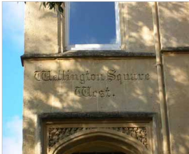
2007 Wellington Square West

The residential fabric surrounding the square is made up of terraced houses and villas, all with gardens which face into the square. These gardens would have originally been enclosed by iron railings, however, these were largely removed during the second world war and were replaced by hedges, which, are now so high that they both physically and visually enclose the houses and the square.