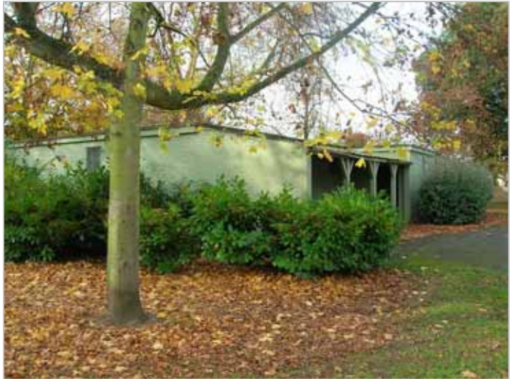
2007 Scout Hut

Constructed of painted brickwork and in-situ concrete, this building is functional yet visually out of place within it's historic setting.