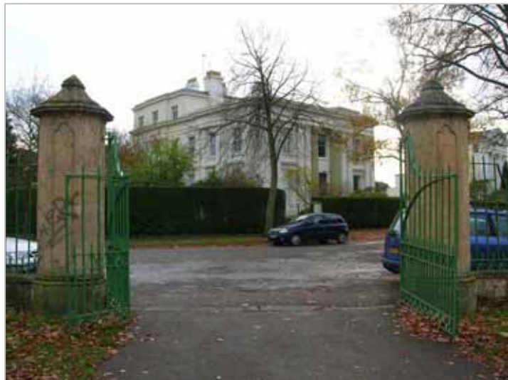
2007 Gates off Pittville Lawn