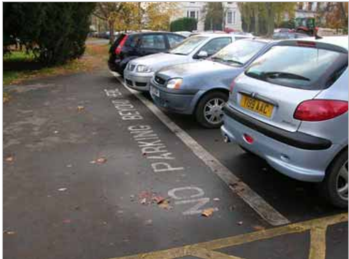
2007 Road and Pavement markings (above and below)

At the southern end of the lawns along Central Cross Drive, there are a number of cars which park on a daily basis. Often the cars park on the pavement, blocking access onto the lawns, especially for disabled users.