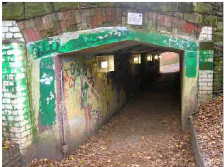
2007 Subway current visual condition

The subway was originally decorated with glazed tiles and later rendered with concrete. Artwork had been painted on the walls, however this is now mostly covered with graffiti, looking very neglected.