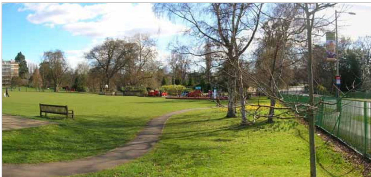
2007 Play area and lawn

A serpentine path leads up the gentle grassed slope towards the aviaries which stand to the north of this fenced area. Green iron railings separate the area from the busy A435 Evesham Road to the west. To the side of this path is a large expanse of grass which is ideal for free play and is popular with families and older children