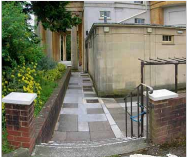
2007 Lower level courtyard (above and below)

A series of narrow steps leads from the car park down to the lower level courtyard and on to the Pump Room entrance via the east colonnade. A handrail is provided to one side only.