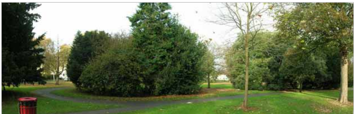
2007 Mature trees and shrubs block views out of the area