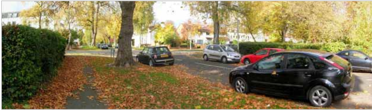
2007 Looking west along Central Cross Drive, with Pittville Crescent south to the left.

To the north of the crescent, Central Cross Drive divides the space from Pittville crescent north. This road, which is predominantly used for car parking, also has wide grassed verges which contain mature street trees and a hard surface pedestrian footpath.