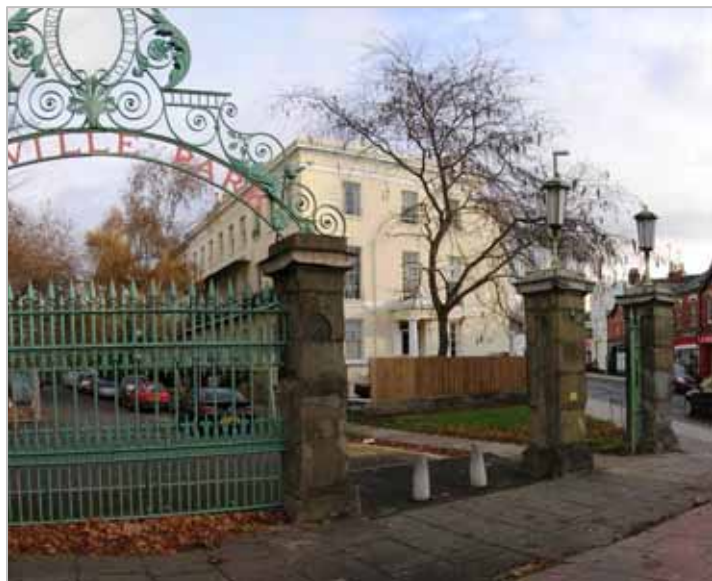
2007 Concrete bollards

The four outermost piers have tall lighting units on the coping? It is not known if these lights are operational.