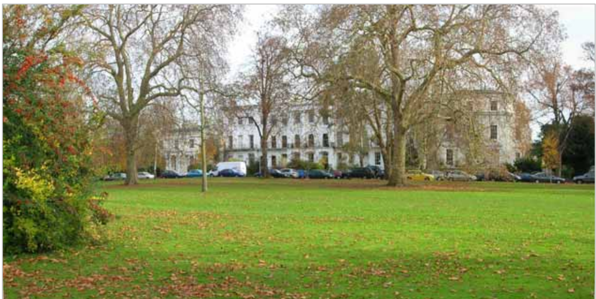
2007 Pittville Lawn South