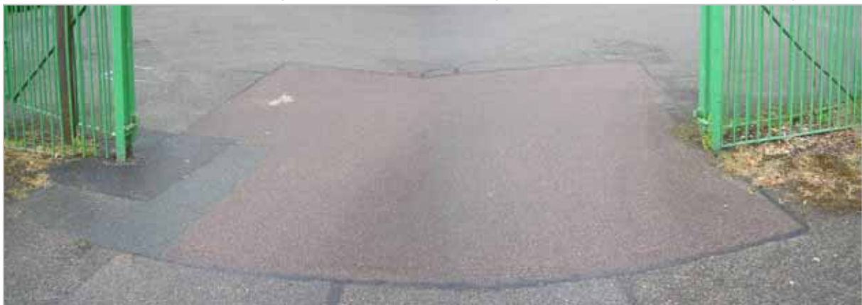
2007 East Approach Drive gateway

The gateway ironwork is showing signs of deterioration and gives a visual appearance of neglect. To the north and south, the bitmac road surface runs under a section of the ironwork. A lack of pedestrian or vehicular traffic here has enabled the colonisation of moss and weeds which continue to grow unchecked, adding to the visual appearance of neglect.