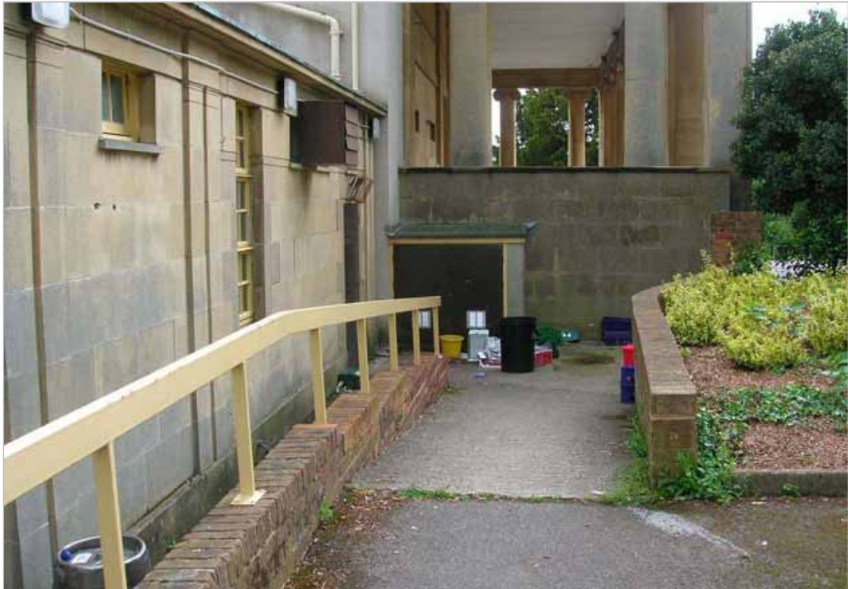
2007 Exterior of Pump Rooms (above below)

To the south west, the car park contains a selection of waste bins, which appear to be randomly stored away from the main building.