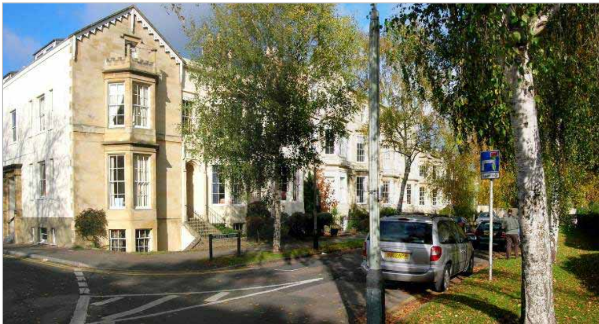
2007 Junction of Clarence Square West and Clarence Road

As with Wellington Square, the residential fabric surrounding the square is made up of terraced houses and villas, all with gardens which face into the square. These gardens would again have originally been enclosed by iron railings, however, these were largely removed during the second world war and were replaced by high hedges which both physically and visually enclose the houses and the square. To the corners of the square run the adjoining roads.