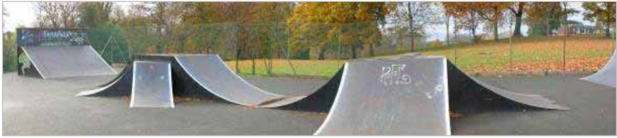
2007 Skateboard park equipment

There is graffiti on many of the pieces of equipment within this skateboard park and much of it is clearly visible from distances away within the wider parkland. This graffiti has a detrimental affect on the visual character of the park.