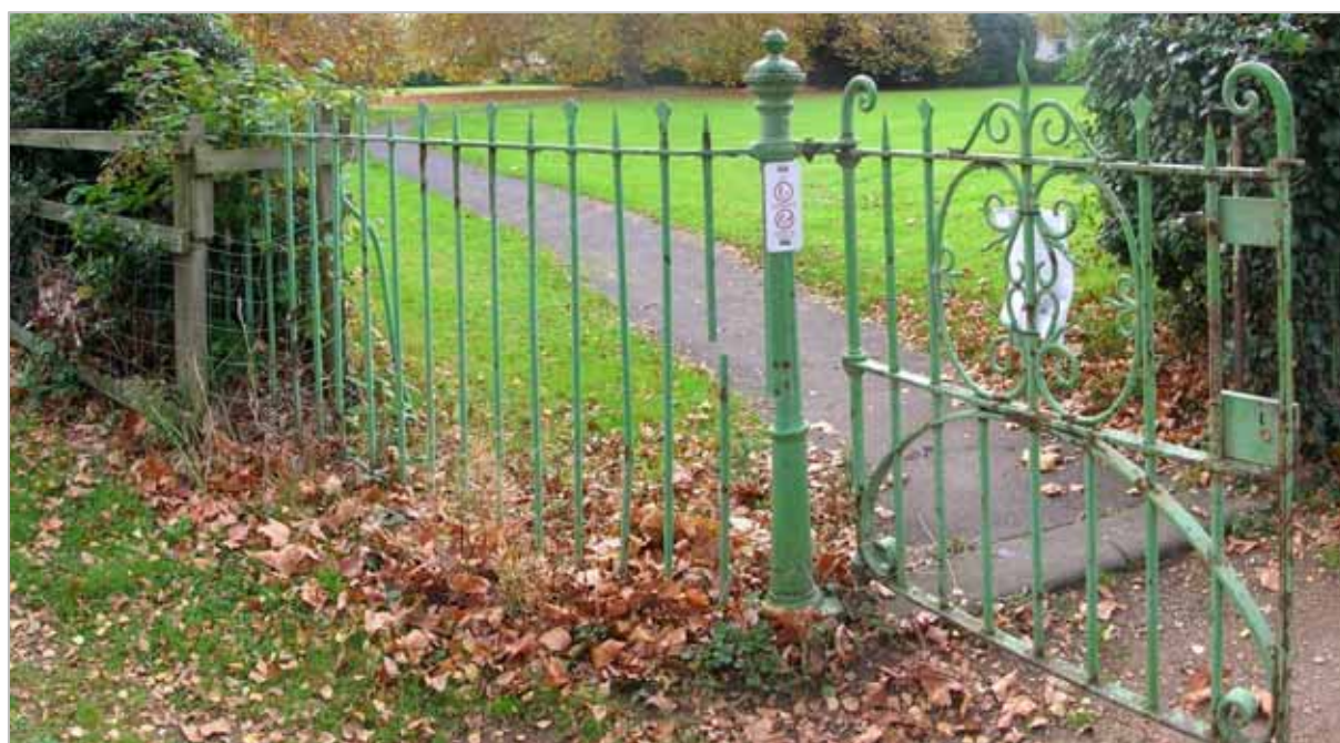
2007 North west gateway

Clarence Square differs from Wellington Square with the gateways positioned to the four corners, north, south, east and west rather than being located along the sides. The gateways are defined with ironwork in varying states of deterioration.