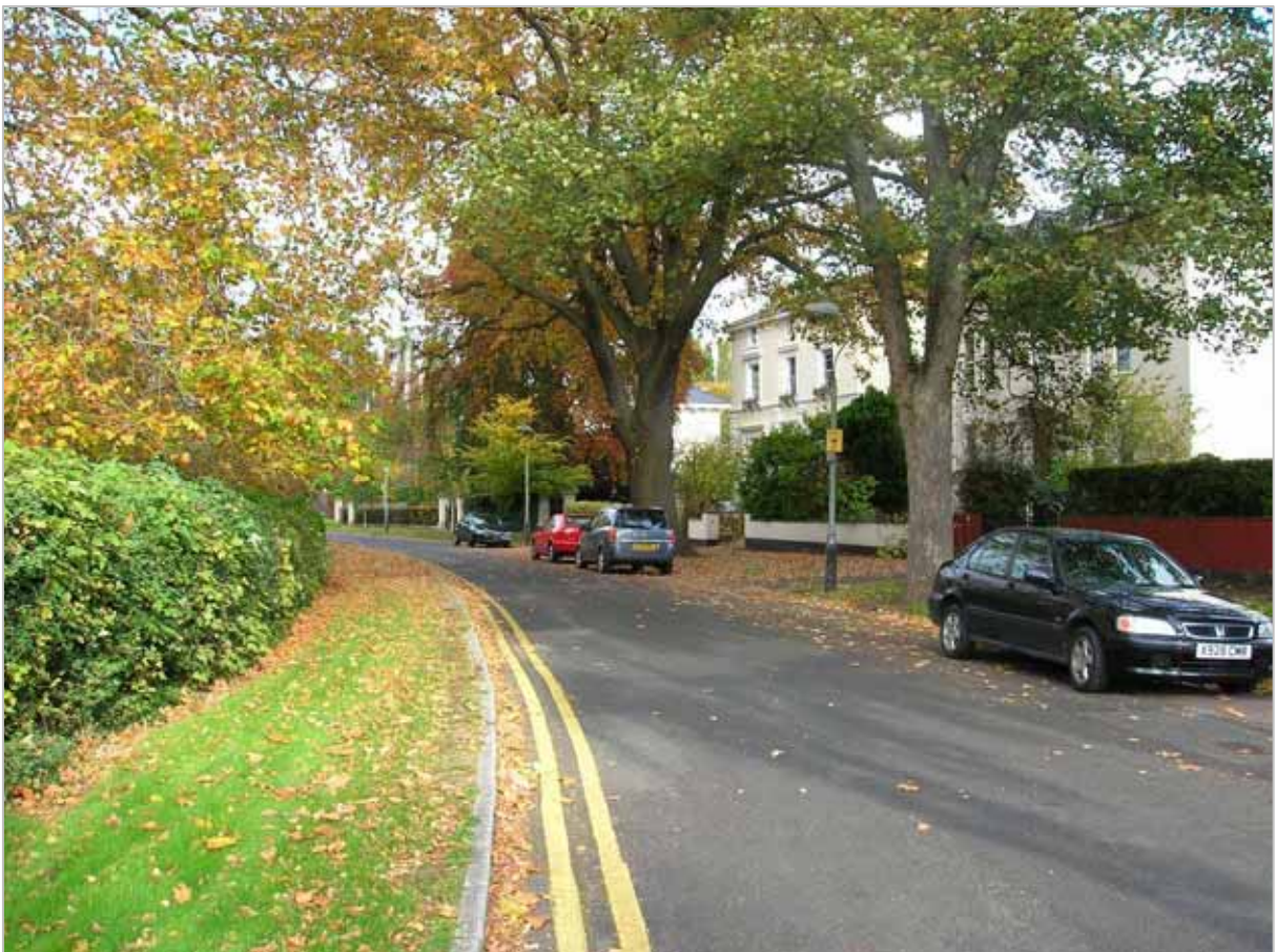
2007 Pittville Crescent looking north with grassed verge alongside the road