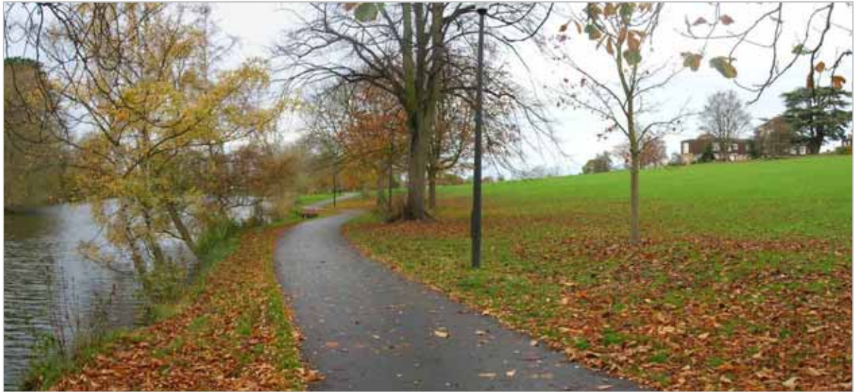
2007 North shore of Lower Lake looking west

The footpath which circles the Lower Lake provides a good vantage point for short and medium distance views both across the lake and to the wider parkland beyond. As the grassland extends north west over Marle Hill, some excellent views can be found and it is possible to pick out remnants of the historic landscape within the park. Interpretation at such points would enhance the experience for the visitors to Pittville Park.