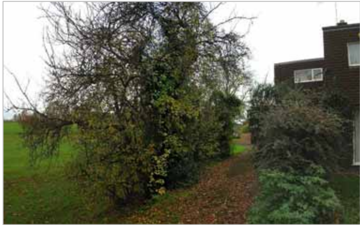
2007 Overgrown shrubs

The boundary to the north is defined by a hard, bitmac surfaced narrow path which stands upon the raised platform once occupied by Marle Hill House. Today the platform is occupied by the residential houses of Albermarle Gate. This footpath is not part of Pittville Park but is used by visitors to the park. This northern boundary is lined in places by mature and semi-mature trees and large shrubs which restrict visual access both into the park and to the residential houses.