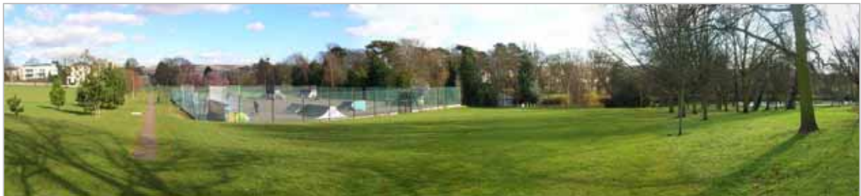
2007 Looking south east towards skateboard park