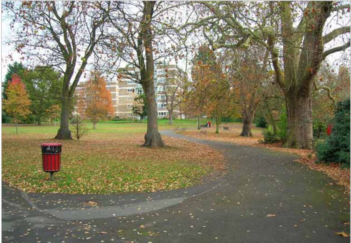
2007 Pump Room Lawns (above and below)

There are also short distance views across the Pump Room lawns, through the mature and semi mature trees planted here. The footpaths enhance sight lines and provide aid both legibility and orientation within the park. Seasonal change within the park further enhances these views for park visitors.