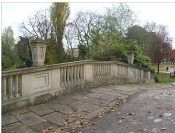
2007 Bridge to the west of the Upper Lake