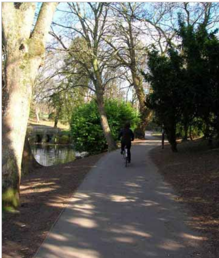
2007 Footpath looking east towards the A435 Evesham Road

The footpath has a hard bitmac surface and is in excellent condition. The width is sufficient to allow pedestrian users to pass with comfort although is slightly narrow to allow for pedestrians and cyclists to pass with ease.