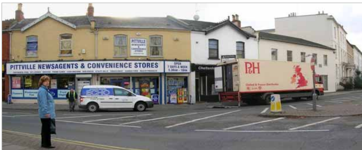
2007 Shops clustered around the junction of Prestbury Road, Clarence Road and Winchcombe Street.