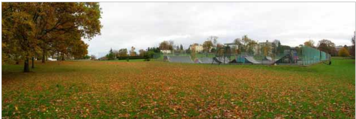
2007 Looking north east towards skateboard park