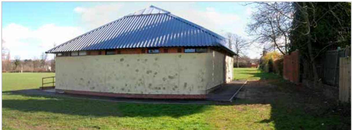
2007 Agg Gardner Pavilion

See schedule of condition attached at Appendix 4