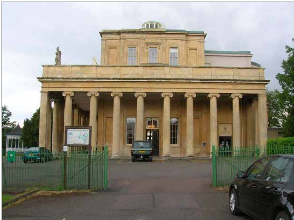
2007 Eastern Approach to the Pump Rooms

Disabled parking spaces have been provided adjacent to this east colonnade, which detract from the vista between the East Approach Road and the Pump Rooms.