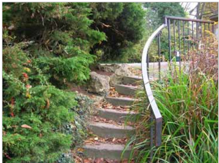
2007 Steps to east bridge

To the eastern side of the north lakeside there is a well developed and mature rockery which is believed to date from 1890, with tree species including Cedrus, Thuja and Prunus surrounded by shrubs and perennials. Iron railings lead up a small flight of curved steps onto the eastern bridge.