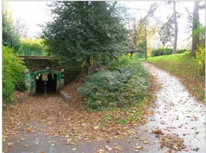
2007 Subway entrance beneath the A435 Evesham Road

Today the subway is still a very useful means of getting from one side of the park to the other, however a steep slope to the east and poorly lit tunnel make the subway unappealing. To cross the road instead also involves a steep climb up to the road level via a narrow footpath.