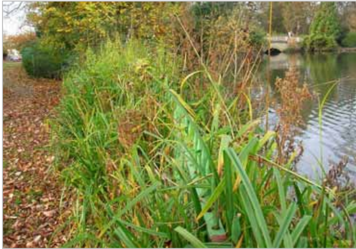
2007 Native grasses

To the south, the lakeside is contained by a medium height, green iron fence. Towards the eastern bridge there is a large area of planting which extends out from the lake side and contains an untidy collection of mature trees, shrubs and perennials. Towards the western bridge, again on the south of the lake, native grasses have taken a strong foothold between the fence and the lakeside and have now become so overgrown that they prevent a good view of the lake, bridges and the Pump Room to the north.