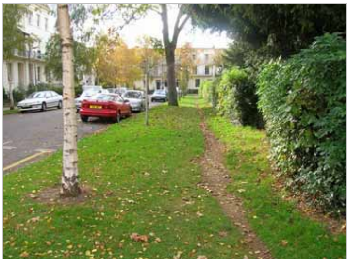
2007 Clarence Square East

Beyond the boundary hedge a wide grass verge surrounds the square. This verge is filled with mature trees which contribute to the character and setting of the square. There is a narrow dirt footpath worn into the grass which runs along Clarence Square East between the northern gateways.