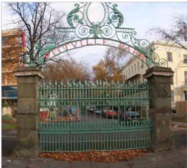
2007 Pittville gates