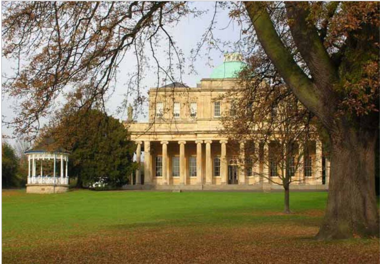
2007 Pittville Pump Room and Bandstand

This character area is located to the north of Pittville Park and lies adjacent to the Pump Rooms. The Pittville Lawns slope gently south towards the Upper Lake. The character of this area is one of a mature parkland setting. The lawns to the south, along with spaces to the east, west and north are the setting for the Grade I listed Pump Rooms.