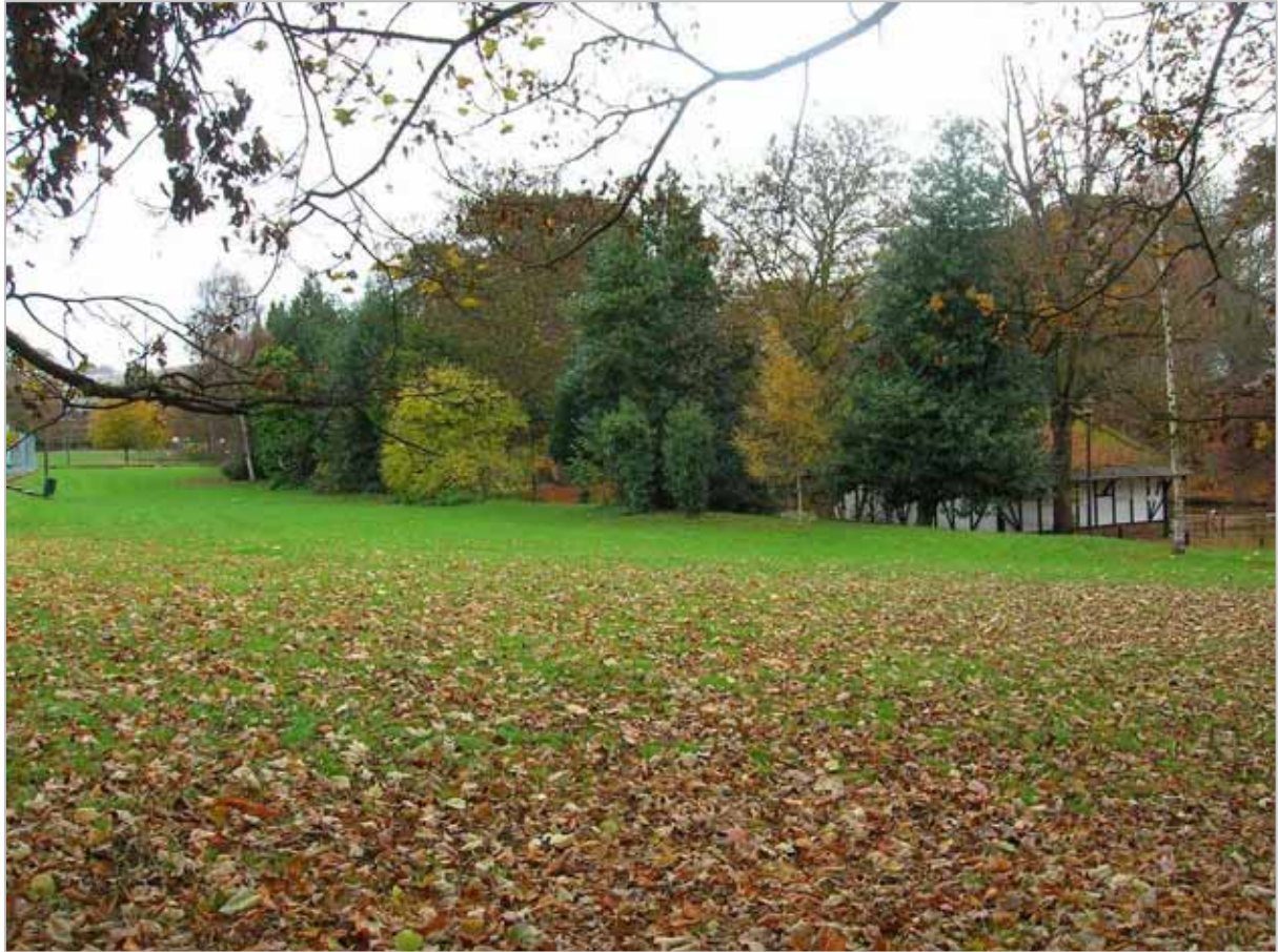
2007 Southern boundary, Lower Lake character area mature shrubs and trees

To the south the boundary of the Marle Hill East sub area is defined by the Lower Lake, especially the Lower Lake East sub area's evergreen and deciduous mature trees and shrub belt which runs east-west to the north of the lake. This boundary makes a significant contribution to the character and setting of Pittville Park.