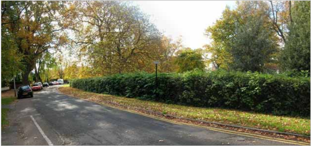
2007 Boundary hedge

This hedge defines the crescent but restricts both visual and physical access into and out of the crescent. The hedge is in good condition although its height, whilst acting as a successful physical barrier, could be seen as a threat to use, especially in the evening.