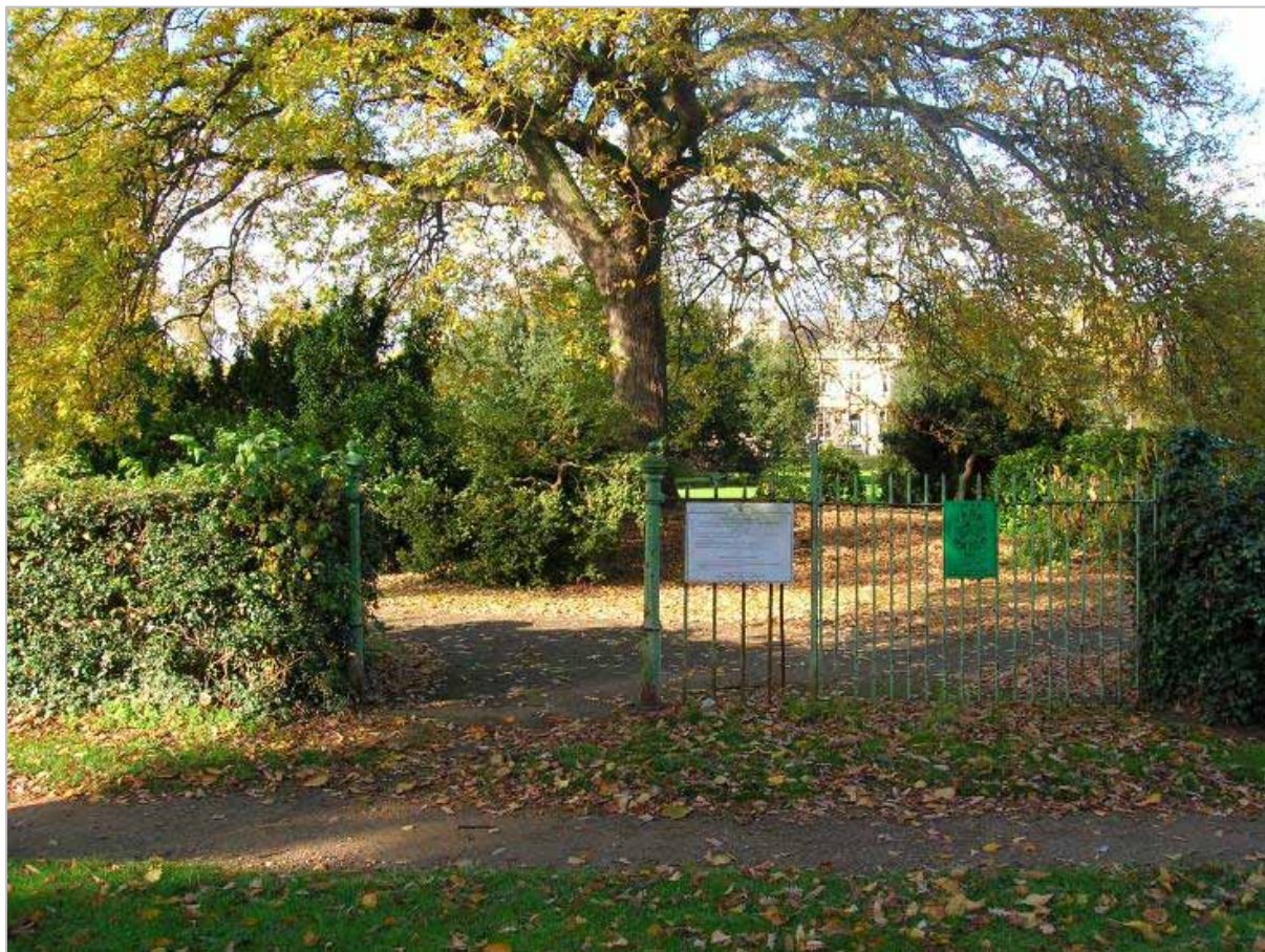
2007 Wellington Square gateway

Access into Wellington Square is via gateways to the north, south, east and west sides. The gateways are defined by open sections of the hedge, by iron railings with gate missing and iron gates. The ironwork is in decline and is in need of renovation or replacement. The lack of unity in the gateway treatment also adds to the appearance of neglect.