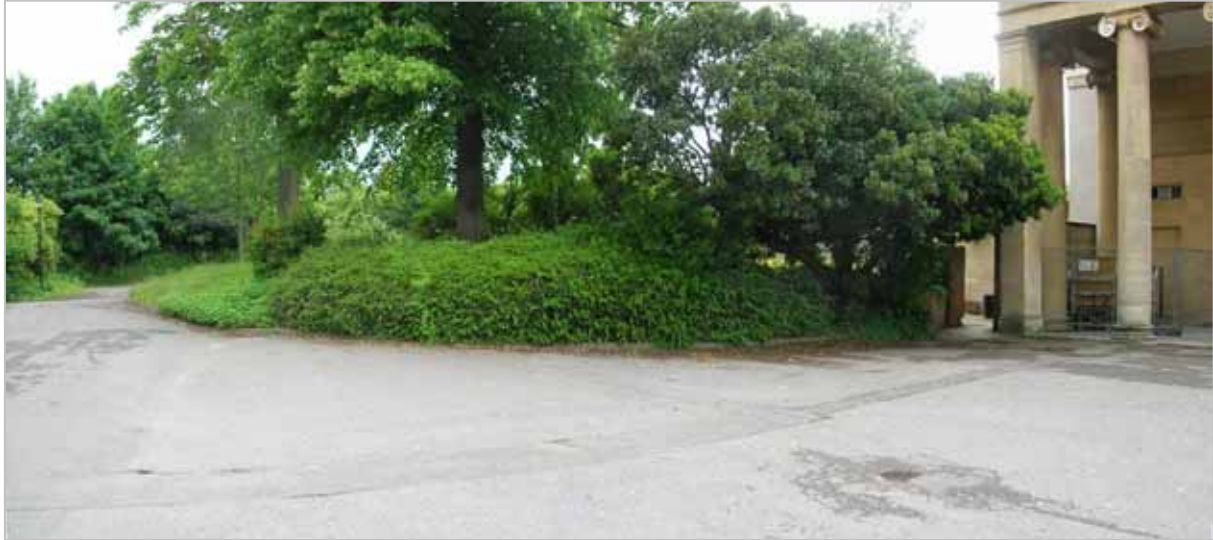
2007 Planting adjacent to the Pump Rooms

To the north of the western gateway, the bitmac surface continues on into the car park, running between a pinch point created by mature planting to either side. A large mature Horse Chestnut ( Aesculus hippocastanum ), Lime ( Tilia x europaea ) and Strawberry Tree ( Arbutus unedo ) provide focal points within the planting adjacent to the Pump Rooms. Ground cover is provided by a combination of woody shrubs, which have been clipped to form a dense mat.