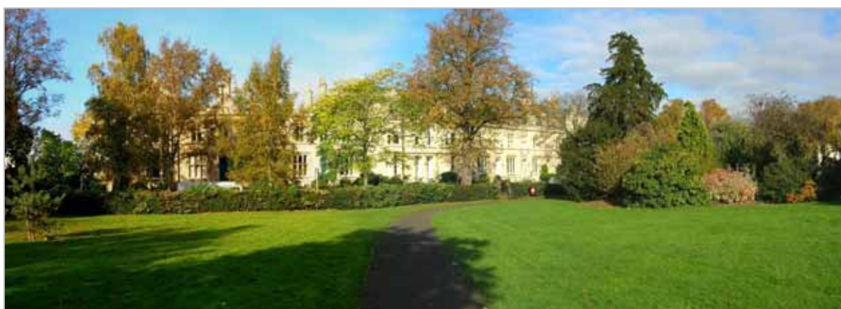
2007 Wellington Square