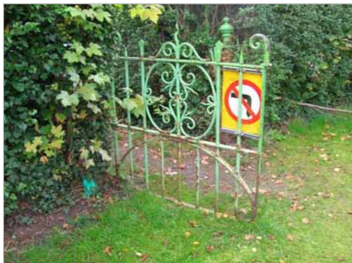
2007 Gateway signage

A sign attached to the gate has been constructed from a previous road sign and gives a conflicting message when viewed from inside the crescent. (See Section 5.5)