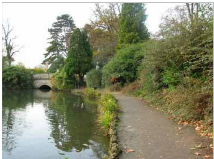
2007 Rockery and western bridge

There are a number of iron benches provided for park users around the lake area.