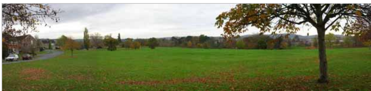
2007 Looking east from Tommy Taylor's Lane

To the north of the park in the Marle Hill character area, the extensive open parkland enables excellent short, medium and long distance views.