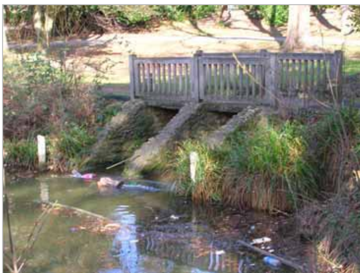
2007 Rubbish in the Lower Lake (above and below)

On site visits there was a large amount of rubbish discarded into this section of the lake and on subsequent visits the rubbish had not been cleared.