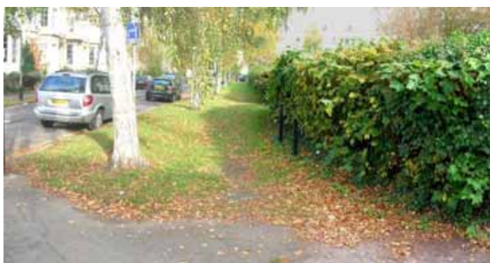
2007 Clarence Square West