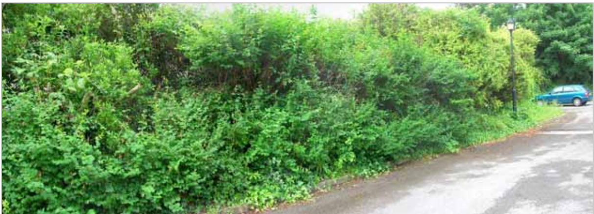
2007 Boundary to the west

The boundary to the west, north and east of the car park comprises densely clipped ornamental woody trees and shrubs. Maintenance here has been to maximise parking spaces at the expense of allowing the trees and shrubs to develop into their natural form. This dense boundary is impenetrable and identification of individual species and form is difficult.