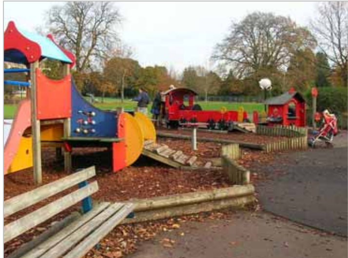
2007 Newer play equipment aimed at younger children's imaginary play

There are some newer items of equipment for younger children which provide potential for imaginary play. The planting within this area adds to the play value, with areas for hiding and exploration accessible to young children. There is good seating provision within the play area for supervising adults.