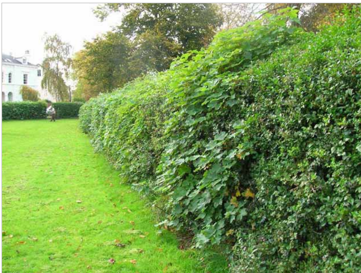
2007 Boundary hedge

The landscape setting for Pittville Crescent south is more open than the northern crescent, with fewer mature trees providing a canopy layer above the space. Again, the space is defined by a 1.5m dense clipped hedge which comprises several species and a well developed understorey (see Pittville Crescent north).