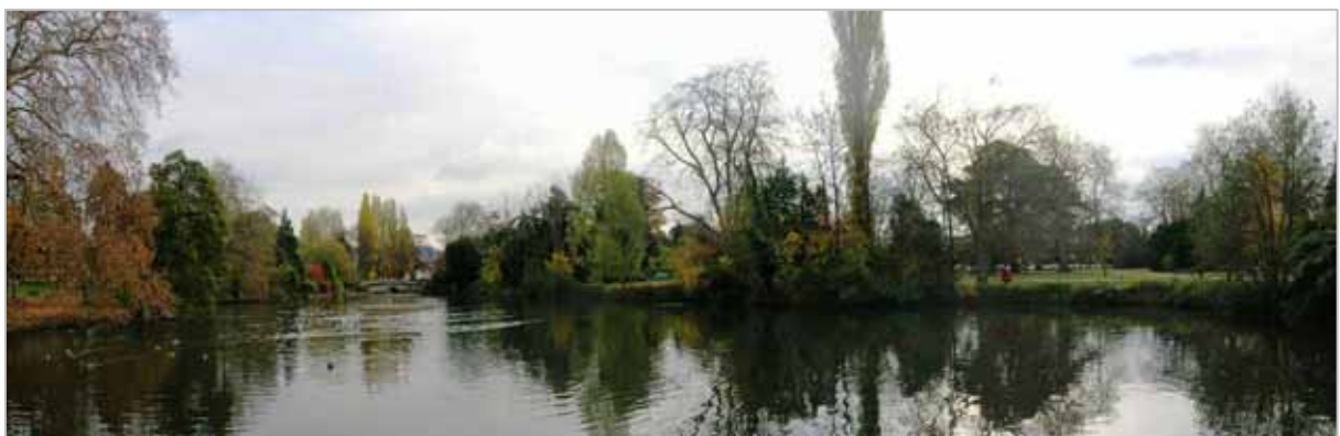
2007 Upper Lake panorama