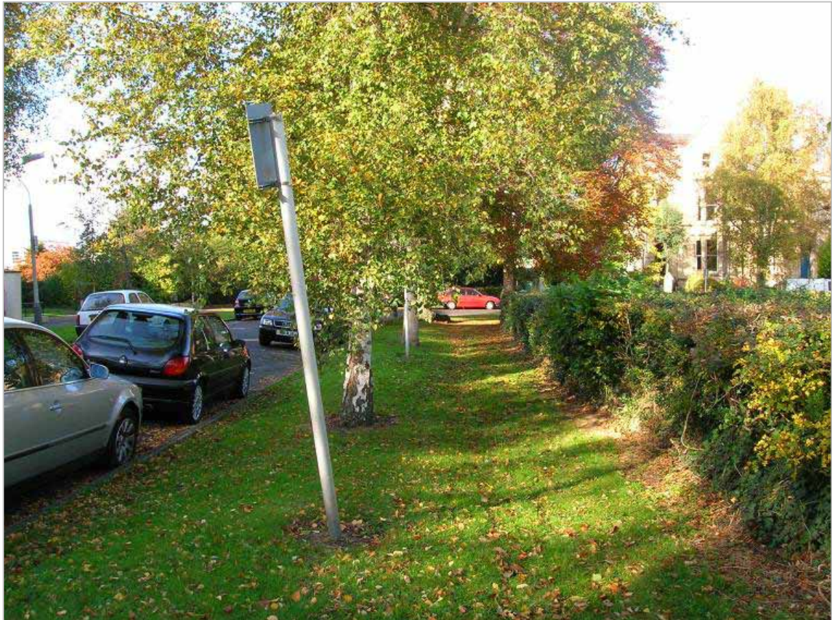
2007 Wellington Square grass verge

There is however, in places, no footpath along the verge, which now displays clear desire lines indicating the amount of foot traffic. This lack of footpath also continues around the gateway to the west of the square, where foot traffic has worn away the grass.