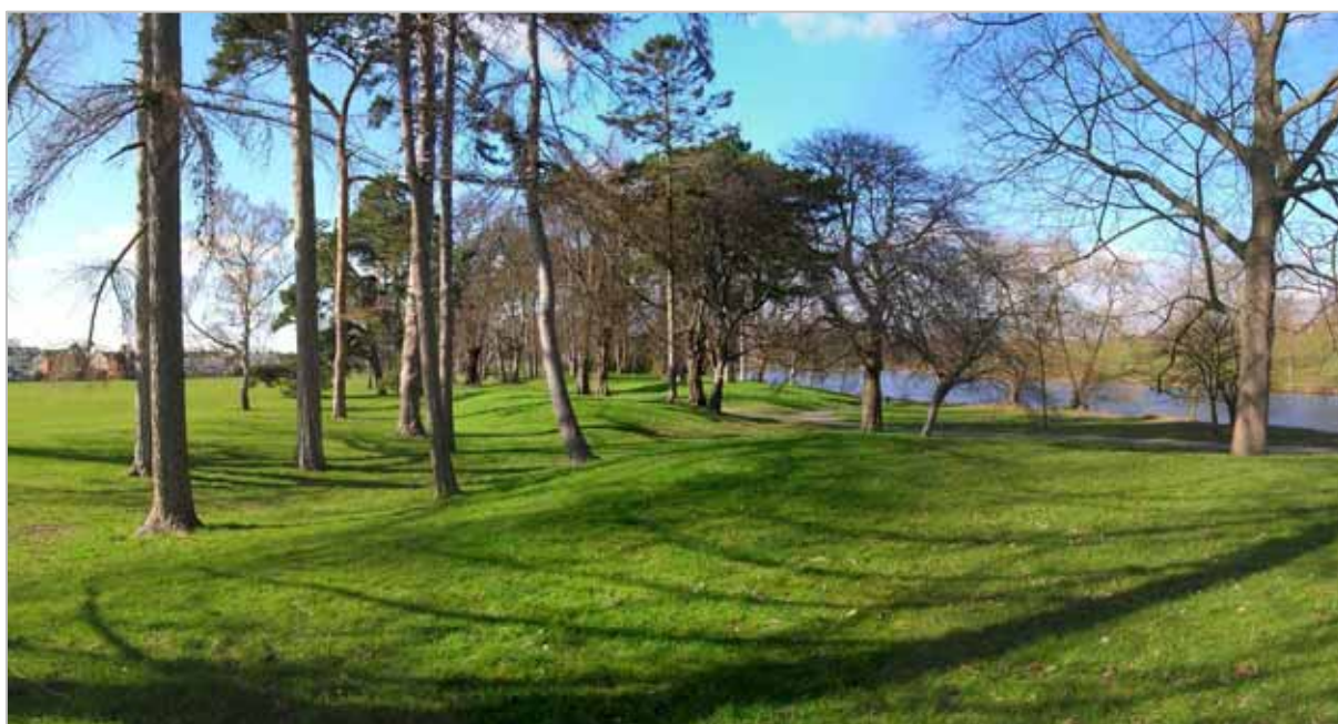
2007 Tree covered bunds

The character of the southern lakeside is more enclosed with a series of low bunds covered by mature trees and especially some old Cedars which give the character and setting to this area and are visible from a great distance as landmark trees.