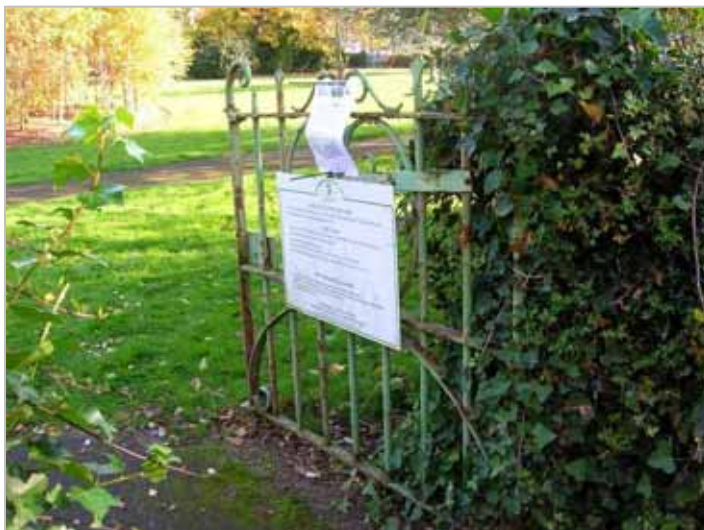
2007 Gate (above and below)