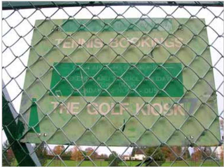
2007 Sign in tennis courts

Bookings can be made at the Boat House, when open and not as indicated at the Golf Kiosk as this is no longer in existence.