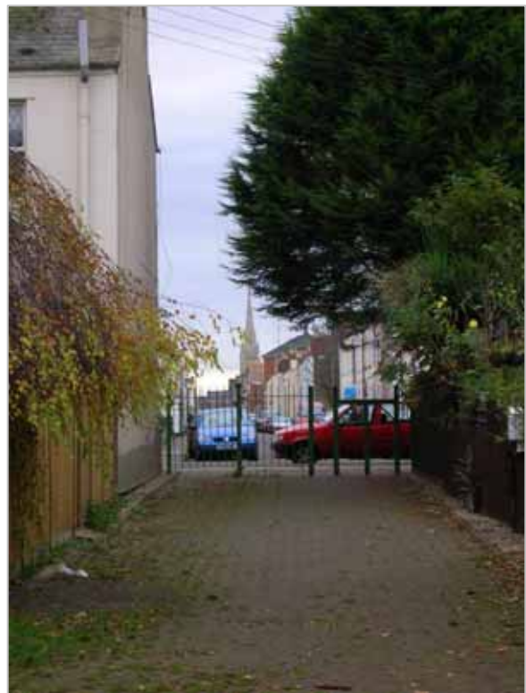
2007 Gateway adjacent to Agg Gardner's Lodge

There are four gateways into the Agg Gardner area, all leading through the southern boundary off Marle Hill Road. Three of the gateways are narrow and were originally marked by Lodges for the old estate. Today the gateways not only allow open access to this open green space but also allow excellent views of the landmark church spires in Cheltenham.