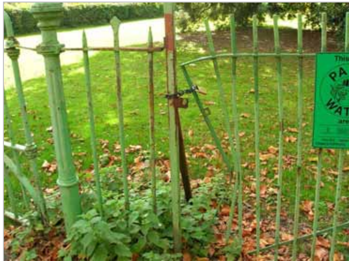
2007 Pittville Crescent south gateway (above and below)

The gateway into Pittville Crescent south is via a gateway through ironwork adjacent to Central Cross Drive. The ironwork is in the same style as Pittville Park and is showing the same deterioration and sense of neglect.