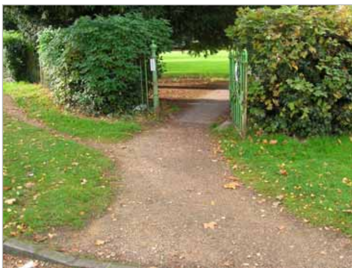
2007 North east gateway

Clarence Square differs from Wellington Square with the gateways positioned to the four corners, north, south, east and west rather than being located along the sides. The gateways are defined with ironwork in varying states of deterioration.