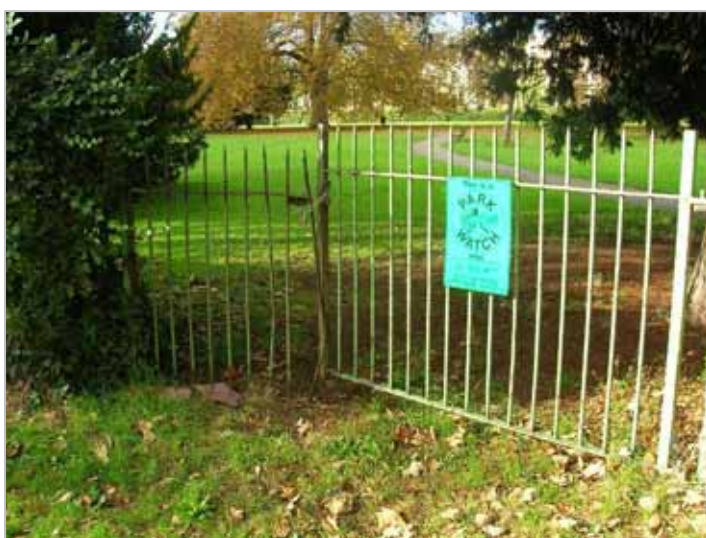
2007 Clarence Square East railings