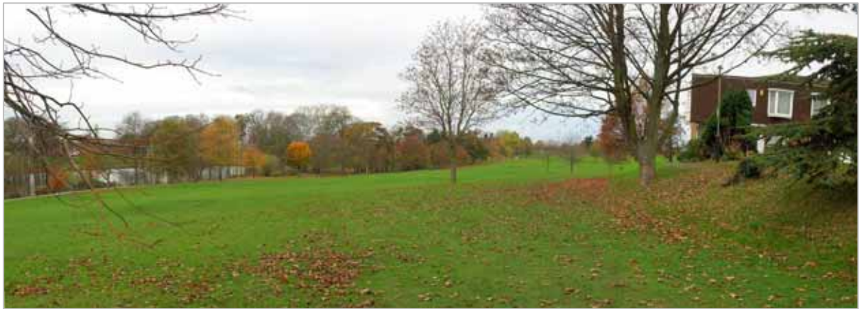
2007 Marle Hill Centre looking west

Marle Hill centre occupies the central position upon Marle Hill, with the Lower Lake to the south and the houses of Albermarle Gate to the north. To the east the boundary of this sub area is defined by the avenue of mature trees which locate the historic carriage drive which ran from Marle Hill House, across the Lower Lake towards Cheltenham via the Lodge House which stood on what was to become the Agg Gardner recreation ground. To the west the sub area abuts the Marle Hill west sub area.