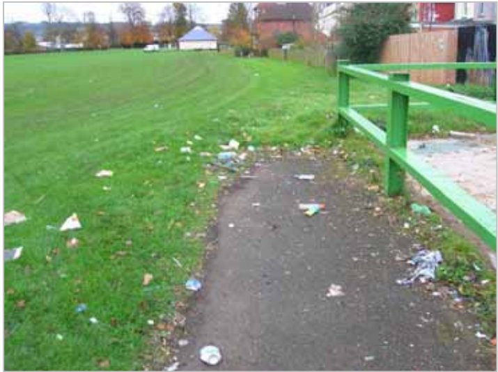
2007 The St Paul's gateway

There is an amount of rubbish which accumulates behind the residential houses and particularly around the St Paul's gateway, despite the provision of rubbish bins, which has a detrimental effect on the visual appearance of the park.