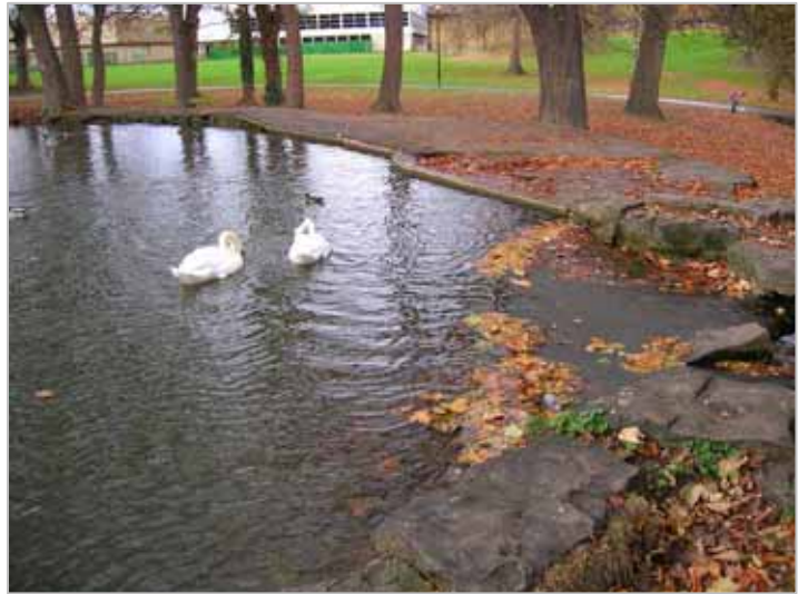
2007 Lower Lake Weir

Today this is an interesting feature which provides a contrast to the still water within the Lower Lake.