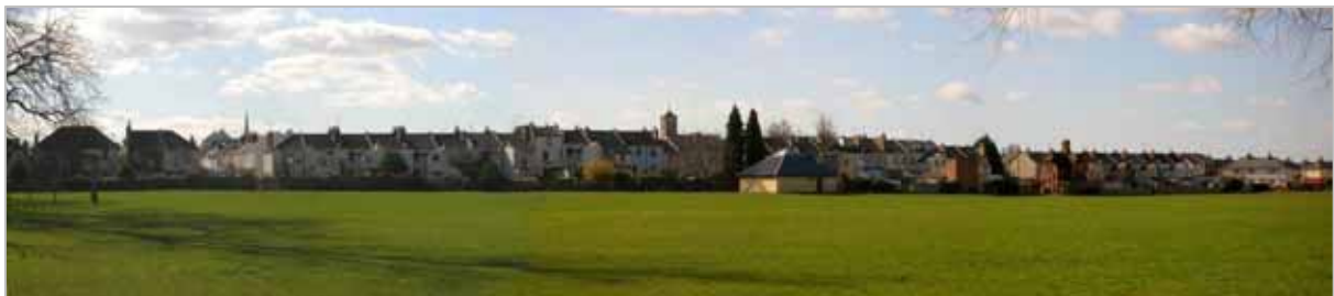
2007 The spires of St Mary's Church, St Paul's Church and Francis Close Hall (from left to right)

Pittville Gates stand to the south of the park and were designed as the grand entrance to the estate. Views from these gates today are limited to views along the surrounding roads.