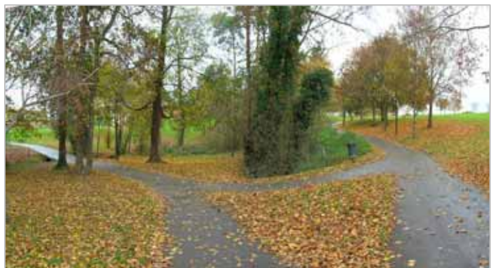
2007 Lower Lake paths

To the north the ground rises steeply up Marle Hill and to the south is the Agg Gardener recreation ground. Further to the west is the Leisure @ Cheltenham sports centre and to the east the Lower Lake.