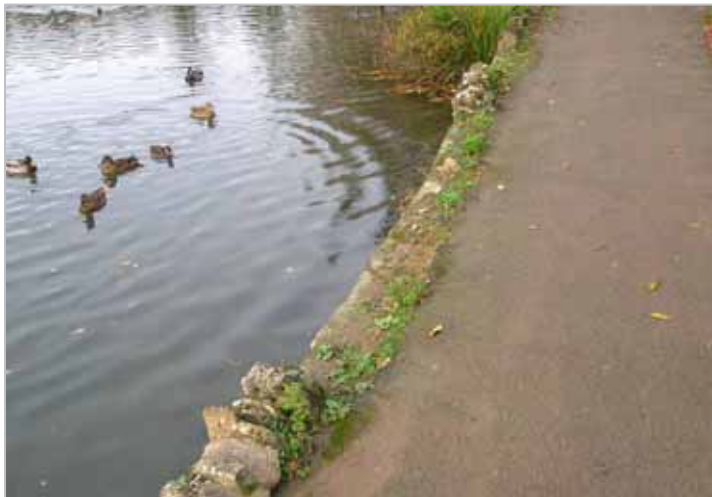
2007 Edging deterioration

To the north the lakeside is open and the hard surfaced path runs parallel with the lakeside. An informal stone edging divides the path from the water and, in places, this has become worn and dislodged. Replacement pieces have been incorporated from a variety of sources which do not maintain visual continuity.