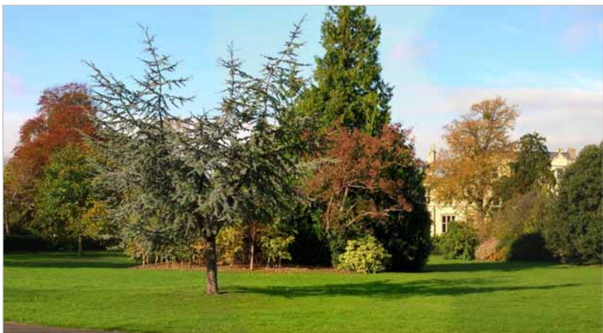
2007 Wellington Square