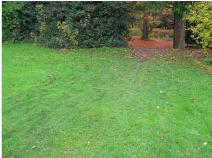
2007 Desire lines in the grass beyond the tennis courts and skateboard park

This sub area is popular with park users and desire lines in the grass reveal the extent of use.