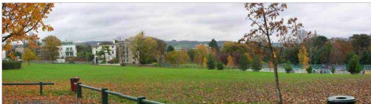
2007 View south (above) and golf green (below)

From the car park there is an excellent view south of this sub area and the distant Cotswold escarpment.