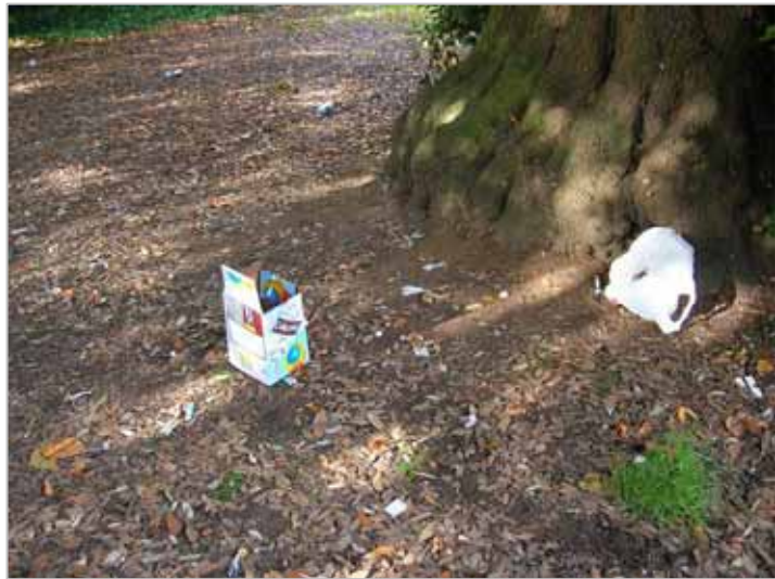
2007 Litter in Pittville Crescent south (above and below)

Within the crescent, the grassed area contains mature and semi mature tree species, which are largely located to the centre of the space. The high nature of the boundary hedge creates an enclosed and secluded space which is clearly being used in inappropriate ways, presumably by local young people. There was, on the occasions of site visits, a large amount of rubbish, including empty alcohol bottles and cans, littering the grass surrounding the base of the mature Holm Oak ( Quercus ilex )