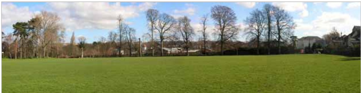
2007 Distant views of the Cotswold escarpment from the Agg Gardner recreation ground (above) and from Marle Hill (below)

In the west park, the open nature of the Agg Gardner recreation ground enables long distance views east towards the Cotswold escarpment. This view is also presented from Marle Hill, looking across the park, Evesham Road and the Pump Room lawns.