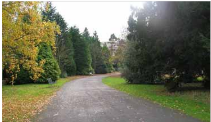
2007 Eastern path

To the east of the lawns the tree planting is predominantly of coniferous species such as Red Cedar ( Thuja plicata ) and Yew ( Taxus baccata )