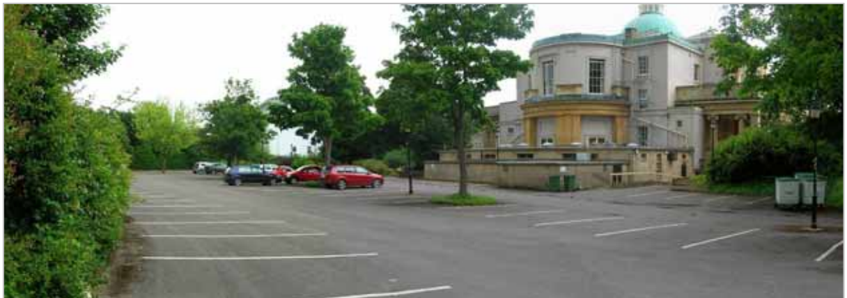
2007 Car park looking south east