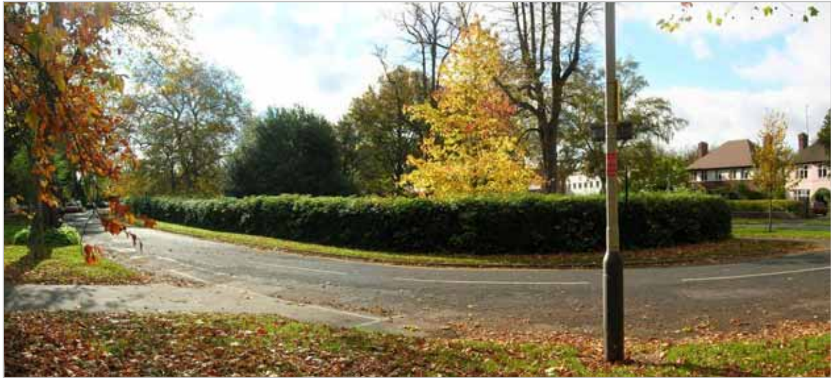
2007 Pittville Crescent North, looking south west.

Pittville Crescent north is defined by Albert Road to the west and Pittville Crescent to the east. Central cross Drive extends east beyond Albert Road and dissects the north and south crescent, running to the south of the northern crescent.