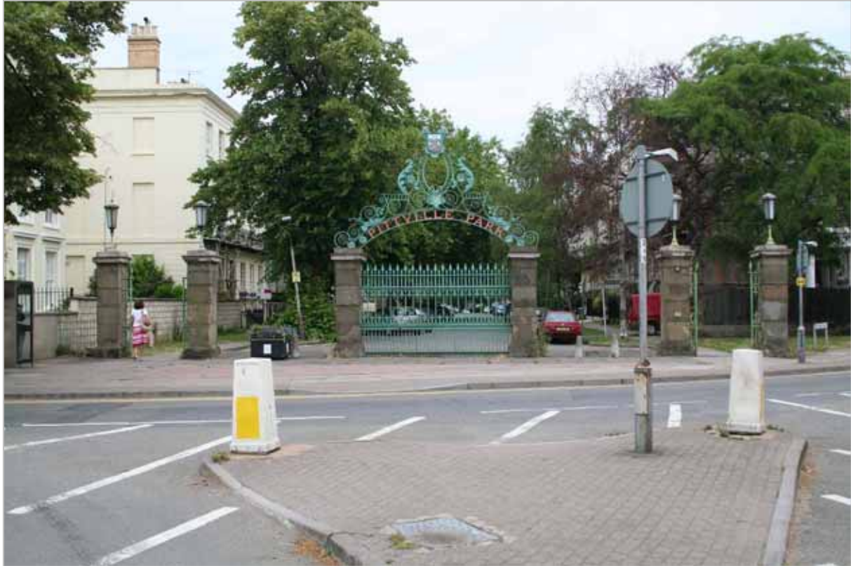
2007 Pittville Gates from Winchcombe Street

Pittville Lawn to the north of the gates is not open to vehicles from the south. The gates stand back from the road beyond a wide paved area adjacent to the highway footpath. The paving looks faded and its style not compatible with such an important historic feature. The pavement dips adjacent to the gates to allow access across the road to a traffic island. There are numerous traffic signs and bollards which clutter the street scene at this point and detract from the magnificent gates.