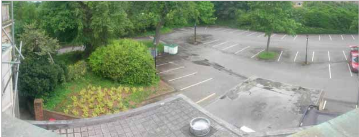
2007 New planting

To the south the car park is defined by the rear buildings extensions to the Pump Rooms. Planted beds extend a short distance to the east and west of the building and are filled with a collection of mature woody trees and shrubs. Ground cover planting is provided by herbaceous perennials and grass. A collection of new shrubs are in the process of being established here.