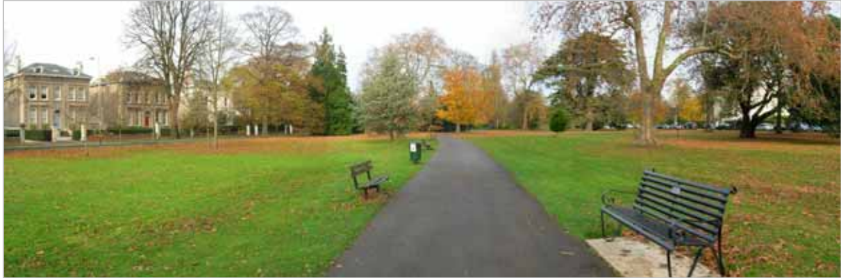
2007 north Lawn, central path

There is a limited range of seating opportunities along the paths of the north lawns, all being provided by iron benches. There is no seating off the paths, under trees for instance. Rubbish bins have been provided at intervals along the central path. These bins are unsightly and tend to spoil any views or vistas within the setting. However, these bins are very much a necessity due to the large number of dog walkers and park users.