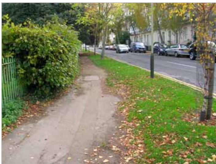
2007 Clarence Square South

There is no footpath beyond the northern boundary however, well worn desire lines in the grass are an indication of the amount of foot traffic this strip of grass receives.