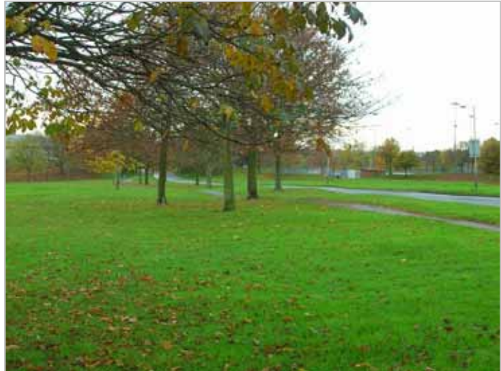
2007 Footpath alongside Tommy Taylor's Lane

There are no footpaths which run through this area, except those which run along the boundary with other areas. There is a narrow, hard surfaced footpath adjacent to Tommy Taylor's Lane which runs north-south alongside the road.