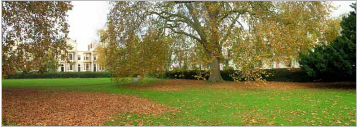
2007 Clarence Square looking west