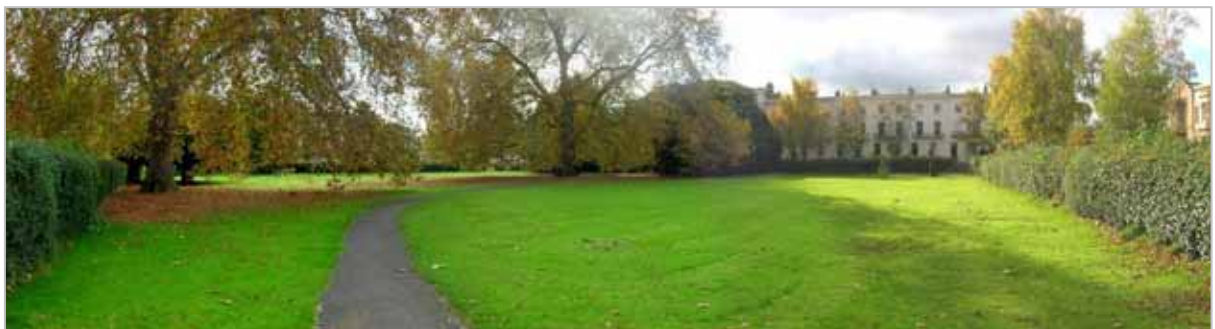
2007 Clarence Square looking south east