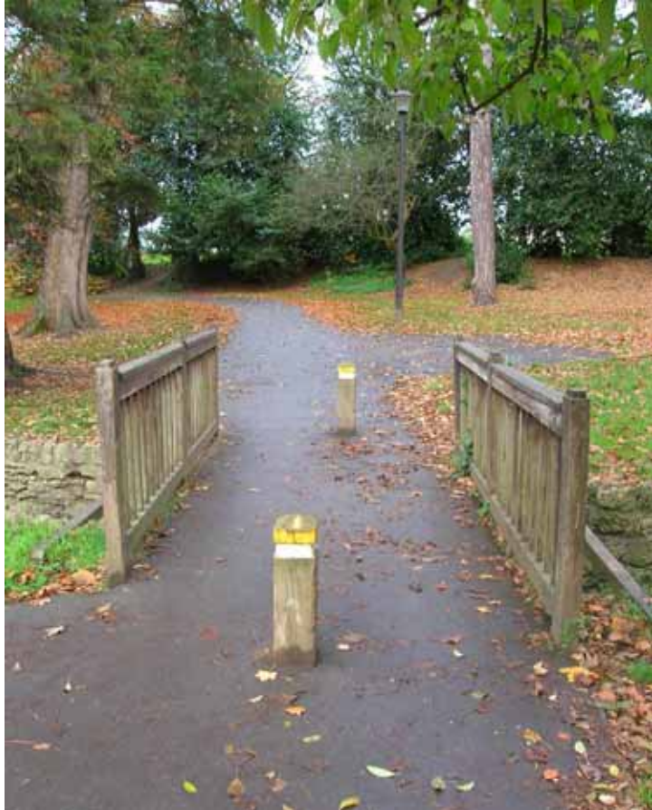
2007 Wooden bridge over Wyman's Brook

The wooden bridge is wide enough to allow pedestrians to pass each other with comfort although the footpath is not wide enough for a cyclist to pass a pedestrian with ease. Two small wooden bollards have been installed to block vehicular access across the bridge.