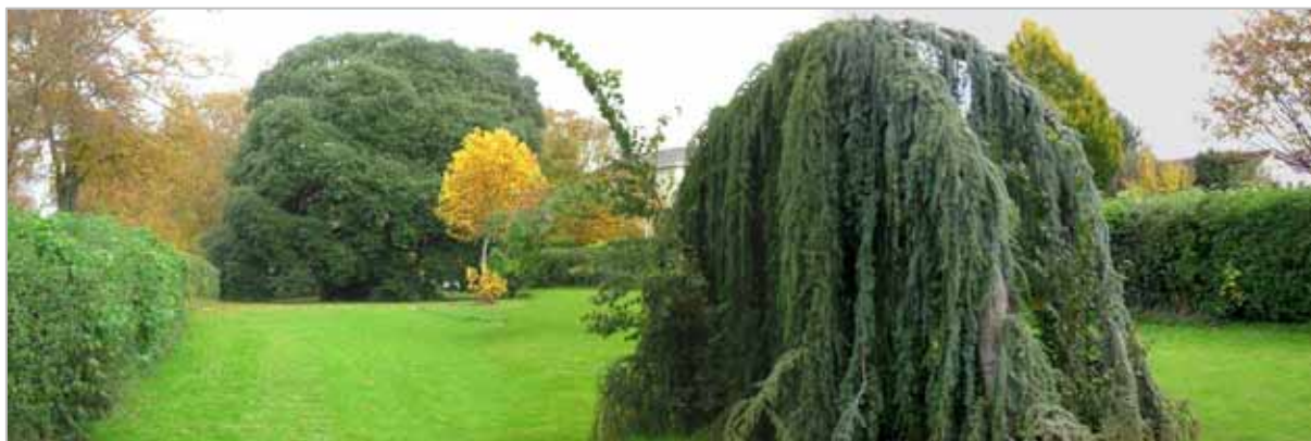
2007 Pittville Crescent south, looking north

Pittville Crescent south is defined by Albert Road to the west and Pittville Crescent to the east. Central cross Drive extends east beyond Albert Road and dissects the north and south crescent, running to the north of the south crescent.