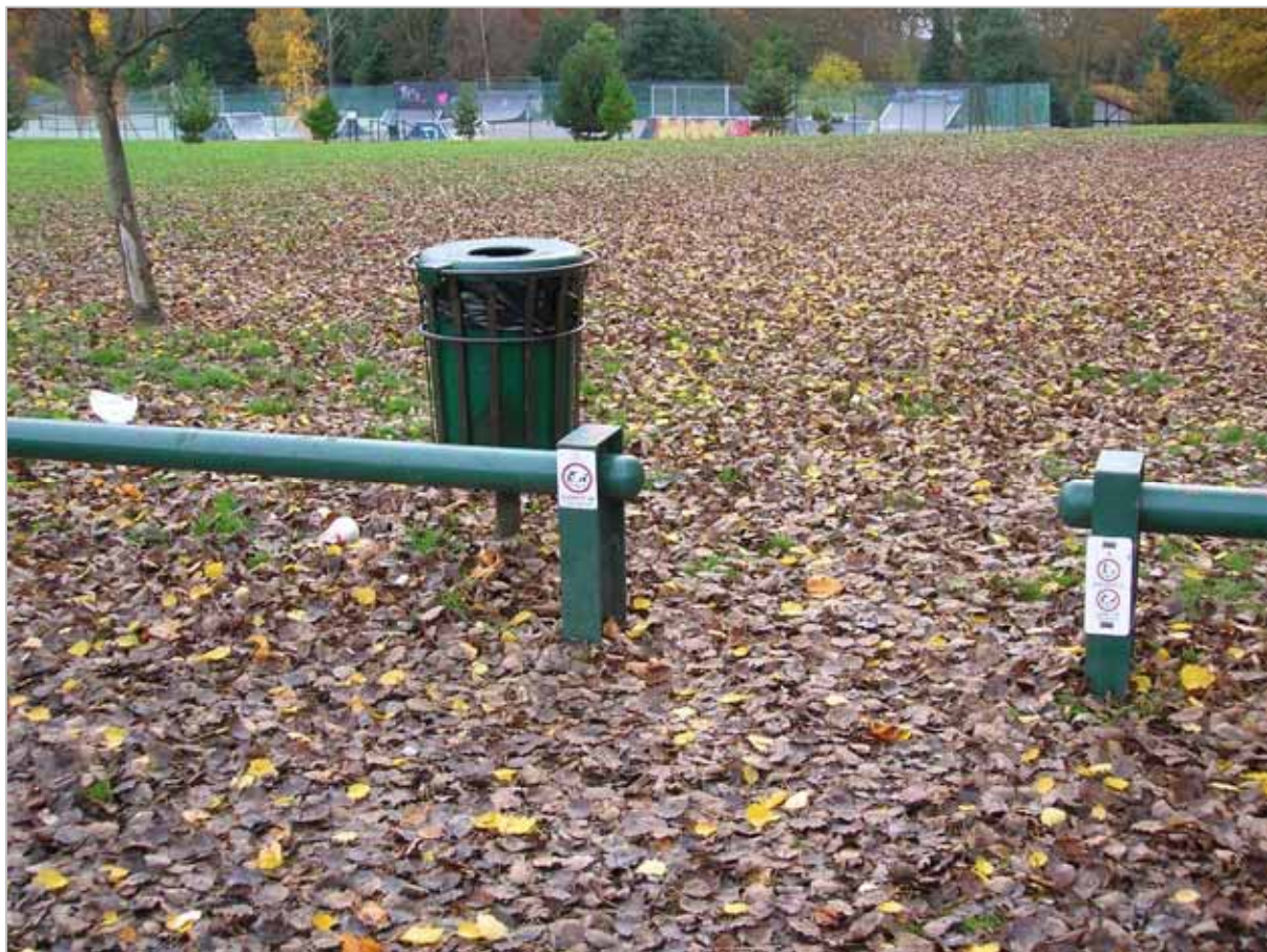
2007 Rubbish bin and low fencing

From the car park there is an excellent view south of this sub area and the distant Cotswold escarpment.