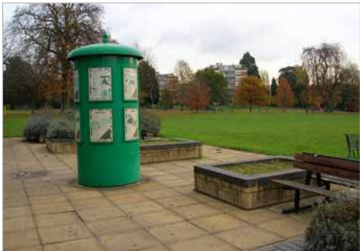
2007 Centenary Gardens

Adjacent to the aviaries is a small garden, Centenary Gardens, built in 2000 to celebrate the 100 th birthday of Queen Elizabeth the Queen Mother. The garden is built in a buff coloured artificial stone material with a series of raised planting beds with benches between. The planting here is beginning to become overgrown and neglected with a number of the planting beds with bare soil. Interpretation panels are located on a cylindrical display board. The information is faded and in need of replacement.