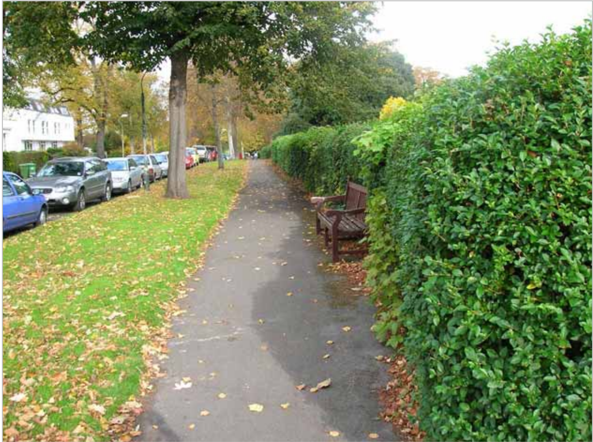
2007 Looking north along Albert Road, with boundary hedge to the east

Beyond the boundary hedge the crescent is defined by a grassed verge which runs around the perimeter of the space.