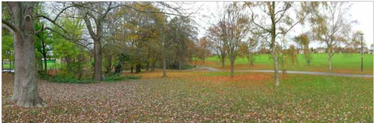
2007 Lower Lake looking west

The western lakeside area extends between the north and south lakeside area close to the Leisure @ Cheltenham sports centre. From this point there are views over the lake towards the island and towards both north and south lakeside.