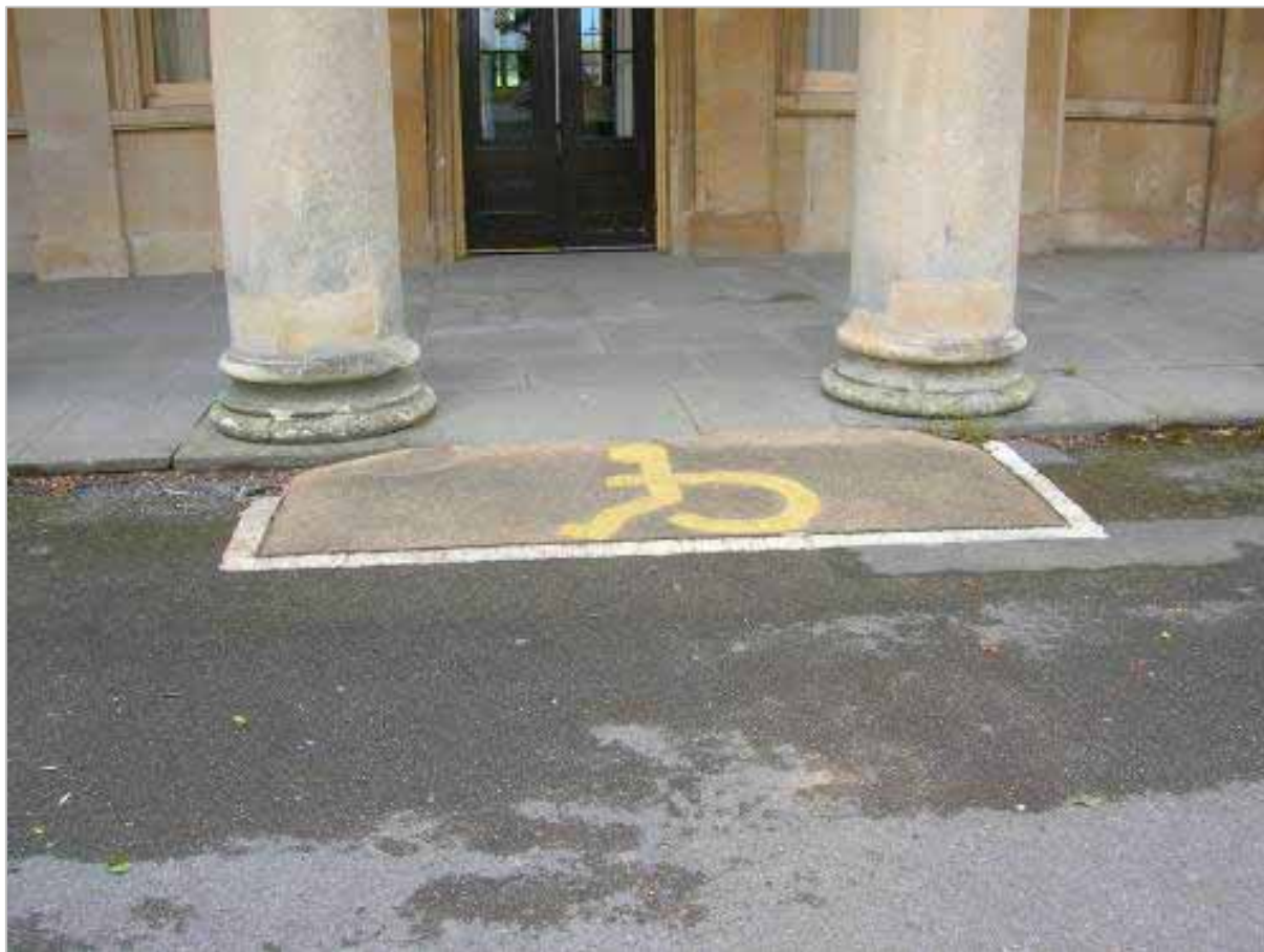
2007 Access ramp

The bitmac surface adjoins the natural paving slabs beneath the east colonnade of the Pump Rooms. This bitmac surface treatment is visually harsh adjacent to the softer natural paving and stonework of the Pump Rooms. A ramp has been installed to enable disabled access into the Pump Rooms.