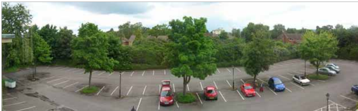
2007 Car park from the Pump Room

The car park occupies the land to the north of the Pump Rooms and has sufficient space to park 150 cars. This car park is predominantly used by visitors to the Pump Room's events and festivals, along with providing additional parking for the nearby racecourse throughout race meetings.