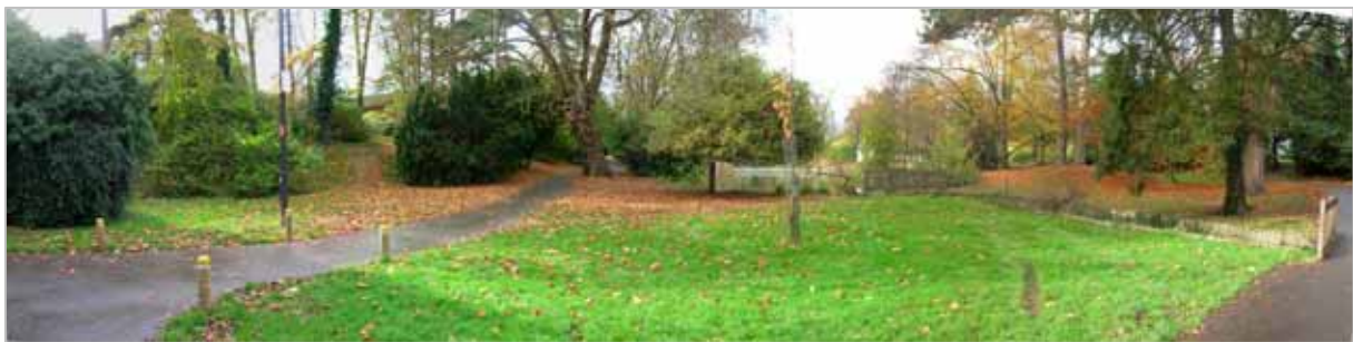
2007 East Lakeside looking west