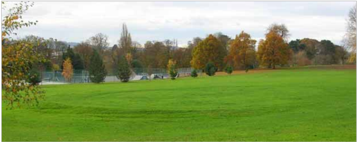
2007 Looking south west from Evesham Road