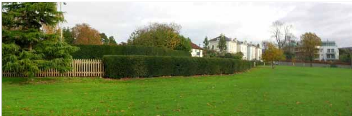
2007 North eastern boundary

To the north east of the area the boundary is defined by a wooden picket style fence and an evergreen Yew hedge. Sections of the hedge are missing and have been replaced with the wooden fence which, although giving an inharmonious and uncharacteristic feel to the boundary, is well maintained.