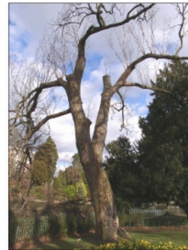
Photo 4: Mature split Willow tree on south shore of Upper Lake (Target Note 7)