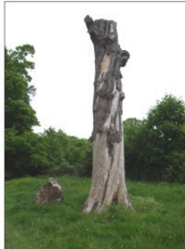
Photo 7: Mature tree stump on the eastern edge of the Agg Gardner Room Lawns (Target Note 10)