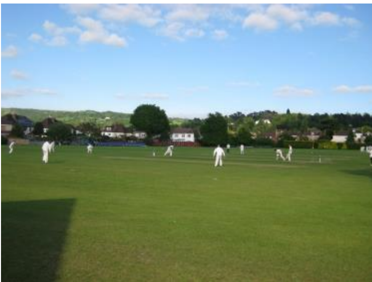
The 2014 Community & Cricket Club Fireworks