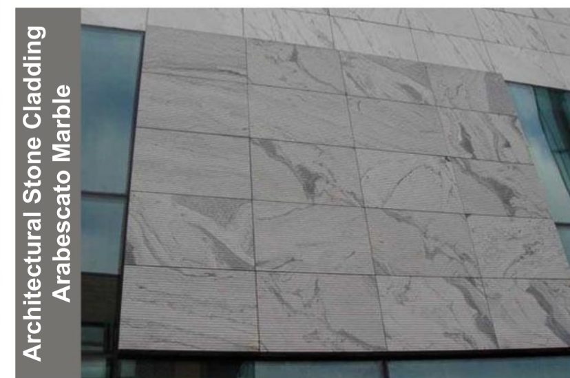
Architectural Stone Cladding Arabescato Marble

© This drawing/disk and the works depicted are the copyright of Design Development Partnership Ltd and may not be reproduced or amended except by written permission. No liability will be accepted for amendments made by other persons.