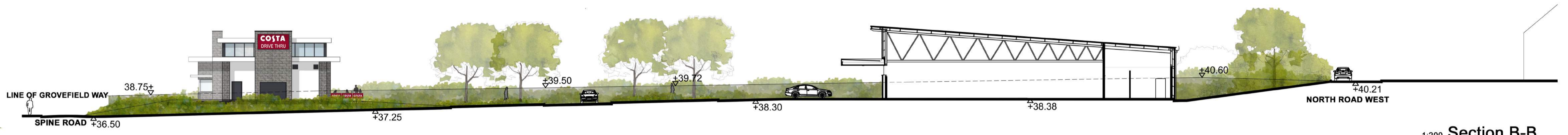
1:200 Section B-B