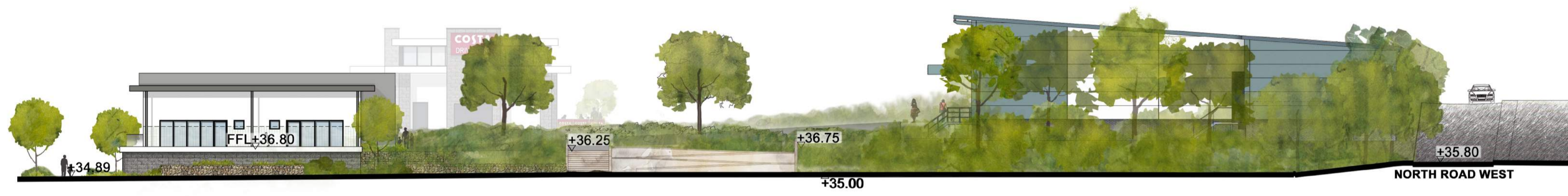
1:200 Section C-C (2 / 2)