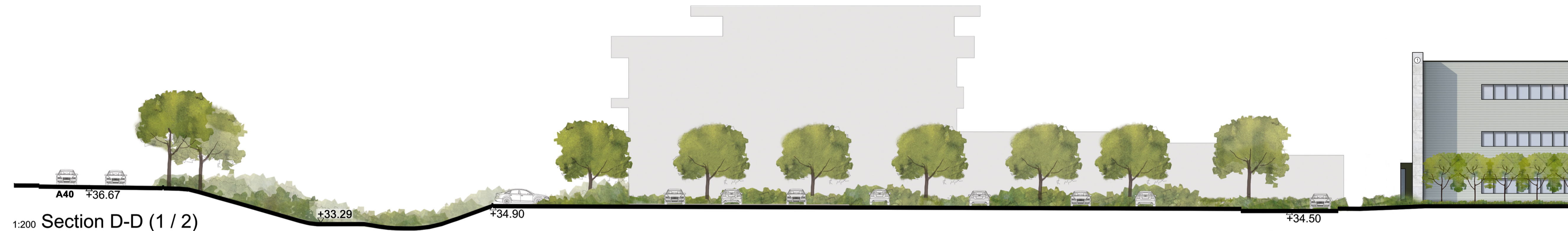
1:200 Section D-D (1 / 2)