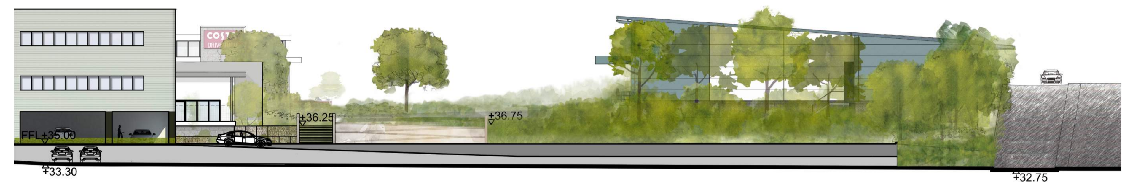
1:200 Section H-H (2 / 2)