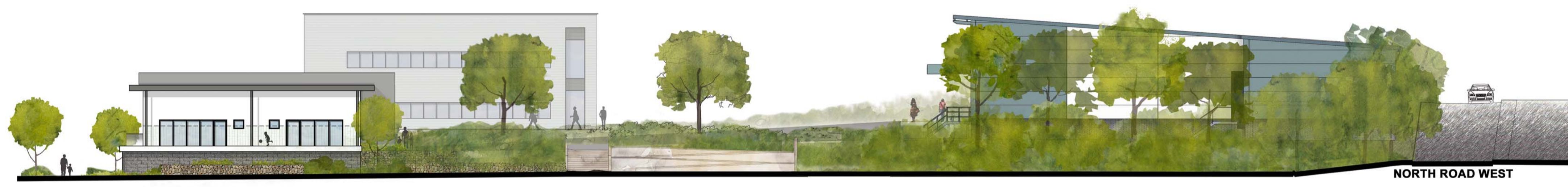
1:200 Section C-C (2 / 2)