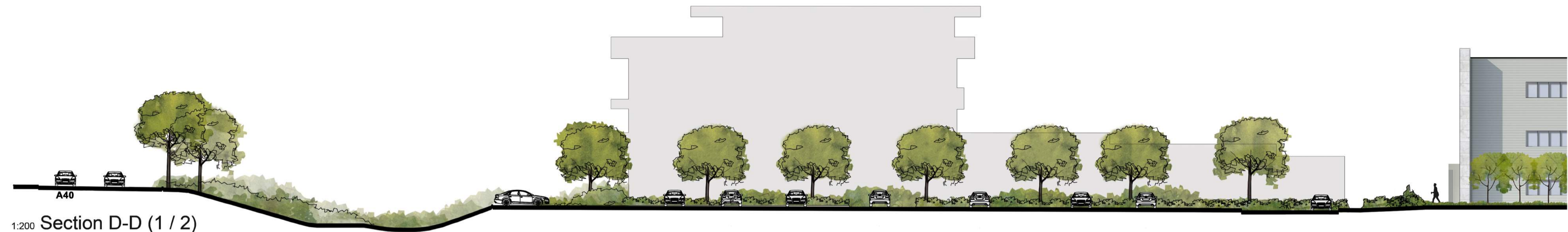
1:200 Section D-D (1 / 2)