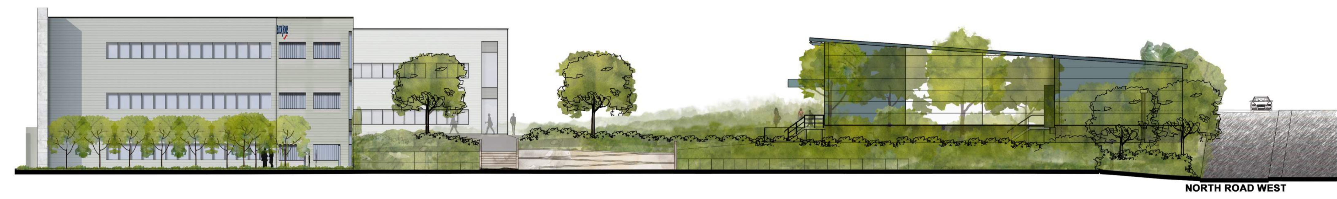
1:200 Section D-D (2 / 2)