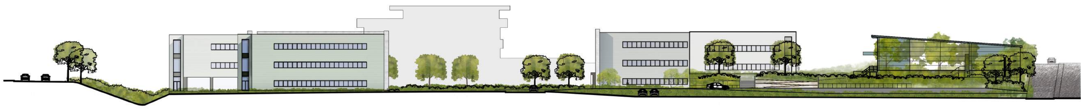
1:500 Section H-H