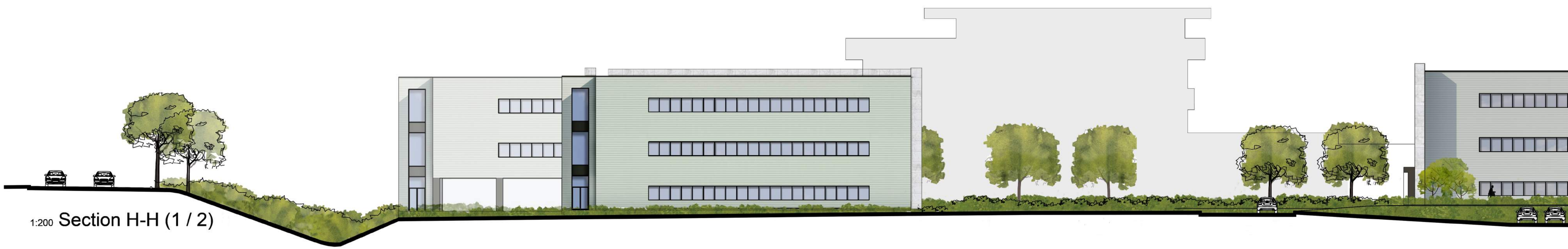
1:200 Section H-H (1 / 2)