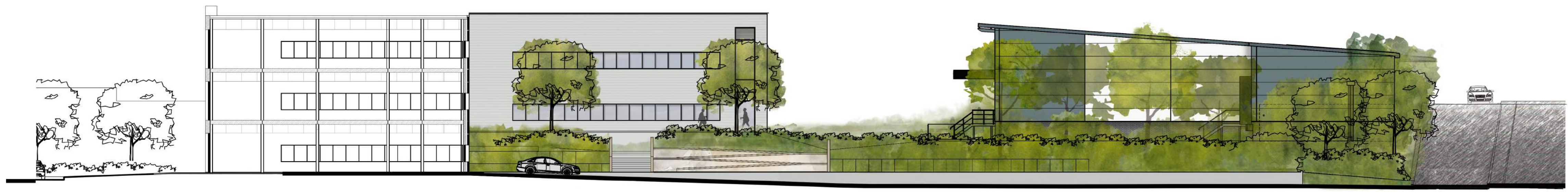
1:200 Section G-G (2 / 2)