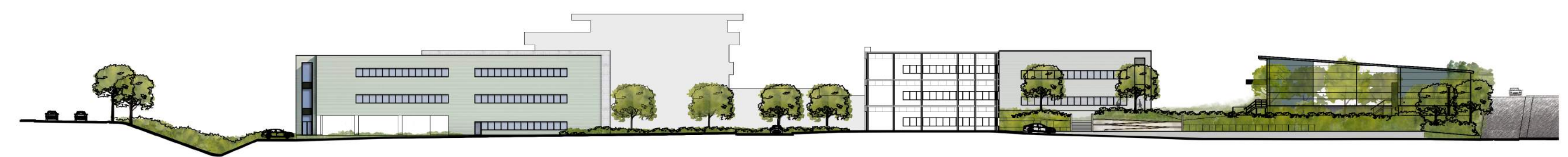
1:500 Section G-G