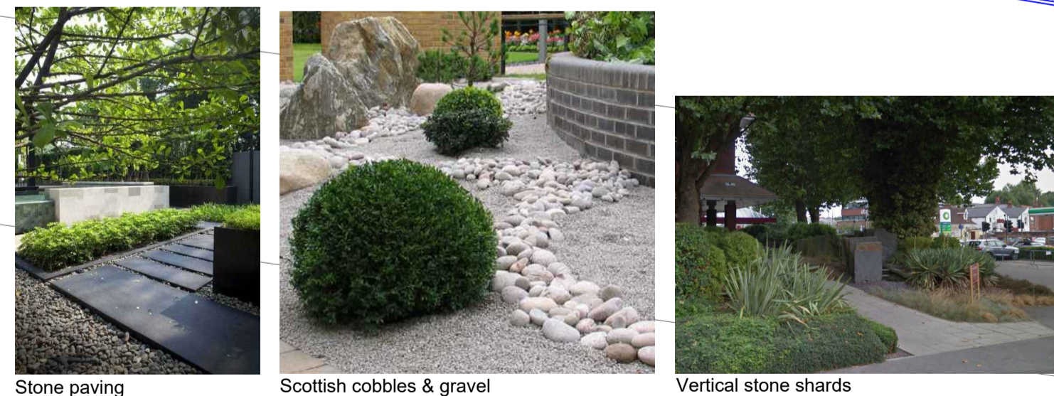
Stone paving Scottish cobbles & gravel Vertical stone shards