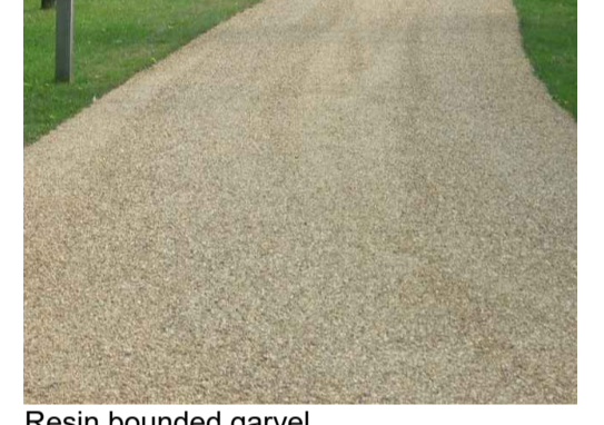
Resin bounded gravel