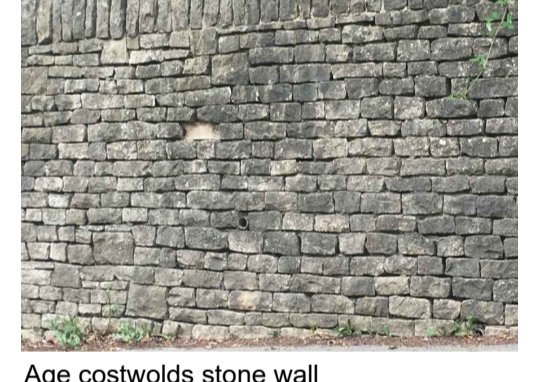
Age costwolds stone wall