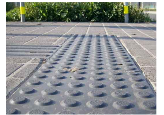
Hazard warning paving slabs