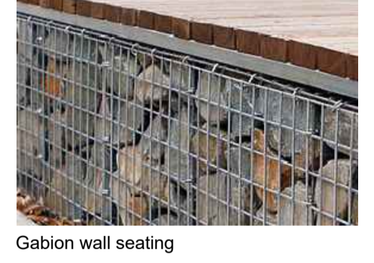
Gabion wall seating