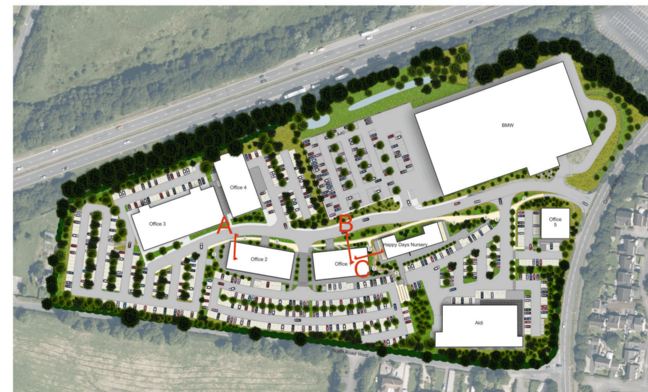
Section Location Plan NTS