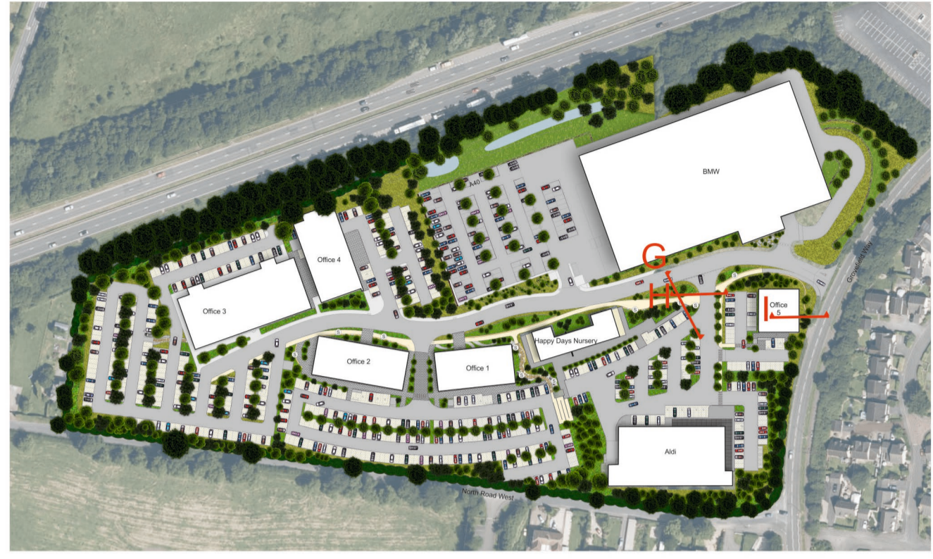
Section Location Plan NTS