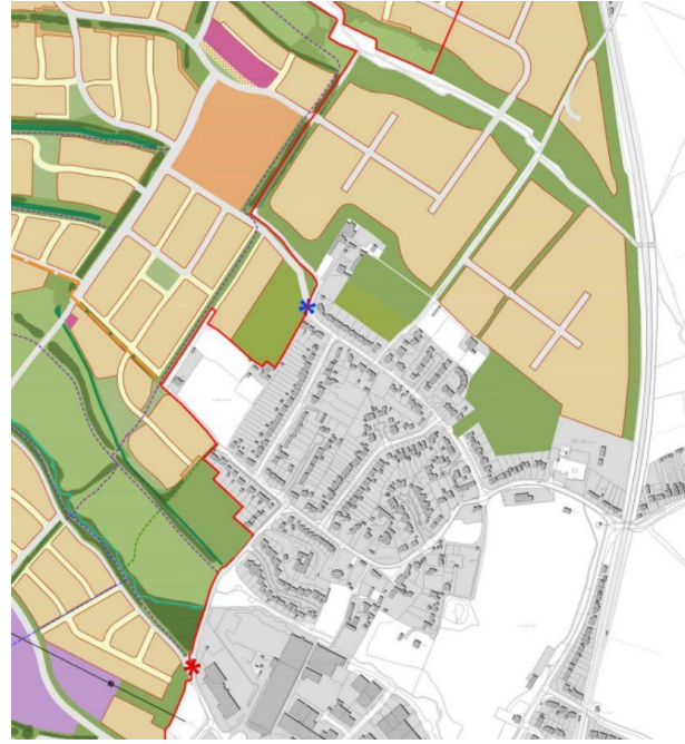
Bloor and Persimmon's proposed green space