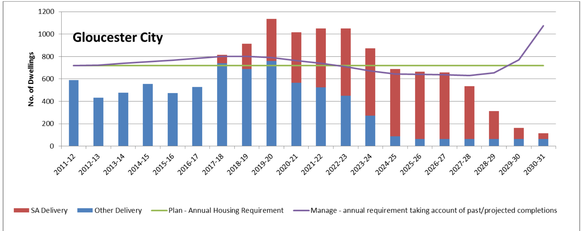
Figure 8.4 Gloucester City Supply over the Plan Period