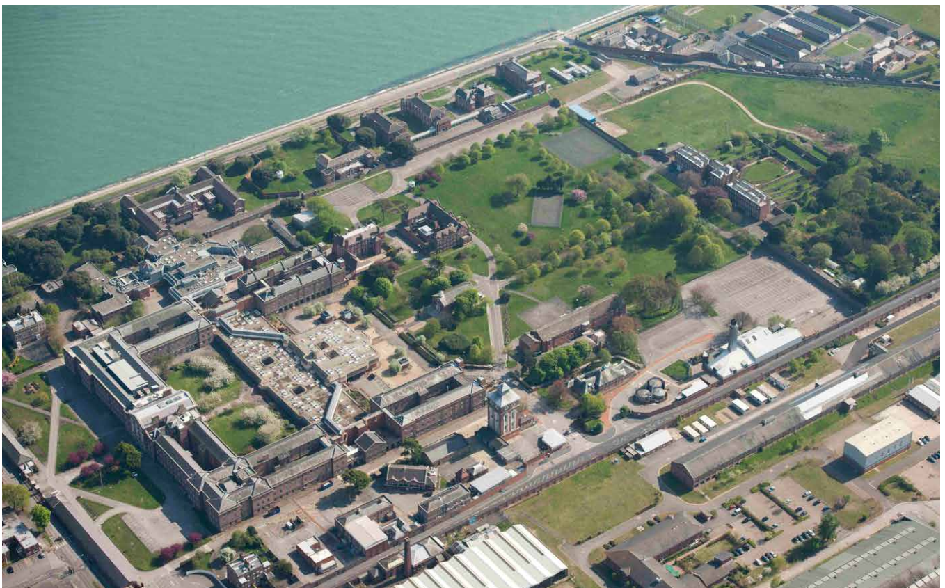
Figure 3 The Royal (Naval) Hospital, Haslar, Hampshire, opened in 1753: its design was highly influential across Europe. Its existing setting was further developed and formalised in the early nineteenth century with walled

Another social institution was the cottage home orphanage, with ‘village homes’ of a domestic character set within an ornamental designed estate. Early charitable examples include the Barnardo’s village homes at Barkingside (London Borough of Redbridge) of 1875 onwards, and the Harris Orphanage (now the Harris Knowledge Park, Preston, Lancashire; registered Grade II), laid out 1884-8 by Preston’s Parks Superintendent. In both cases the homes were grouped around a ‘village green’.