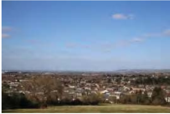
VP2. View looking north from south of area