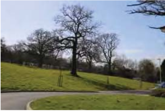
VP1. View looking southwest from north of area.