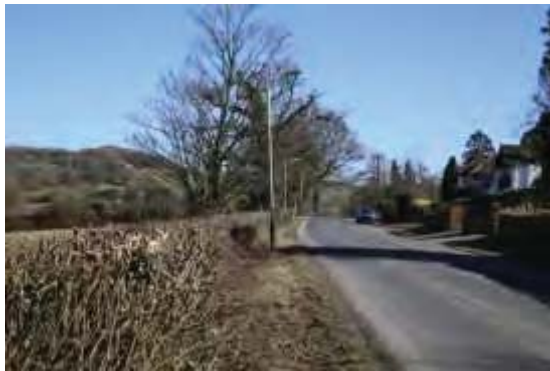
VP4. View looking east along Harp Hill from south of area