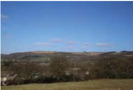
VP3. View looking northeast from southeast of area