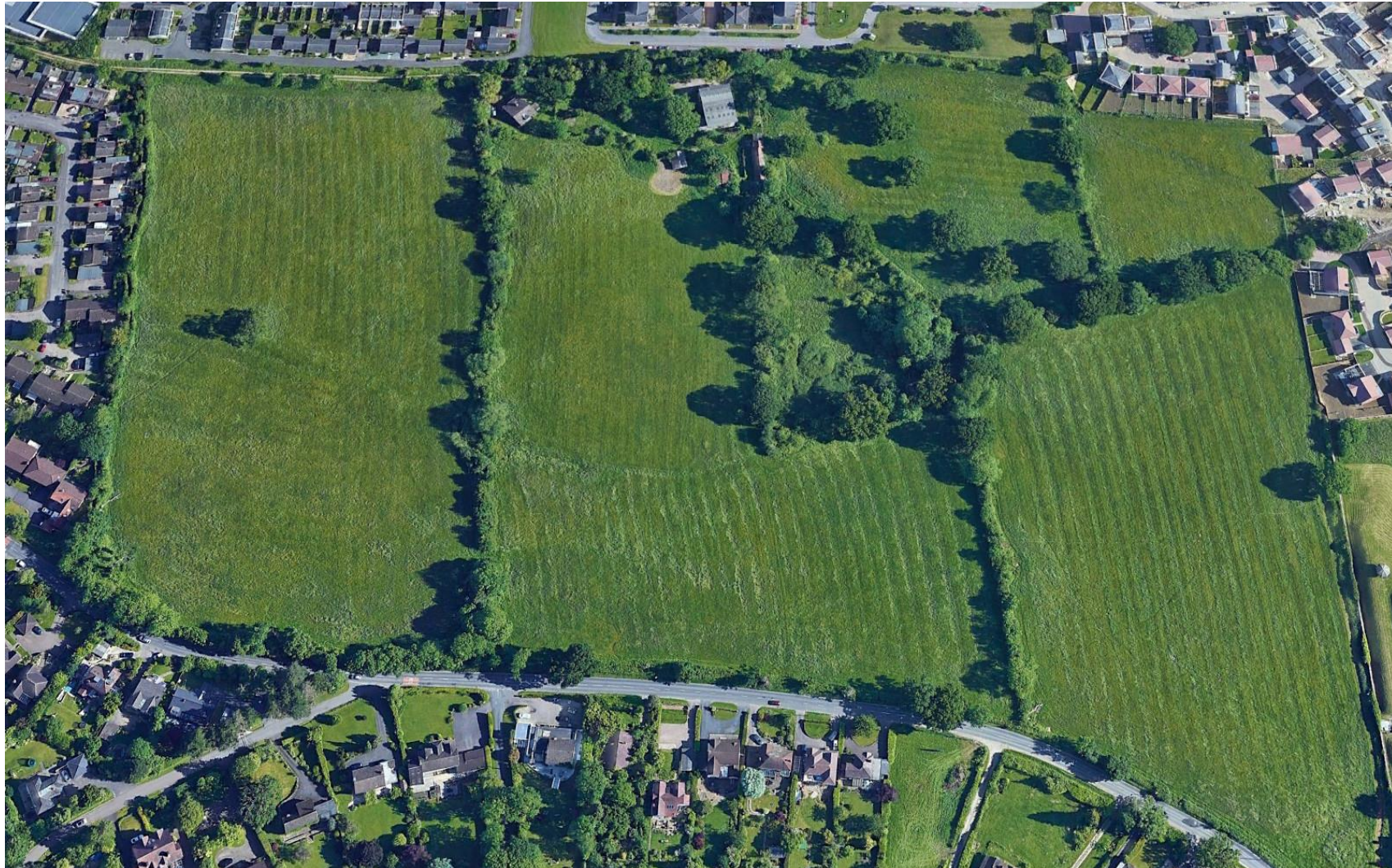
Google Earth image showing extensive ridge and furrow cultivation at Oakley Farm.